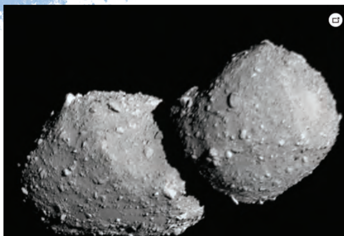
A view of the asteroid Torifune during a flyby of the Hayabusa2 space probe.

"The moment I actually saw this image and the scientific