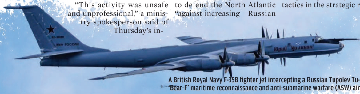
A British Royal Navy F-35B fighter jet intercepting a Russian Tupolev Tu-142 'Bear-F' maritime reconnaissance and anti-submarine warfare (ASW) aircraft

Military experts and European leaders say Russia has ramped up its "hybrid war" tactics in the strategic region.