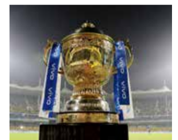
IPL Trophy is seen at the stadium prior to the final 2019 (file photo)

"We will see how the situation pans out," he said. "We will explore options whether we can have it here or overseas."