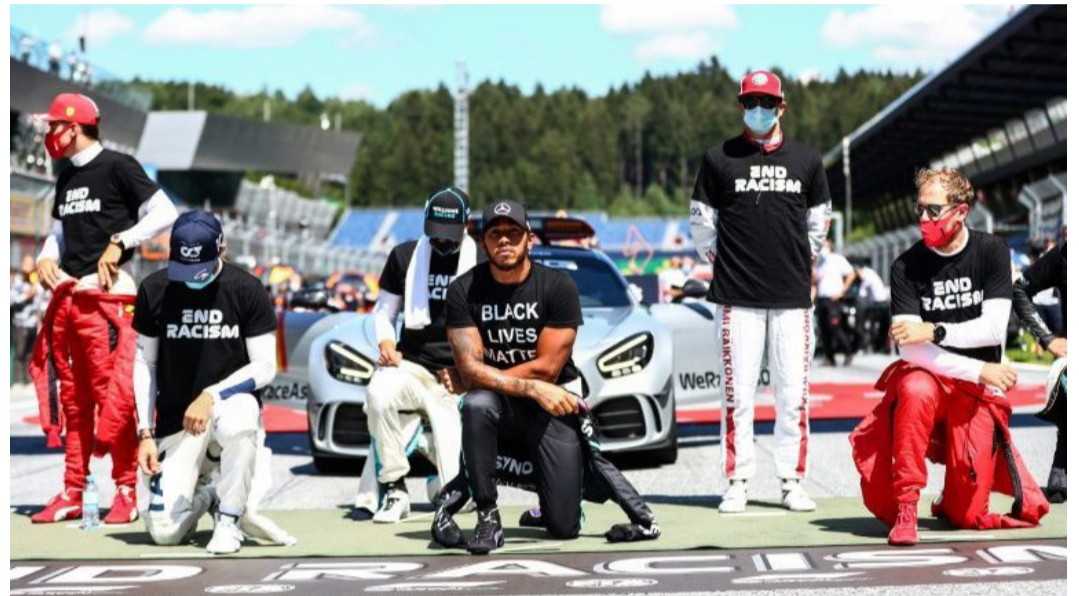
The 2 Seas car in action during the race

"And it's a much, much bigger issue across the world. I think everyone has a right to their own personal choice and, for me, personally, it was what I felt was right to do, but I didn't