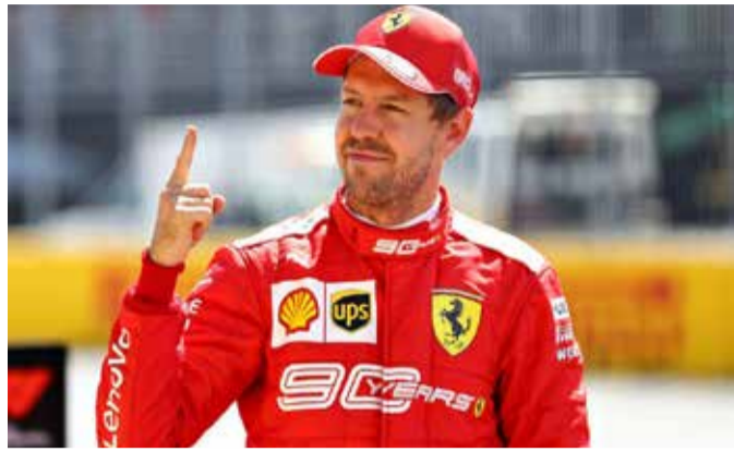
Ferrari's Sebastian Vettel reacts prior to a race (file photo)