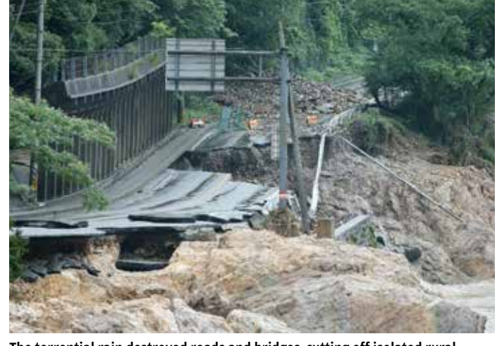
The torrential rain destroyed roads and bridges, cutting off isolated rural communities