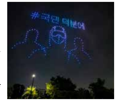
300 unmanned aerial vehicles were programmed to form images above the Han river, but not advertised in advance in consideration of social distancing rules