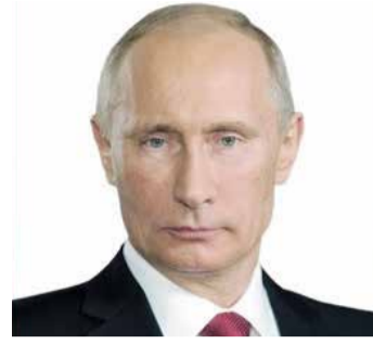
Russian President Putin

the Russian President, Vladimir Putin. With the backing of their strong Bahraini-Russian relations, they agreed to activate joint committees to serve shared interests and achieve the two friendly countries' aspirations. HM King Hamad hailed President Putin's key role to enhance bilateral relations and consoli-