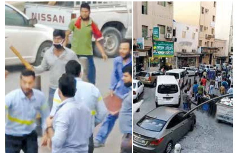
Screenshots of the video.

Others involved in the incident are also being investigated.