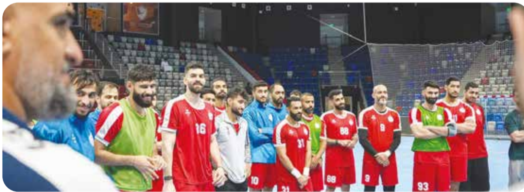
Al Najma's squad during a pre-tournament training session

They begin their campaign this evening against hosts Kuwait Sports Club at 6pm Bahrain time. The match marks their first step in a bid to secure a third Asian club title and qualification for the 2026 IHF Men's Club