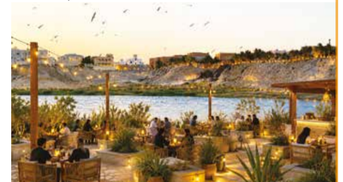
AI-generated vision of the new Buhair Valley landscape, blending nature and modern design

site's natural integrity. Can Bahrain apply the same thinking to Buhair Valley?