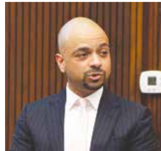
Osama Al Alawi, Minister of Social Development

severe intellectual disabilities and multiple disabilities.