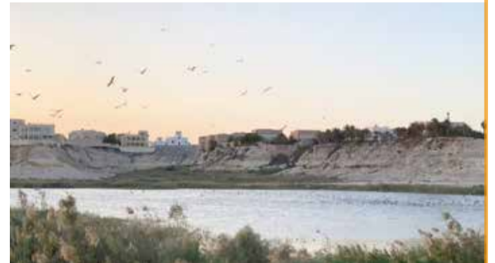
Buhair value at present

Saudi Arabia's Jabal Al Qarah in Al Ahsa transformed its caves and rock formations into a managed destination — with cafes, walkways and viewing areas — without sacrificing the