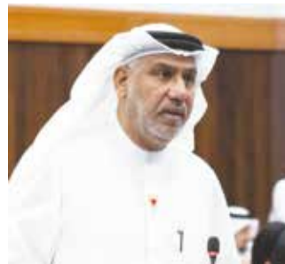
Ahmed Qarata, Parliament's Second Deputy Speaker

The biggest portion, BD18.3m, was used for disability allowances under Bahrain's Persons with Disabilities Law. The increase followed a 2023 decision, agreed with Parliament, to double allowances for people with severe disabilities, including those with cerebral palsy, autism spectrum disorder,