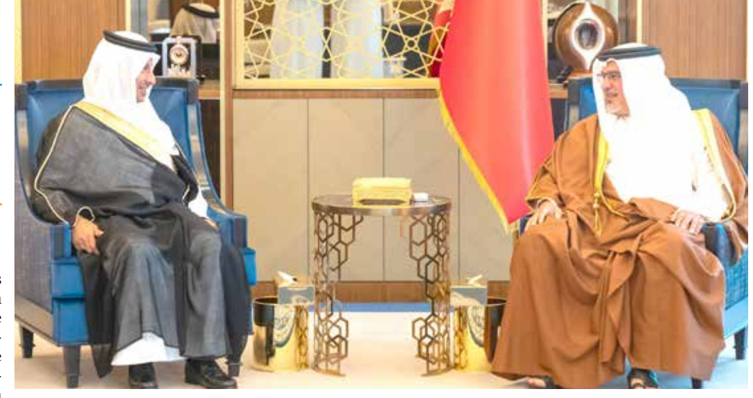
HRH the Crown Prince and Prime Minister meets with the Saudi Tourism Minister

with the Minister of Tourism pins the longstanding relation- the two Kingdoms, which are to achieve common goals.