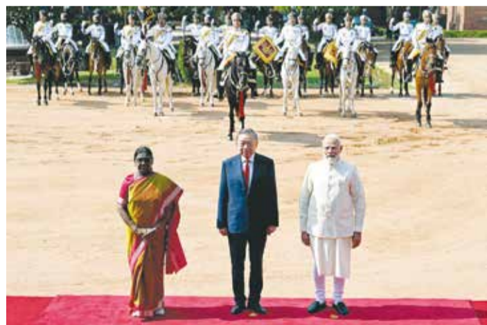
India's President Droupadi Murmu (L) alongside Prime Minister Narendra Modi (R) poses for a photograph with her Vietnamese counterpart To Lam during a ceremonial reception at the presidential palace Rashtrapati Bhavan in New Delhi

Both sides said the discussions focused on sectors like education, rare earth minerals and digital payment systems, reflecting "the enhanced compre-