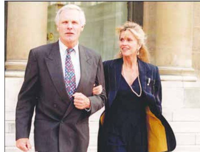
Media mogul Ted Turner and his wife, actress Jane Fonda