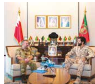
HH Shaikh Nasser with a senior UK defence official.

HH Shaikh Nasser praised the ongoing coordination between Bahrain and the United Kingdom and stressed the importance of further strengthening joint efforts in line with existing strategic agreements. They discussed regional and