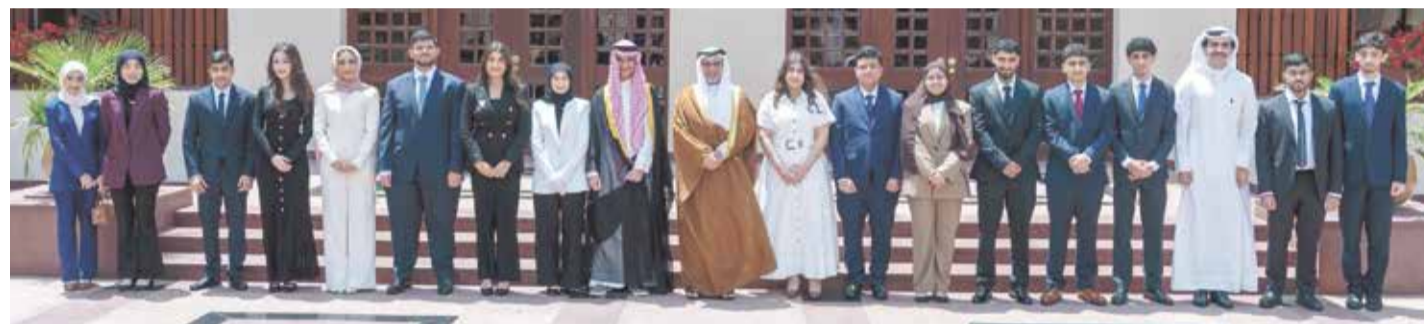
HRH Prince Salman with the youth scholars

He also praised parents for supporting their children’s education and wished the students