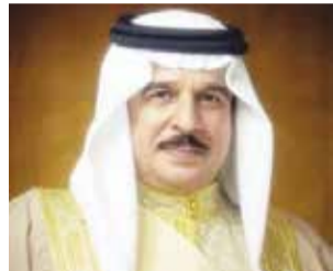
TDT | Manama

HM King Hamad bin Isa Al Khalifa issued a royal order ending the fourth session of the sixth legislative term of the Shura Council and the Council of Representatives, according to an official decree.