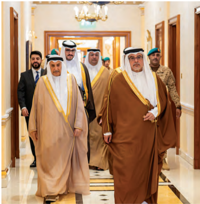
HRH Prince Salman chairs the weekly Cabinet meeting

The Cabinet strongly condemned the hostile Iranian aggression that resulted in injuries to citizens, threatened public