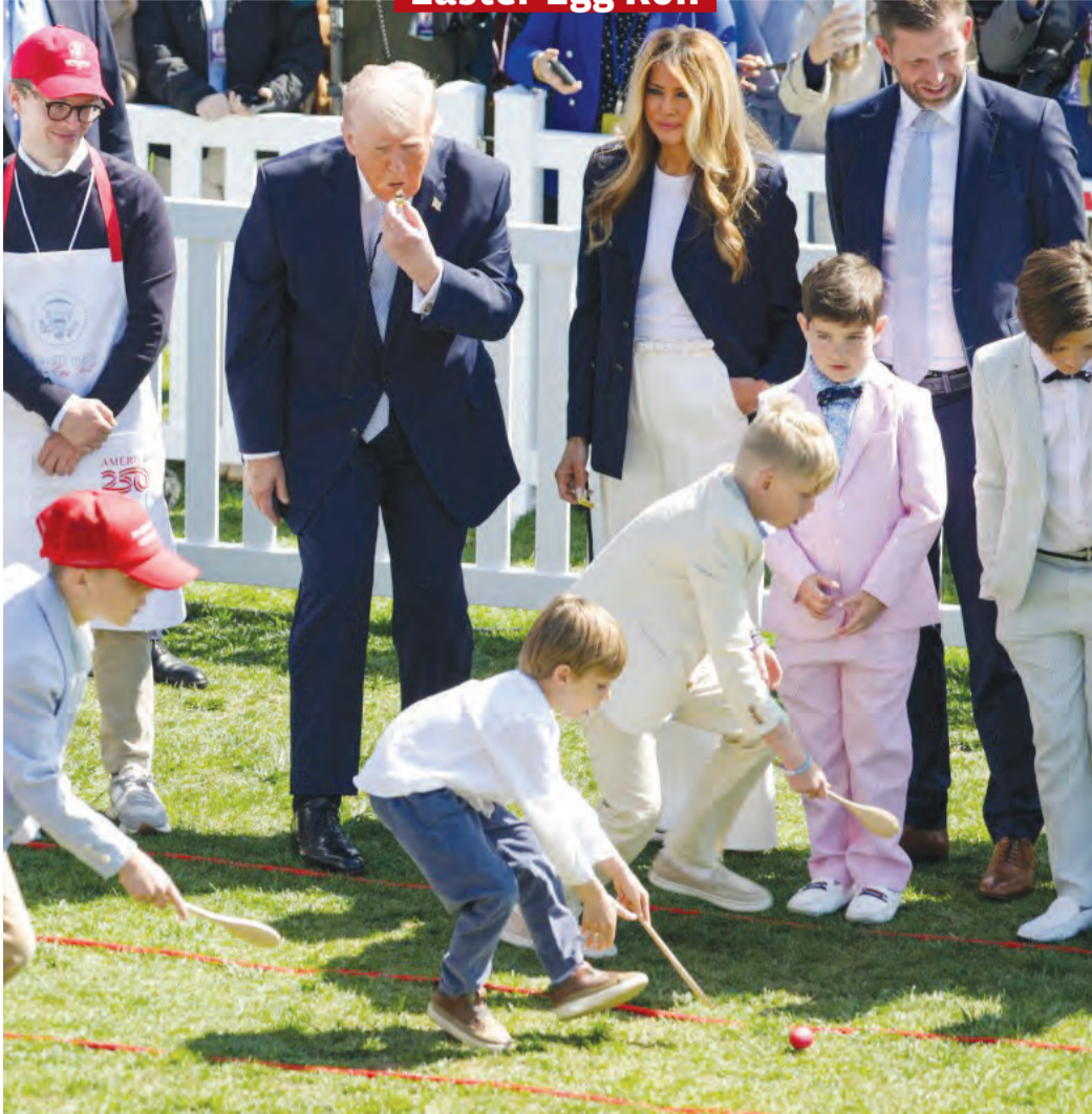
US President Donald Trump, first lady Melania Trump, and Eric Trump watch a race during the White House Easter Egg Roll on the South Lawn of the White House in Washington, DC. The Easter Egg Roll is a White House tradition dating back to 1878. The Trumps also honored the 250th anniversary of the United States during the event.