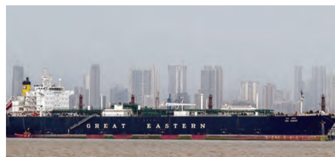
A trader works on the floor of the New York Stock Exchange

Indian-flagged LPG tanker passed through the strait