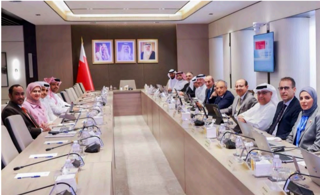
Shura Council's Financial and Economic Affairs Committee members