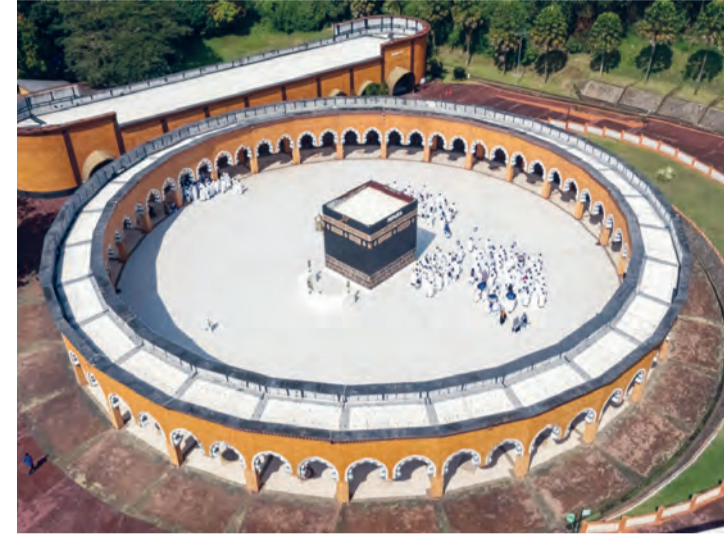
An aerial image shows prospective Indonesian pilgrims practicing circumambulation rituals around a replica of the Kaaba, Islam's holiest shrine, during a training session at the Al Mahmudah Manasik Training Center (AMTC) in South Tangerang. The centre provides a simulated experience of Mecca's pilgrimage sites ahead of the Hajj season in late May. Indonesia, home to the world's largest Muslim population, has been allocated a Hajj quota of 221,000 pilgrims for 2026, but faces long waiting lists that can stretch for decades in some regions.