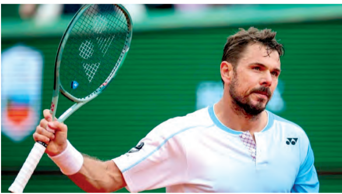
Stan Wawrinka reacts after the match | Monte Carlo

Stan Wawrinka bid farewell to the Monte Carlo Masters as the 2014 champion fell 7-5, 7-5 to Sebastian Baez in the first round yesterday.