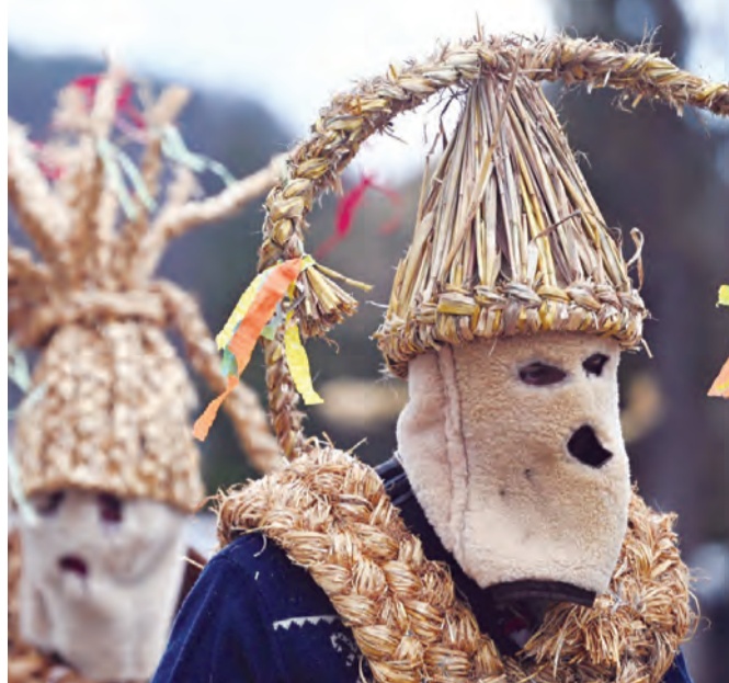
Polish bachelors wearing traditional straw costumes parade through the streets and splash water on the villagers in a ritual for fertility and a bountiful harvest as they celebrate Easter Monday in Dobra, Lesser Poland Voivodeship