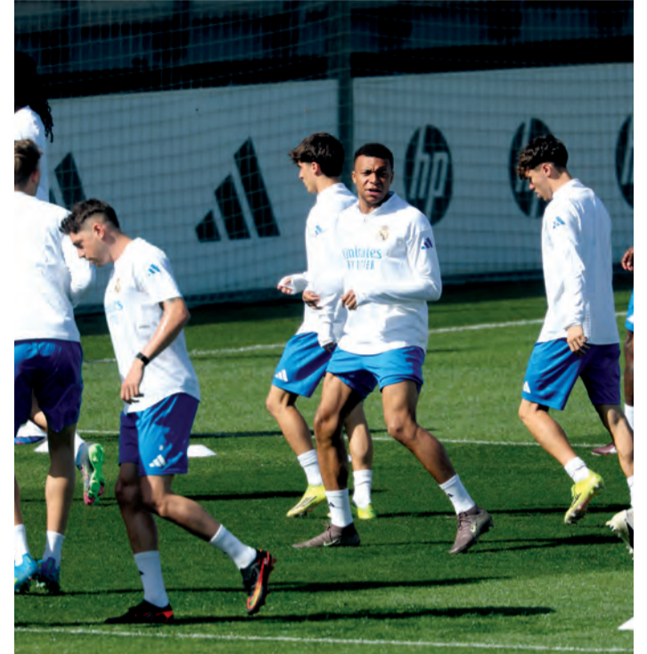
Real Madrid's French forward #10 Kylian Mbappe (C) and teammates attend a training session

and Arbeloa said he would keep betting on the squad's stars when they are available.