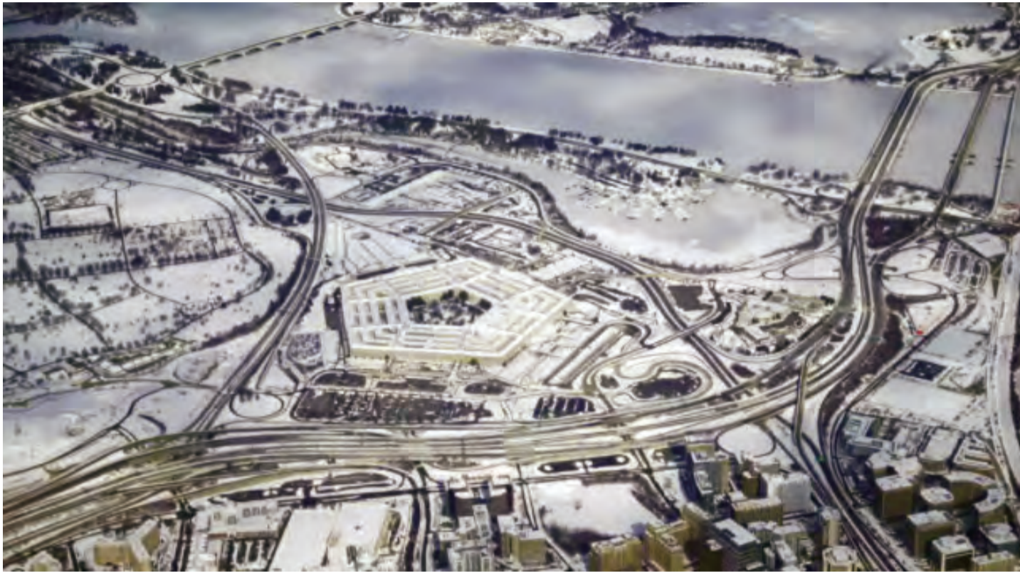
In the Iran war the Pentagon is using an AI program that is potentially of the most consequential changes in modern warfare