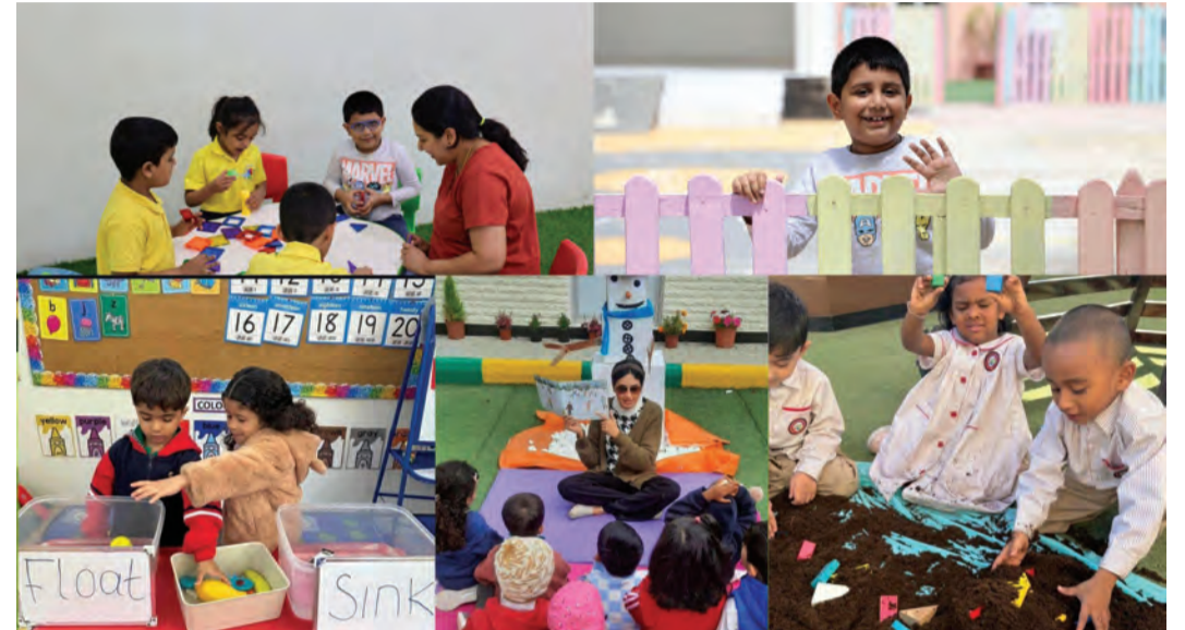
Children at play in a physical kindergarten classroom, engaging in hands-on learning and group activities.

Mona Alqaed from 'Kidzworld kindergarten' management noted that virtual classrooms can-