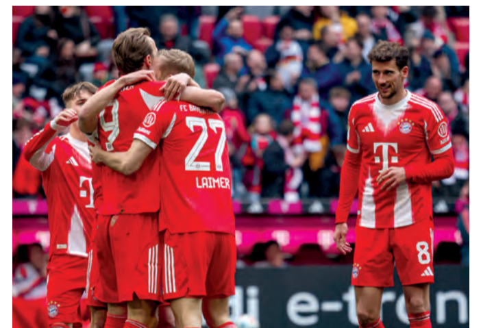
Bayern Munich's English forward #09 Harry Kane (2nd L) celebrates with teammates (file photo)