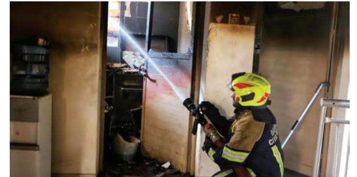
Civil Defence teams extinguish a house fire caused by an electrical short circuit

He also pointed out that many housing-related violations are not intentional, but often re-