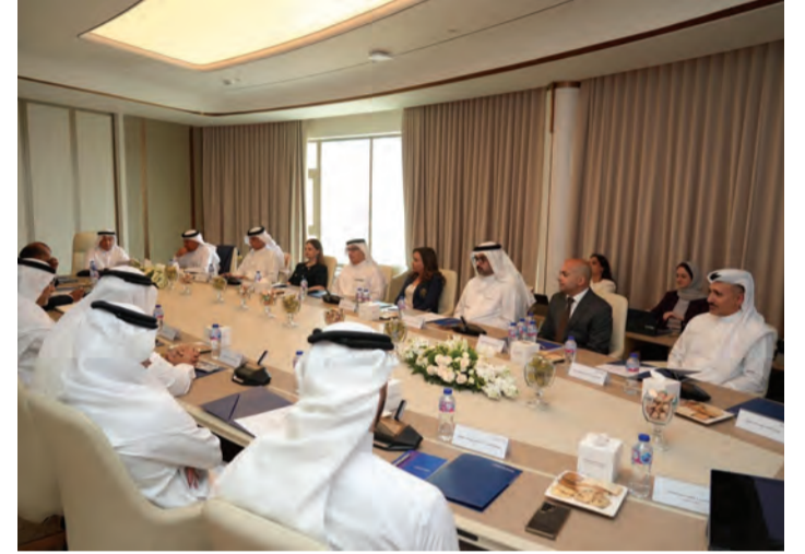
The Board of Directors of the Bahrain Chamber held its inaugural session for the 31st term

ued role in supporting commercial and industrial growth and in reinforcing Bahrain's position as a competitive economic hub regionally and internationally.