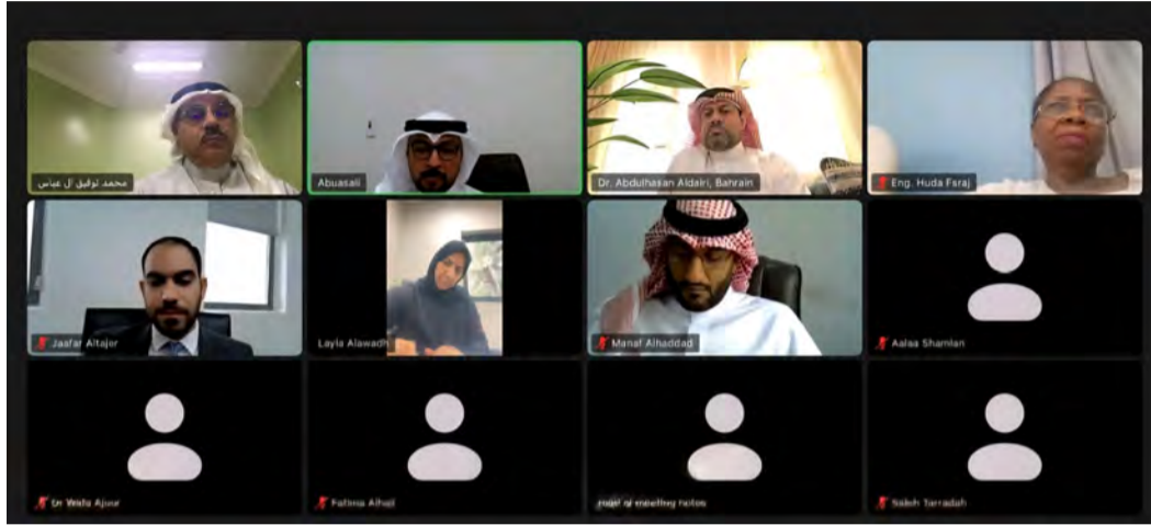
Services and Public Utilities Committee of the Capital Trustees Board meeting held online

Once limited in scope, mangrove planting is now developing into a structured ecological network that protects shorelines while restoring marine habitats closely tied to local