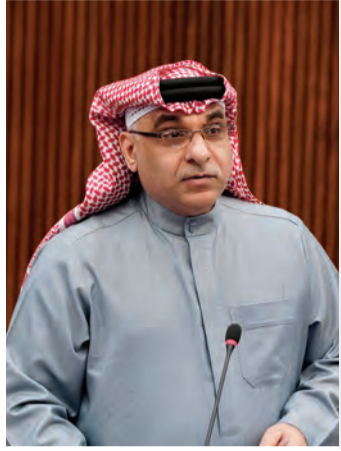
Mohammed Darwish TDT | Manama

Five MPs have proposed rent relief for Bahraini factory and shop owners has been proposed by five MPs, who want a six-month waiver on industrial plot lease fees and shop rents collected through the municipalities after the economic effects of the Iranian attacks.