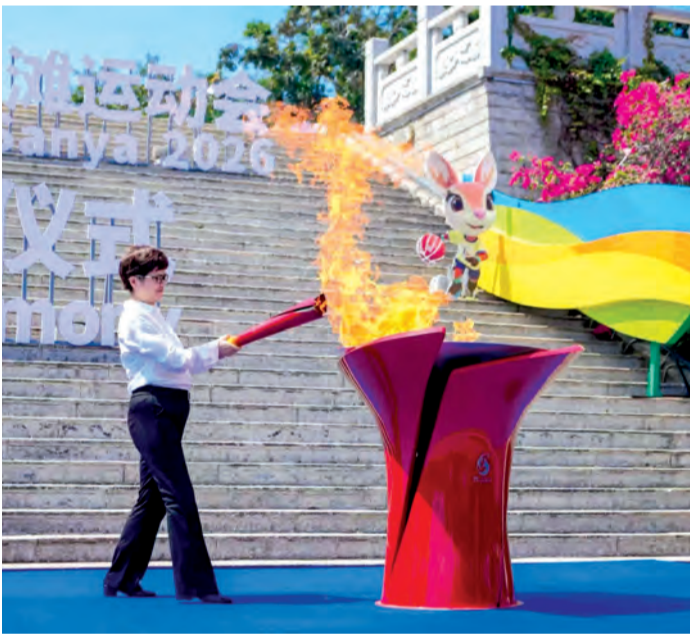
Torch lit for the 2026 Asian Beach Games in Sanya