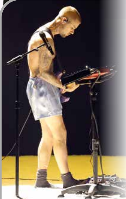
Justin Bieber performs onstage during the 68th GRAMMY Awards