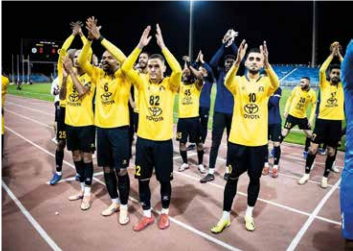
Al Ahli applaud supporters after a tense win