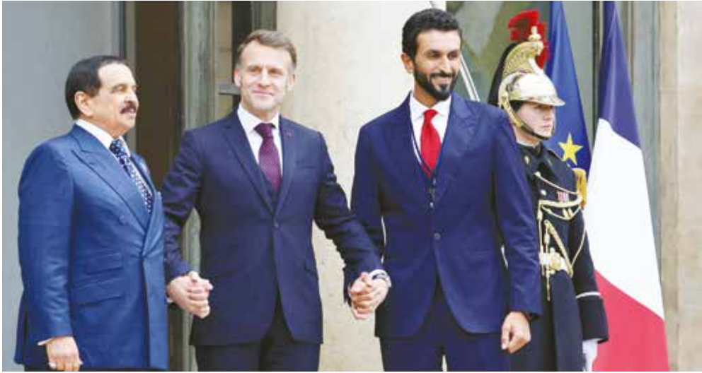
France's President Macron welcomes HM King and HRH Shaikh Nasser at the Elysee Presidential Palace in Paris