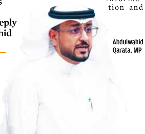
Abdulwahid Qarata, MP

Examples of zero-rated or exempt items include 94 ba-sic food products, healthcare and education services, medi-cines and medical equipment, construction services for new properties, the sale and lease of homes and commercial units, precious stones, invest-ment-grade gold, silver and platinum, core financial serv-ices, oil and natural gas, and local and international transport.