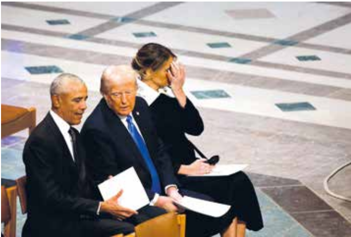
Donald Trump speaks with Barack Obama as Melania Trump looks on (file photo)

The office of California Governor Gavin Newsom, a potential 2028 Democratic presidential candidate and a prominent Trump critic, slammed the post.