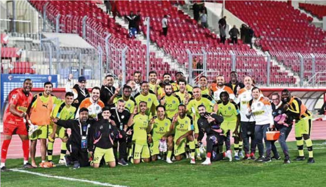
A’ali squad celebrate their qualification