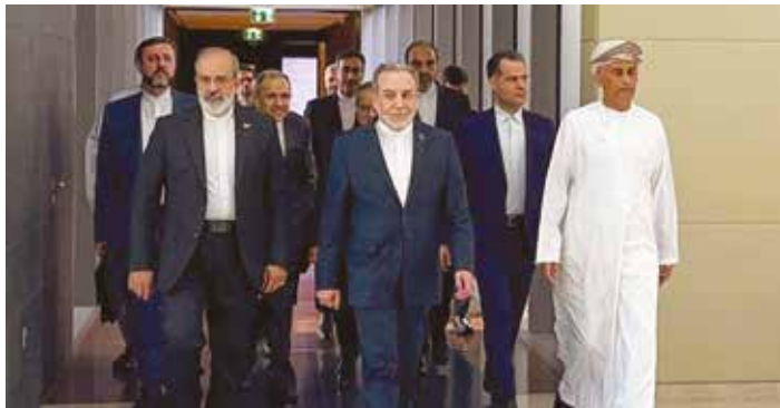
Iran's Foreign Minister Abbas Araghchi (C) arrives for a meeting in Muscat.

The talks took place following threats from Washington and after it recently deployed an aircraft carrier group to the Middle East following Iran's deadly