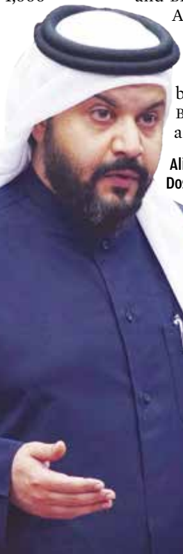
Ali Saqer Al Doseri, MP

In total, 23,499 pensioners receive more than BD 1,000 a month. The largest group, 19,346 retirees, receive between BD 1,000 and BD 1,999.