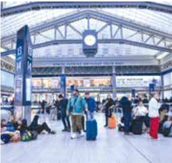
Travelers sit on the floor inside Penn Station waiting for their trains

But New York's Penn Station and Washington's Dulles International Airport are also in Trump's sights, CNN and NBC