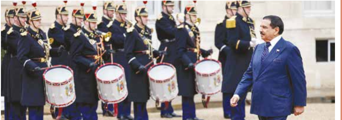
HM King Hamad arrives at the Elysee Presidential Palace to meet with French President in Paris