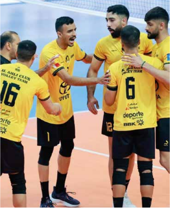
Al Ahli players rallying together mid-match