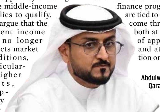
Abdulwahid Qarata, MP

certificates and most housing finance programmes are tied to strict income thresholds, both at the time of application and at allocation or payout.