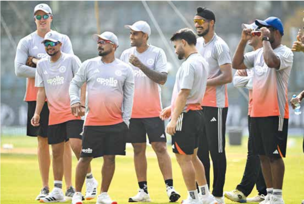
India’s captain Suryakumar Yadav (C) interacts with his teammates during training session

“There’s so many people coming to watch in the stadiums,