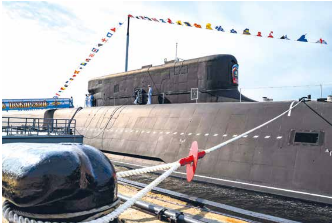
a naval flag-raising ceremony aboard the latest Project 955A (Borey-A) strategic nuclear-powered submarine Knyaz Pozharsky in Severodvinsk

The expiration of New START, which restricted the United States and Russia to 1,550 de-