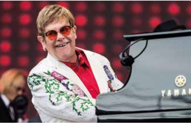
Elton John

Pop icon Elton John yesterday accused the publisher of two UK tabloids of “abhorrent” privacy invasions “outside even the most basic standards of human decency” as he testified at London’s High Court. Giving evidence in the joint legal action against Associated Newspapers Ltd (ANL) -- the publisher of the Daily Mail and The Mail on Sunday -- John claimed the papers had unlawfully accessed his and his family’s medical records. Other complainants in the case include Prince Harry, King Charles III’s younger son, and actor Liz Hurley. “I have found The Mail’s deliberate invasion into my medical health and medical details surrounding the birth of our son Zachary abhorrent and outside even the most basic standards of human decency,” John wrote in a witness statement released as he began testifying by video link. Wearing a green blazer and purple tie, the 78-year-old