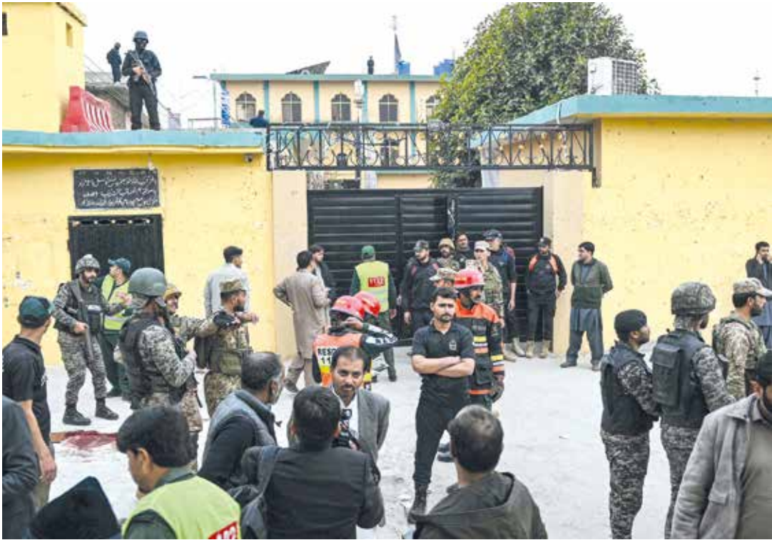
Security personnel stand guard outside a mosque following an explosion