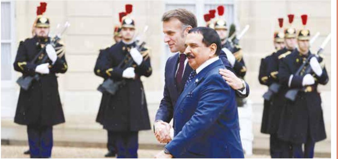
Macron (L) welcomes HM King Hamad bin Isa al-Khalifa at the Elysee Presidential Palace in Paris