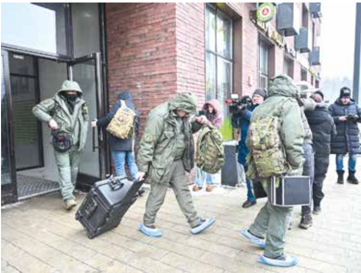
Investigators leave a high-rise residential building, the scene of an assassination attempt on Russian Lieutenant General Vladimir Alekseyev, in Moscow

Russian investigators said he was shot by an “unidentified in-