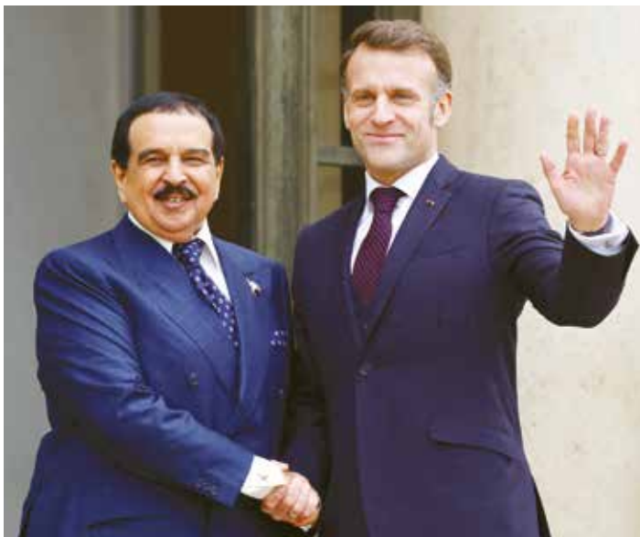
France's President Emmanuel Macron (R) welcomes HM King Hamad bin Isa al-Khalifa at the Elysee Presidential Palace in Paris

The agreement was signed for Bahrain by His Highness Shaikh Nasser bin Hamad Al Khalifa,