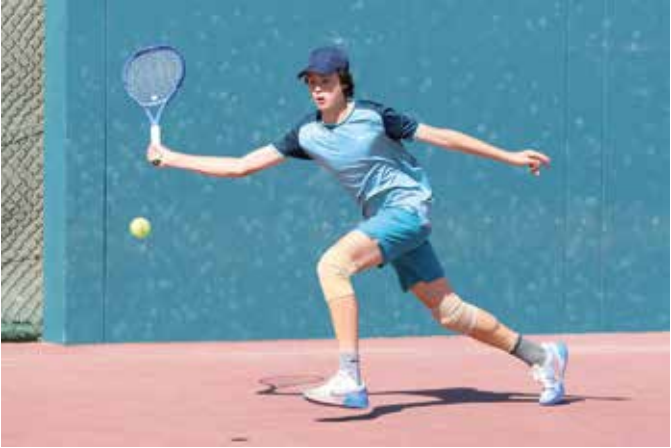
TDT | Manama