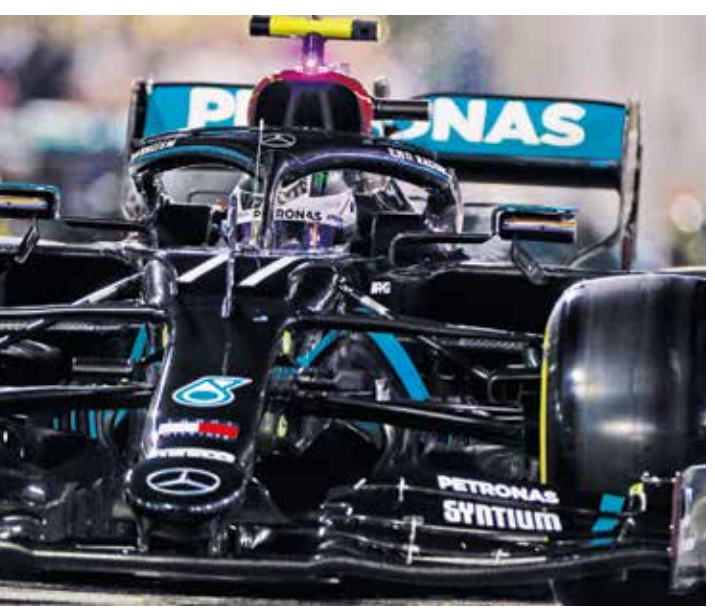
Bottas charges to pole during qualifying last night

throughout the weekend and particularly through qualifying.