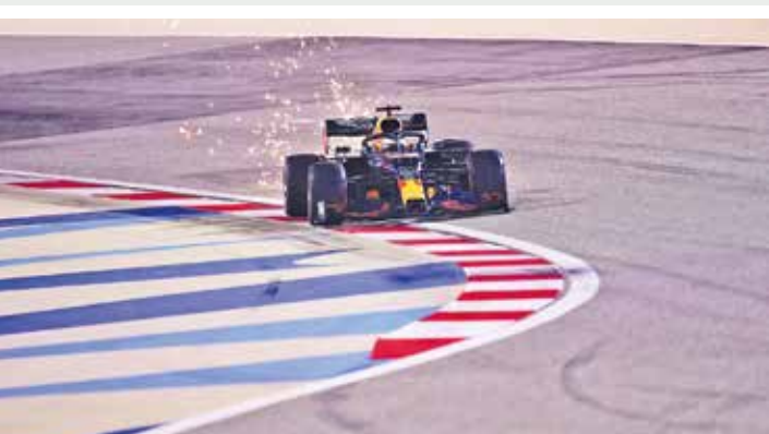
Verstappen in action during qualifying at BIC