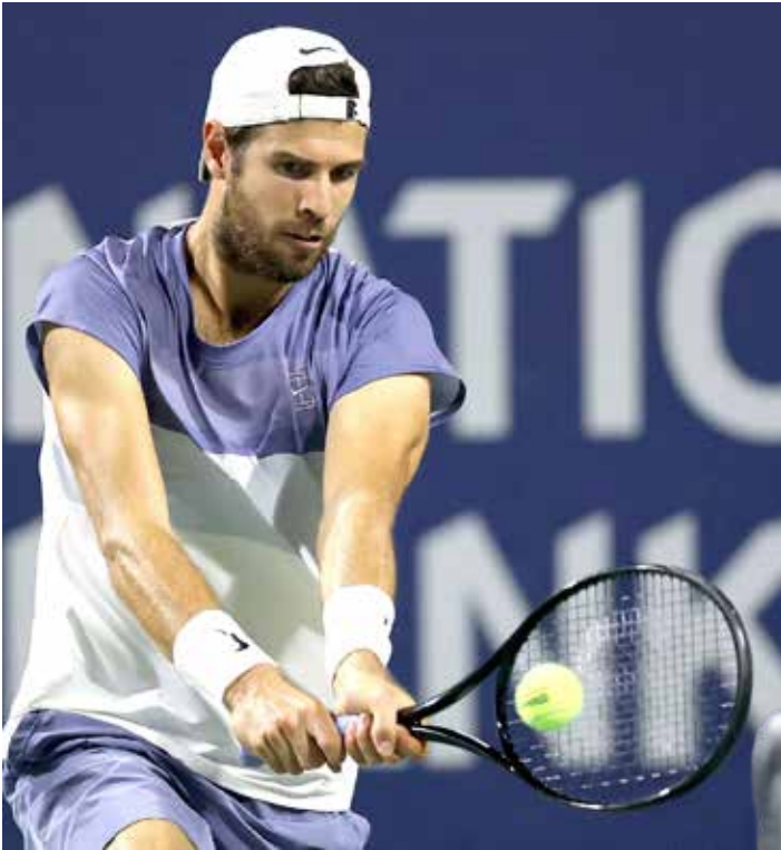
Karen Khachanov returns a shot to Alex Michelsen

Alexander Zverev reached his 21st Masters 1000 semi-final on Monday by ending the Canadian title defence of Alexei Popyrin 6-7 (8/10), 6-4, 6-3 at the ATP Toronto Masters. The final game, with Zverev serving at 5-3, was interrupted by shouts from an unruly fan who was tossed out by security. The distraction ended a run of 14 consecutive points on serve, with the seed double-faulting once he was able to continue serving. He finished off the evening with a sharp volley winner at the net on his first match point. Zverev completed his 40th win of the year in just over two and a half hours. The world number three won the tournament in 2017 but had not been past the quarter-finals in Canada since. “After losing the first set, I had to tell myself we were both playing well,” the holder of seven Masters trophies said.