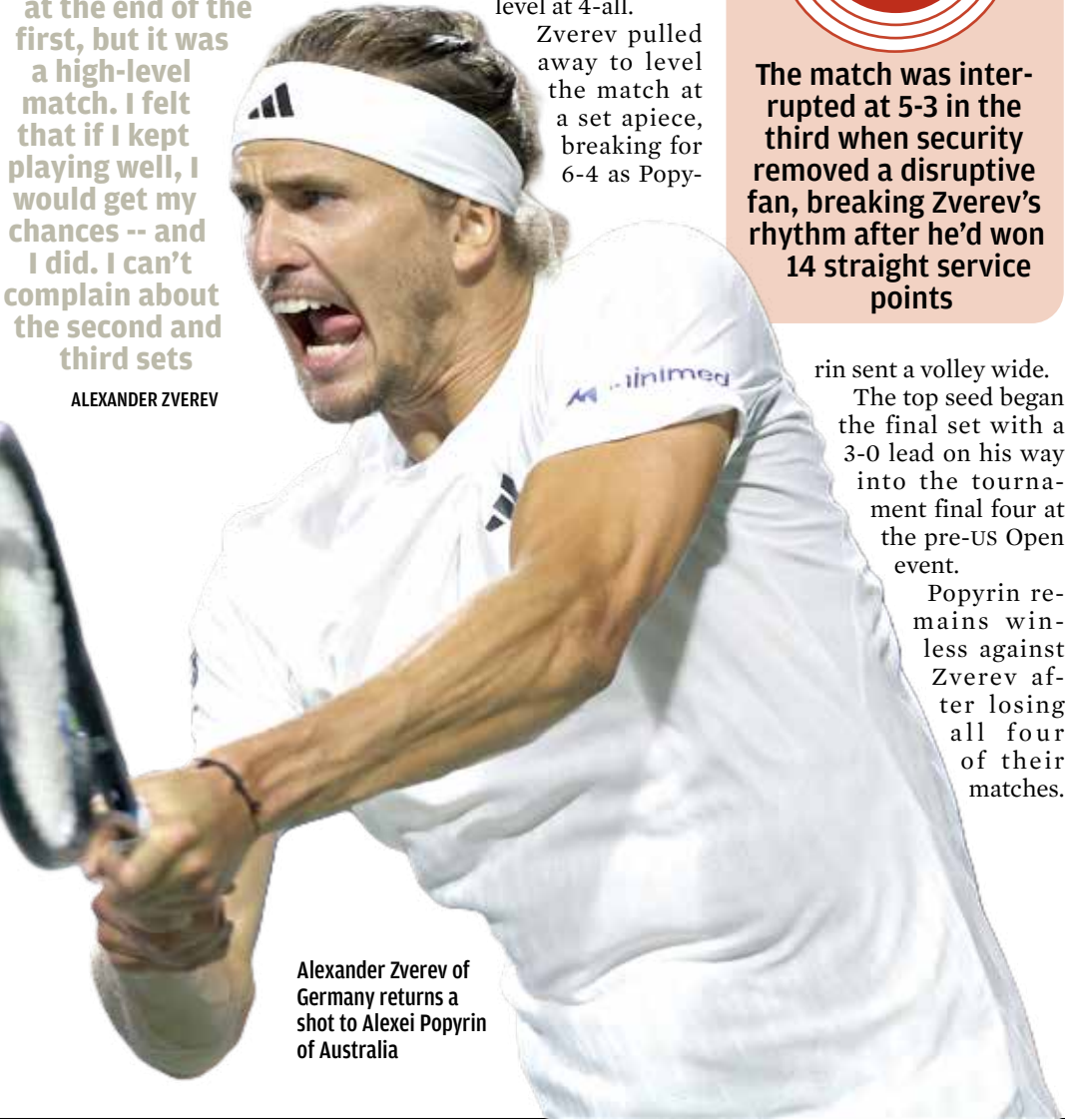
Alexander Zverev of Germany returns a shot to Alexei Popyrin of Australia