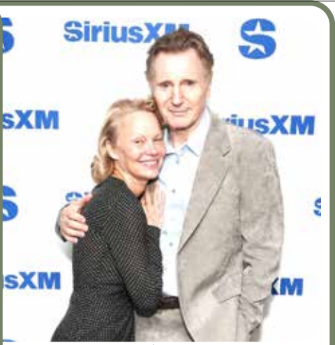
Pamela Anderson and Liam Neeson

Speaking on his SiriusXM radio show last week, he said: “Natasha was a dear friend of mine and I’m gonna tell you something. I and all of the friends in this circle are very much stanning whatever this is.