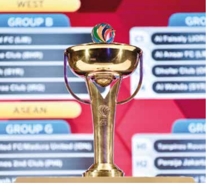
AFC Cup trophy is seen in front of a screen displaying the results of the group stage draw (file photo)

The clubs have already played with four points each. Ahed on November 4. are third with three points