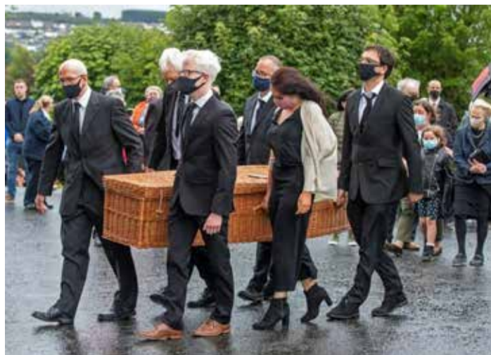
The wicker casket containing Hume's remains was brought into St Eugene's Cathedral in Londonderry on Tuesday evening

"Mindful of the Christian faith that inspired John Hume's untiring efforts to promote dialogue, reconciliation and peace.... His Holiness commends his noble soul to