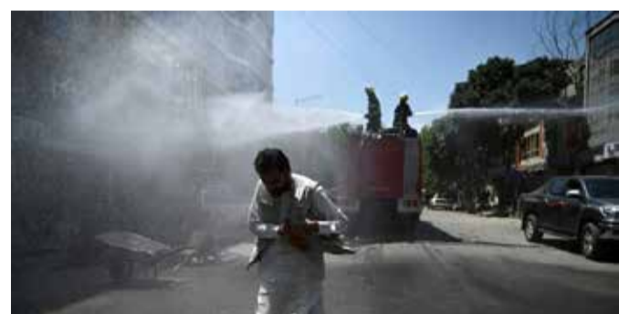
More than 18 million people worldwide have been infected with the virus since it first emerged in China late last year.