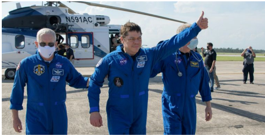
Bob Behnken (c) and crewmate Doug Hurley are best friends in real life and both are married to fellow astronauts

"The atmosphere starts to make noise, you can hear that rumble outside the vehicle and as the vehicle tries to control,