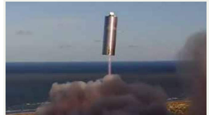
Shortly after the test flight, which lasted just under a minute, SpaceX founder Elon Musk tweeted: "Mars is looking real."