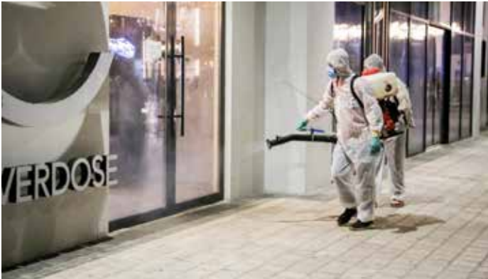
Volunteers carrying out the sanitisation operation at Block 338

the Shabab Al Naim team carried out the operations. They had previously done the same in several other areas of the capital, including in Jid Ali, Juffair and Um Al Hassam.