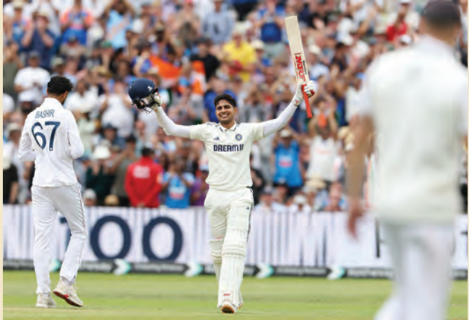
India's captain Shubman Gill reacts to reaching his century on day four of the second cricket test match between England and India at Edgbaston cricket ground in Birmingham, central England

playing a good length ball from Tongue for a six and his trademark falling sweep shot led to a four against off-spinner Shoaib Bashir.