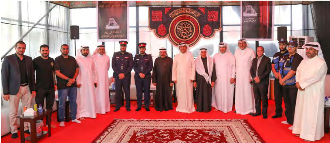
H.E. Ali bin Al Shaikh Abdulhussain Al Asfoor with centre leaders during an inspection tour of a key mourning centre

The Northern Governor, His Excellency Ali bin Al Shaikh Abdulhussain Al Asfoor, has urged mourning centres to play an expanded role in mentoring young people, calling for their transformation into social and educational hubs that extend their influence beyond the Ashura season. During an inspection tour of key mourning centres in Maqaba, Jannusan, and Abu Quwa, the Governor underscored the importance of using the spiritual weight of Ashura to strengthen national values among the youth. H.E. stressed that religious leaders should act as year-round role models, linking young people to national initiatives and nurturing their sense of responsibility and belonging. His Excellency reiterated the Governorate's full commitment to the directives of the Minister