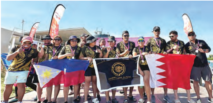
The team makes Bahrain and the Philippines, as well as other countries, proud

Overwhelmingly, a team of 16, including 12 OFWs residing in Bahrain, they travelled to Barcelona not only to compete but