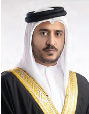
HH Shaikh Khalid

On Arab Youth Day, His Highness Shaikh Khalid bin Hamad Al Khalifa, First Deputy Chairman of the Supreme Council for Youth and Sports and President of both the General Sports Authority and Bahrain Olympic Committee, emphasised the pivotal role of sports in empowering Arab