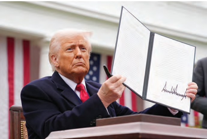
U.S. President Donald Trump displays a signed executive order imposing tariffs on imported goods during a “Make America Wealthy Again” trade announcement event in the Rose Garden at the White House in Washington, DC, on April 2, 2025

“I signed some letters and they’ll go out on Monday, probably 12,” Trump told reporters aboard Air Force One, adding