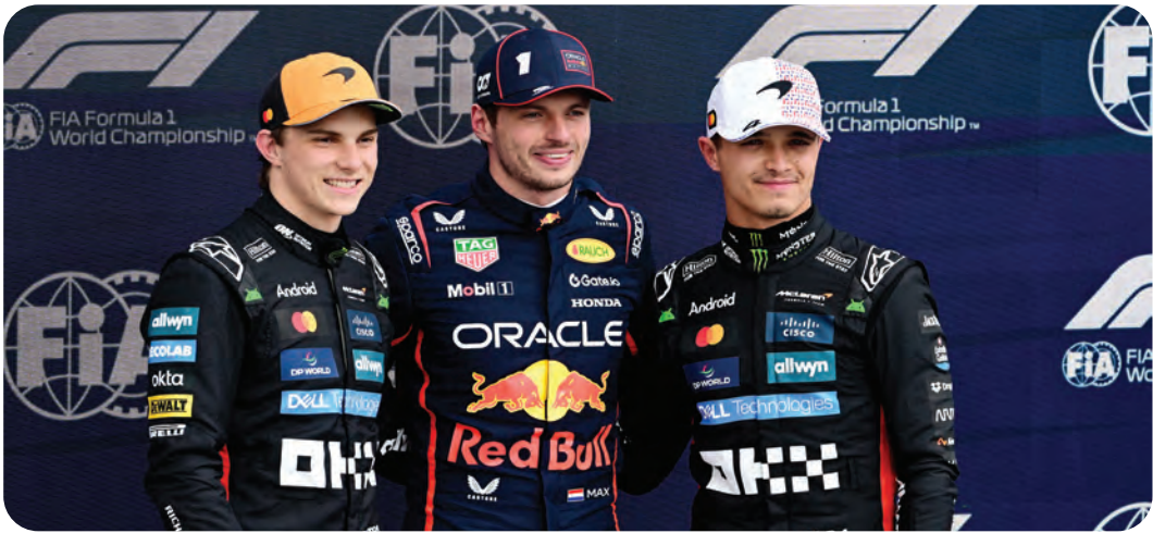
(L to R) McLaren’s Australian driver Oscar Piastri, Red Bull Racing’s Dutch driver Max Verstappen, McLaren’s British driver Lando Norris pose for a photo following the qualifying session ahead of the Formula One British Grand Prix at the Silverstone motor racing circuit in Silverstone, central England