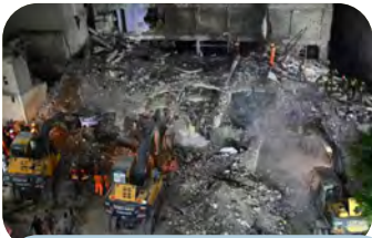
Search continues after Pakistan building collapse kills 14

◆ Rescue teams pulled more bodies from the rubble of a five-storey building collapse in Pakistan overnight, taking the toll on Saturday to 14 as the recovery operation continued for a second day. The residential block crumbled shortly after 10:00 am on Friday in the impoverished Lyari neighbourhood of Karachi, which was once plagued by gang violence and considered one of the most dangerous areas in Pakistan. Abid Jalaluddin Shaikh, leading the government's 1122 rescue service at the scene, told AFP the operation continued through the night "without interruption". "It may take eight to 12 hours more to complete," he said. Police official Summiya Syed, at a Karachi hospital where the bodies were received, told AFP that the death toll on Saturday morning stood at 14, half of them women, with 13 injured.