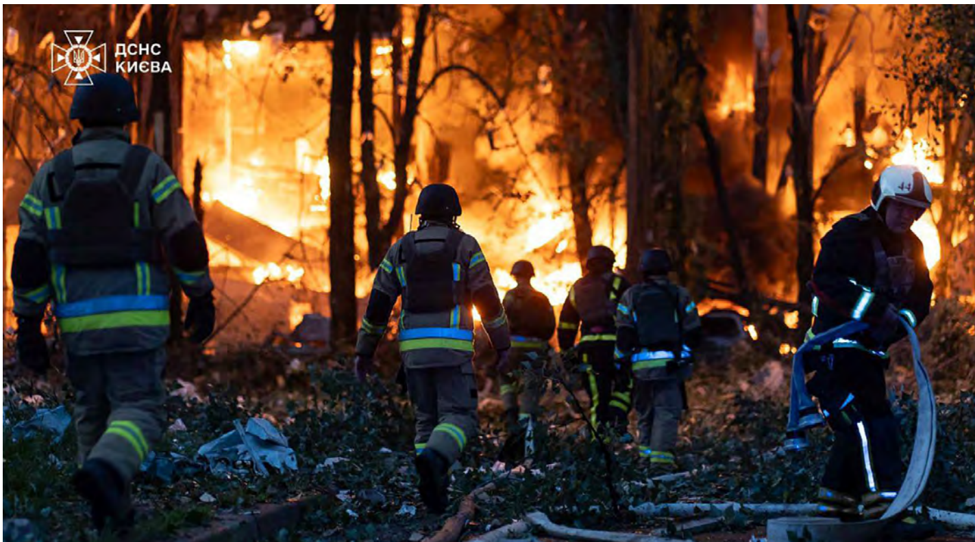
firefighters working on a fire at a site of a strike following a mass Russian drone and missile attack on the Ukraine's capital Kyiv

AFP journalists in Kyiv heard drones buzzing over the