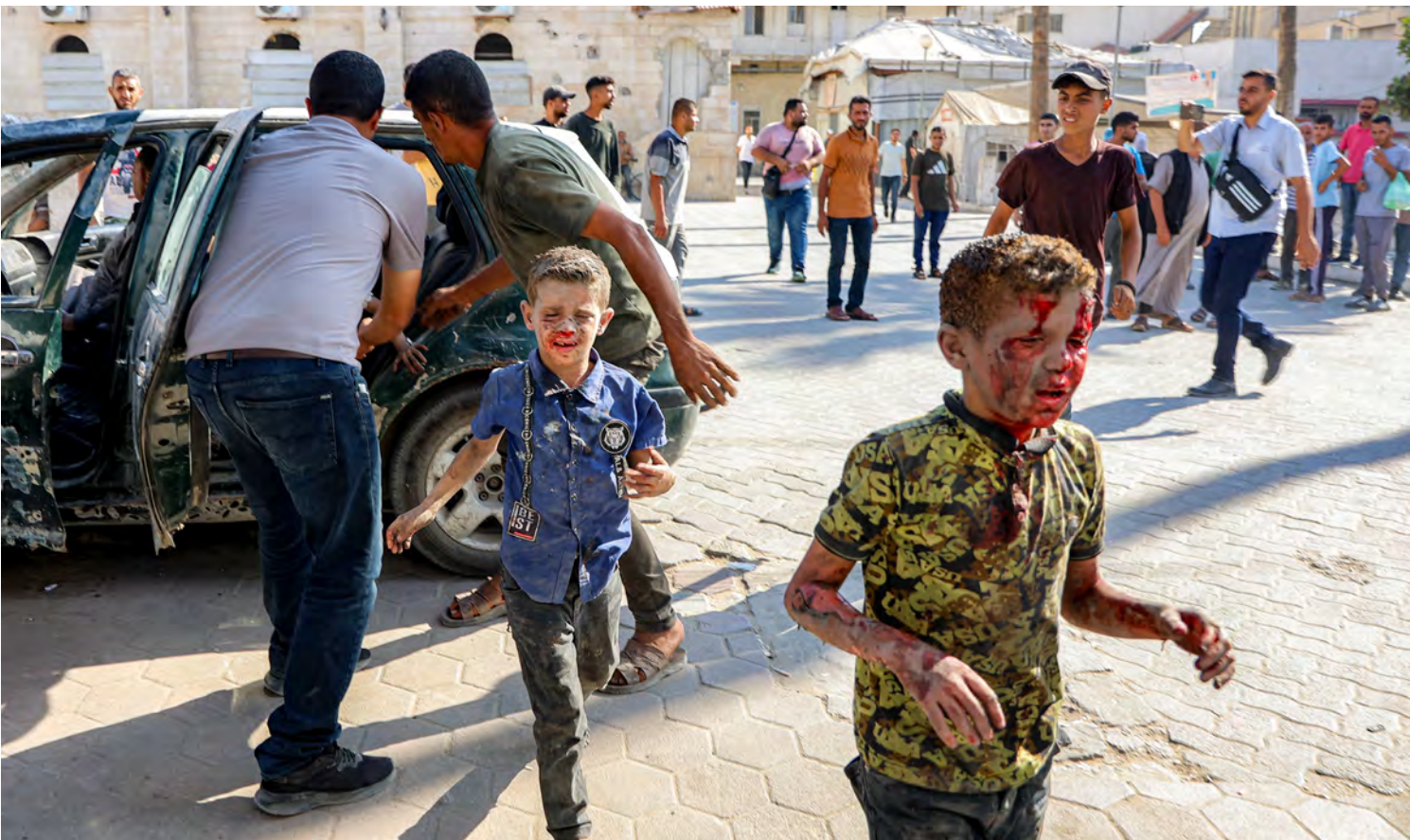
Injured Palestinian children react as they arrive at a hospital following an Israeli strike in Gaza City in the central Gaza

● Trump has been making a renewed push for an end to nearly 21 months of war in Gaza