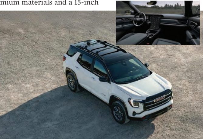
Representative picture

infotainment display paired with an 11-inch digital driver cluster. Standard tech includes Google Built-In, Apple CarPlay, Android Auto, and 5G Wi-Fi. Safety is a priority with 15 standard features, including Automatic Emergency Braking and Blind Zone Assist. The Black Edition, exclusive to Elevation, adds aggressive styling with gloss-black detailing and 19-inch wheels.