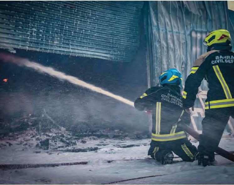
The Civil Defence extinguished a fire in a car repair garage and spread to a nearby warehouse storing spare parts and tyres in the Hamala area. Cooling operations are currently underway to prevent the fire from reigniting. The General Directorate of Civil Defence stated that upon receiving the report, 16 fire service vehicles and 54 personnel were immediately dispatched to the scene. The fire was brought under control, with no reported casualties. Investigations are ongoing to determine the cause of the fire.