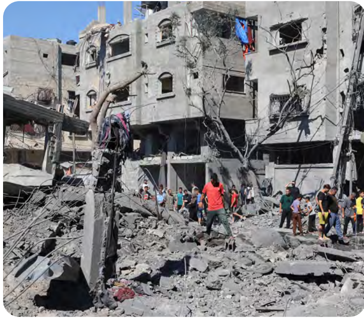
Palestinians inspect the damage after an Israeli strike in the Al-Bureij camp in the central Gaza Strip

Gaza City, Palestinian Territories