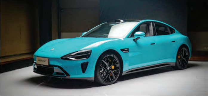
The SU7 has consistently outsold the Tesla Model 3 in China every month since its launch in December, while the YU7 re-

Chinese smartphone giant-turned-EV maker Xiaomi will not expand its car sales beyond China before 2027, CEO Lei Jun revealed during a livestream this week. Lei said the company's immediate priority is to meet strong domestic demand for its electric vehicles, particularly the SU7 sedan and the newly launched YU7 SUV.