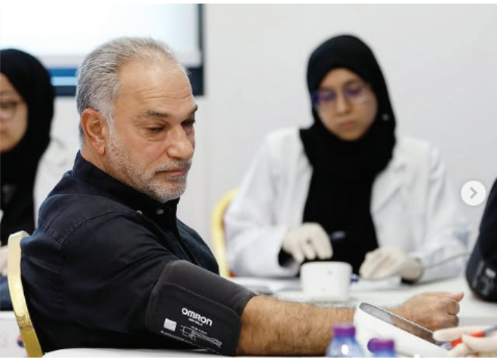
A collective humanitarian action to save lives

Organised by the residents of Al-Naeem and the campaign's Supreme Committee, the drive continues to stand as a symbol of collective humanitarian action