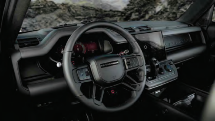
TDT | agencies

Land Rover has taken the wraps off the Defender OCTA Black, an all-black version of its flagship performance SUV. This striking edition features more than 30 exterior components finished in either Gloss Black or Satin Black, giving it an unmistakably stealthy