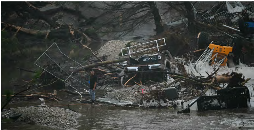
A member of the public stands next to overturned vehicles and broken trees after flooding caused by a flash flood at the Guadalupe River in Kerrville, Texas