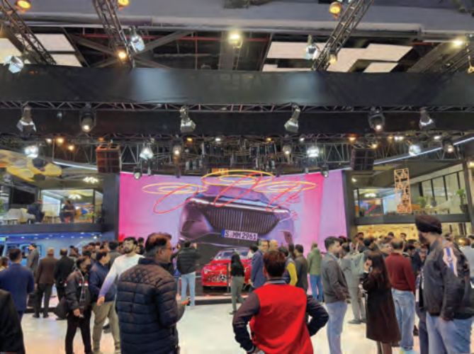
Representative picture TDT | agencies

The Government of India has announced that the third edition of the Bharat Mobility Global Expo will take place from February 4 to 9, 2027. The upcoming edition will see a significant expansion in scope, with a focus on multi-modal mobility and logistics. The event will highlight innovations and solutions across urban and rural mobility, covering various modes of transport including road, rail, air,