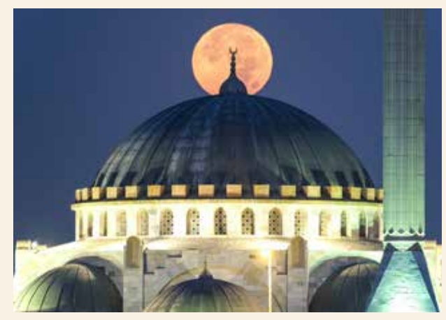
The mystical moon in all it's glory, framing the dome of the Rashid Al Zayani Mosque.

the auspicious full moon This lovely phenomenon from the sacred month of was captured in pictures Dhul Qi'dah, from the Is- from the Rashid Al Zayani lamic calendar.