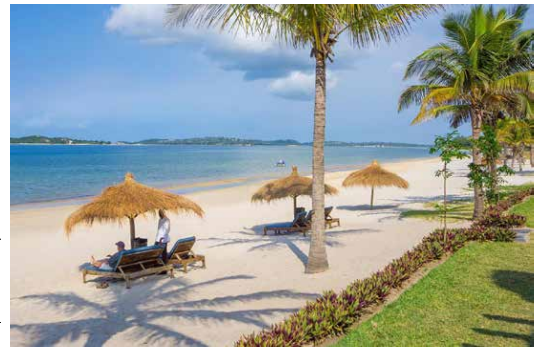
Representational image

rooms and other common areas their electronic devices upon conditions.