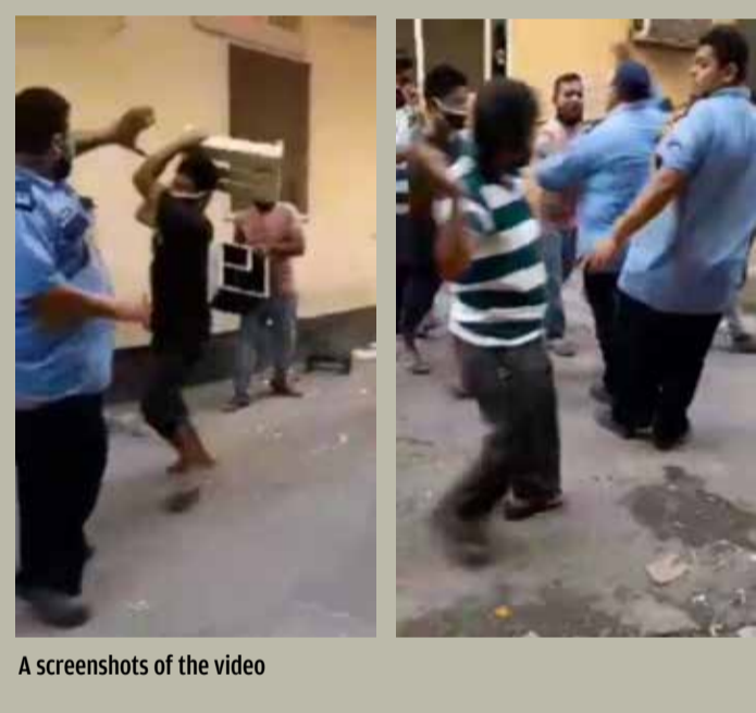
A screenshots of the video

● One of the guards dispersed part of the crowd after he waved a knife at them. Seconds after he put the knife away, several men suddenly approached him and beat him using wooden boxes. More men began hitting both guards and chased them down the alley