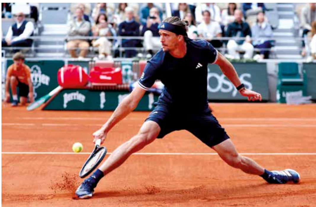
Germany's Alexander Zverev hits a half volley to Czech Republic's Jakub Mensik

He will face one last test of his mental strength on Court Philippe Chatrier in two days' time, but should at least be fresh physically after reaching the final having only lost two sets in six matches.