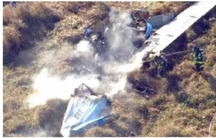
Smoke rises from the wreckage of the plane after the crash

President Joe Biden, who was at the White House and also played golf Sunday, was briefed on the incident, an official said without specifying whether any emergency precautions were