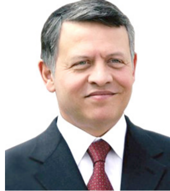
HM King Abdullah