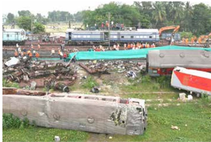
Railway workers help to restore services at the accident site of a three-train collision near Balasore

toll could still rise with medical centres overwhelmed by the number of casualties, many in serious condition.