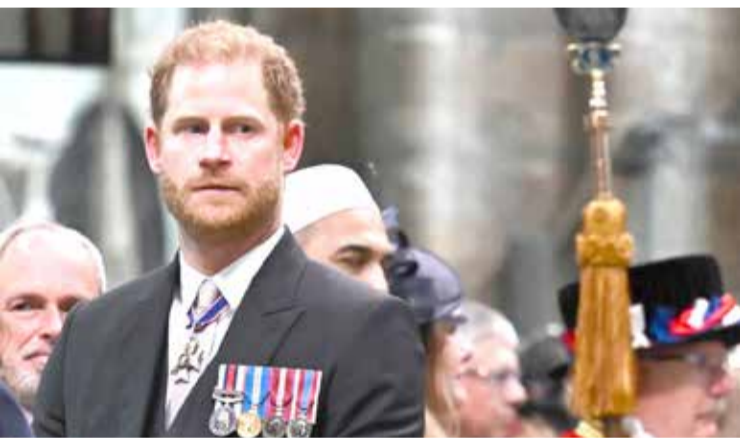
Britain's Prince Harry looks during King Charles III's coronation ceremony (file photo)