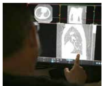
A man looks at an image of a lung x-ray (file photo)

Lung cancer is the form of the disease that causes the most deaths, with approximately 1.8 million fatalities every year worldwide.