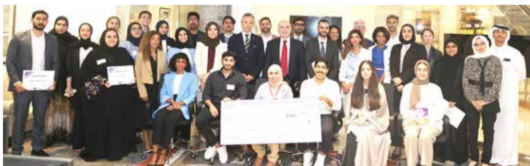
The Youth Pioneer Society at the hackathon's first edition

This project is organised by the Youth Pioneer Society in strategic cooperation with the French Embassy, and with the Bahrain Scientific Center for Sustainable Development Goals, the United Nations Development Program in Bahrain, the Collective Hub, Upgradelle and Fives Gulf Services as the spon-