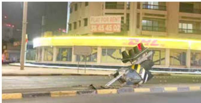
A broken traffic signal in Um Al Hassam