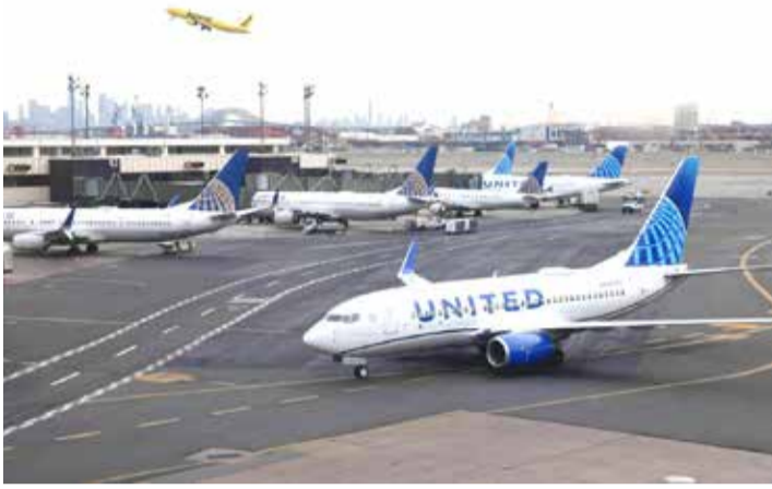
A United Airlines plane taxis at Newark International Airport, in Newark, New Jersey

"Stronger profitability is supported by several positive developments. China lifted Covid-19