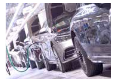
Mercedes-Benz S-Class passenger car are lined up at the "Factory 56"

Sales of all-electric vehicles rose by 46.6 percent.