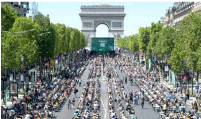
This photograph shows the prestigious Champs-Elysees Avenue, transformed into a giant classroom hosting participants, as they attempt to beat the record of the "World's Biggest Dictation" in Paris