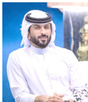
HH Shaikh Nasser

HH Shaikh Nasser tribute to His Majesty King Hamad bin Isa Al Khalifa, hailing unwavering royal care for charitable and