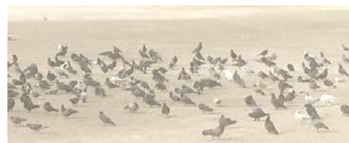
Birds are being fed at vacant land

specialist at Muharraq Municipal Council, claimed that using dry foods and avoiding wet leftovers are two environmentally beneficial choices that do not attract insects and rodents.