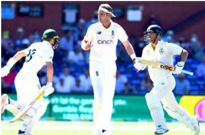
Australian batsmen David Warner (R) and Marnus Labuschagne runs between the wickets as Stuart Broad (C) looks on (file photo)

"He (Warner) is a class player. It's not as simple as just turning up and bowling round the wick-