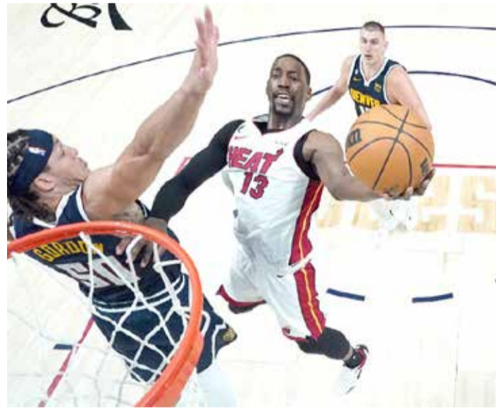
Bam Adebayo of the Miami Heat drives to the basket against Aaron Gordon of the Denver Nuggets

"We know we've got to do it on the defensive end," Adebayo said of Miami's fourth-quarter focus. "That's the biggest thing