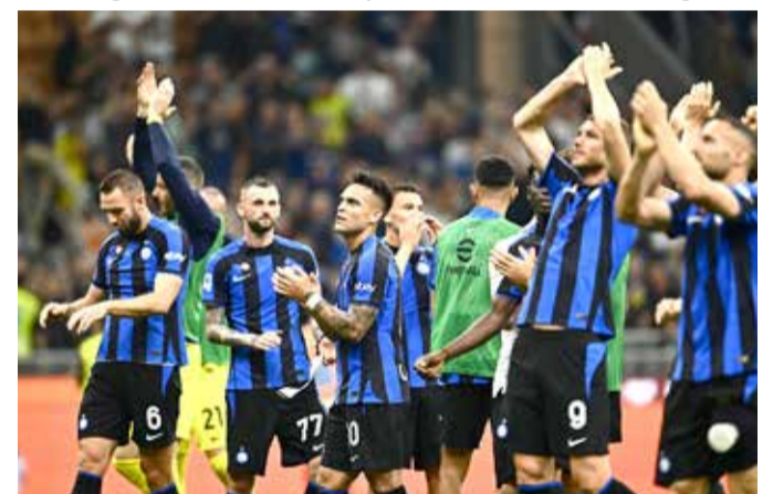
Inter Milan's players acknowledge the public at the end of a match