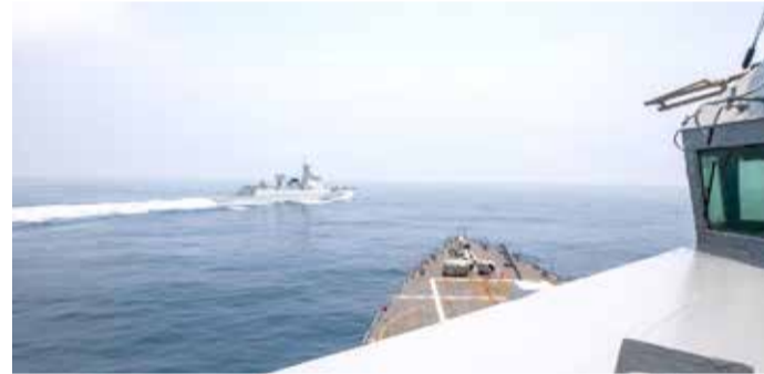
US Navy destroyer USS Chung-Hoon observes the Chinese PLA Navy vessel Luyang III (top) while on a transit through the Taiwan Strait

The US military has stepped up its Asia-Pacific operations to counter an increasingly assertive China, which has recently