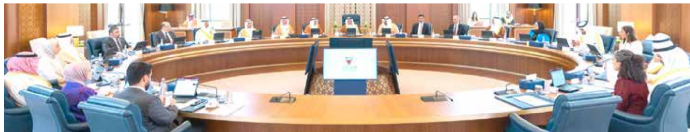
HRH the Crown Prince and Prime Minister chairs the weekly Cabinet meeting

HRH Prince Salman directs concerned authorities to disburse living allowances for retirees, government employees and people with disabilities