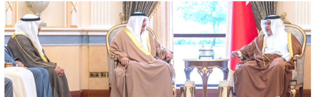
HRH the Crown Prince and Prime Minister meets with Speaker Al Musallam and Chairman Al Saleh

HRH the Crown Prince and Prime Minister highlighted that the efforts made by members of the Executive and Legislative Authorities during the first session of the sixth legislative term have led to the approval of important legislation, including a draft law approving the King-