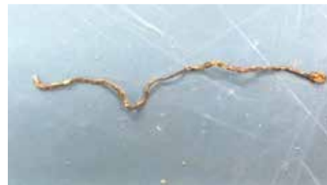
The remains of the chewed up snake clamped in his mouth.

Few moments later, he started screaming, following which his grandmother rushed and was shocked to find the dead snakelet