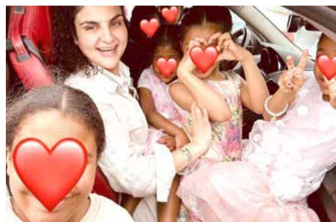
Children with a volunteer

"Some days can be challenging. It is impossible to clear your mind of the situations these children came from. And although they are safe now, it