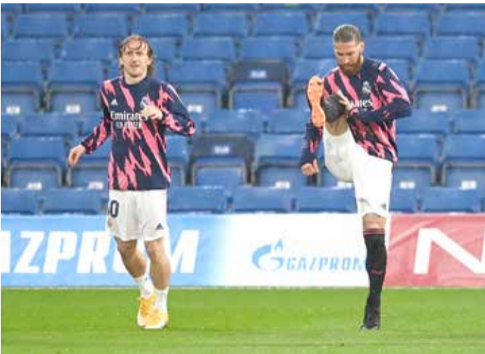
Real Madrid's Luka Modric (L) and Sergio Ramos warms up ahead of a match (file photo)

Such a wishlist would have seemed unthinkable before the