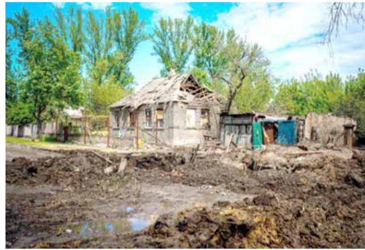
A photograph shows a damaged building after a missile strike in the town of Kramatorsk, Donetsk region (file photo)

But officials have been tight-lipped about the details, saying