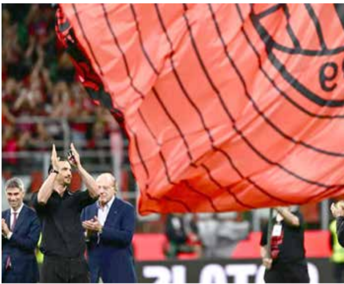
AC Milan's Zlatan Ibrahimovic (L) acknowledges the public during a farewell ceremony