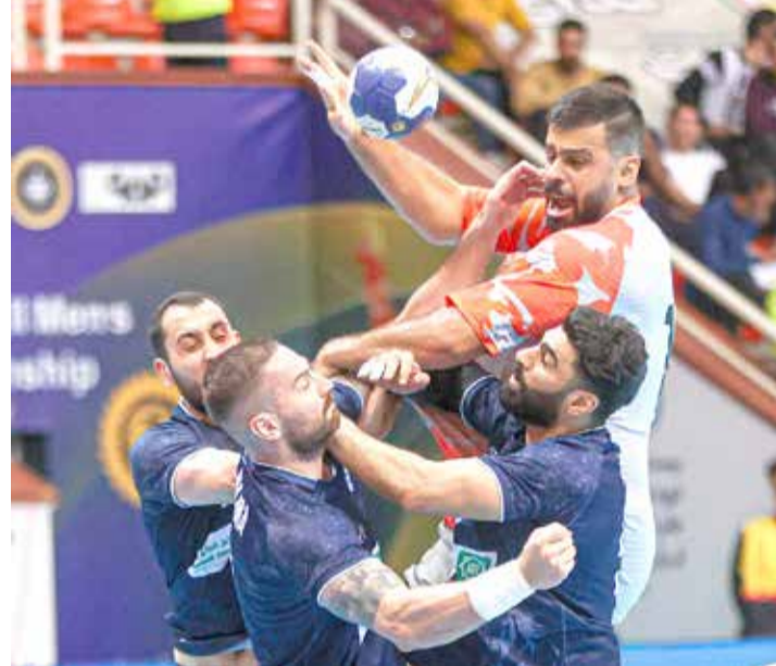
Najma players defend their Shahid Shameli counterpart during yesterday's game