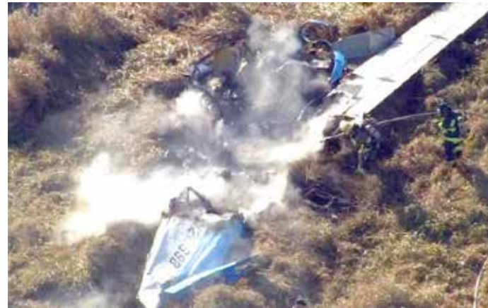
Smoke rises from the wreckage of the plane after the crash

President Joe Biden, who was at the White House and also played golf Sunday, was briefed on the incident, an official said without specifying whether any emergency precautions were