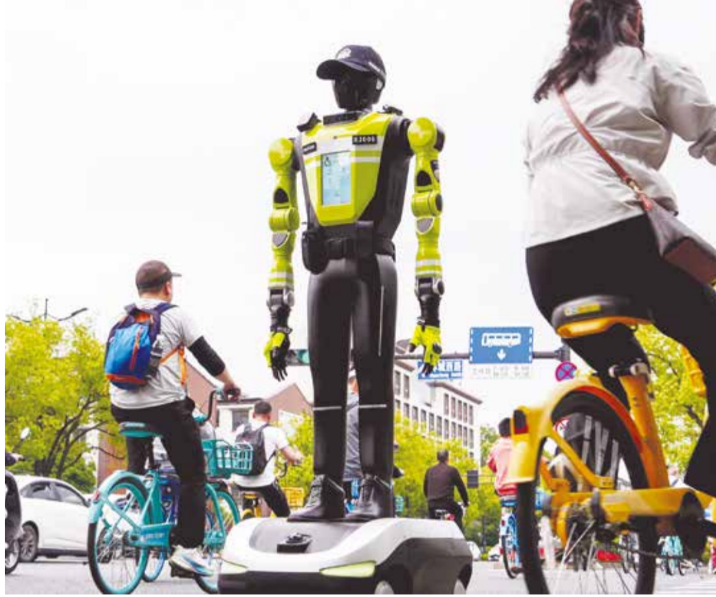
People cycle past a humanoid robot police officer in Hangzhou, in China's eastern Zhejiang province on the third day of a five-day national May Day holiday. The tech hub's traffic police deployed 15 humanoid robots in total to bolster their ranks on May 1.

Iran's presence at the tournament, held in the United States, Canada and Mexico between June 11 and July 19, has been shrouded in uncertainty since the war erupted.