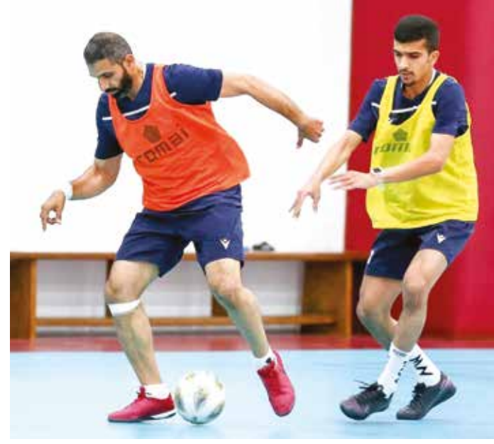
Bahrain futsal team players during training

The final Group A games are the competition.