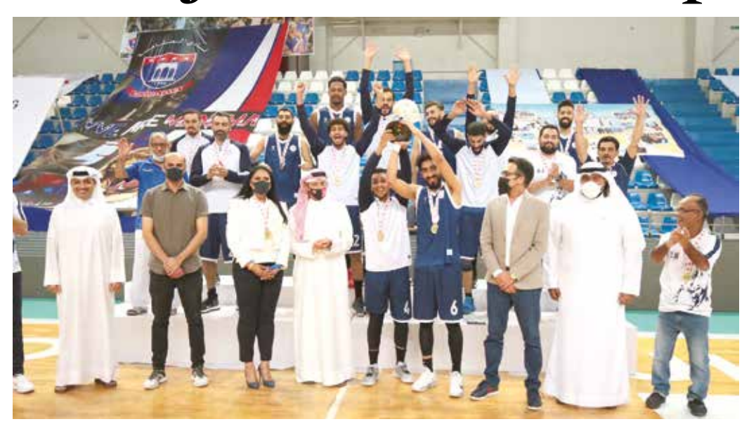
Manama players and officials during the awarding ceremony

Najma claim tournament trophy with 66-48 win over Manama in final