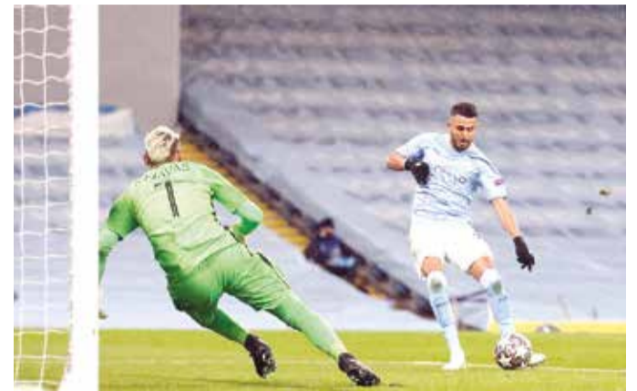
Riyad Mahrez scores Manchester City's second goal

P ep Guardiola said Manchester City's first ever Champions League final had been five years in the making after Riyad Mahrez's double saw off Paris Saint-Germain 2-0 on Tuesday to seal a 4-1 semi-final aggregate win.