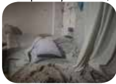
Wednesday, a rare attack on the ancestral home region of the Syrian leader and close to a Russian air base. A Syrian army statement said

◆ Syrian air defences downed several Israeli missiles during pre-dawn raids on the Mediterranean port city of Latakia, the Syrian army said on Wednesday, a rare attack on the ancestral home region of the Syrian leader and close to a Russian air base. A Syrian army statement said