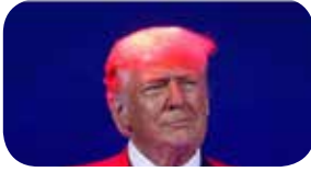
former U.S. President Donald Trump

Trump still banned from Facebook but board demands company review