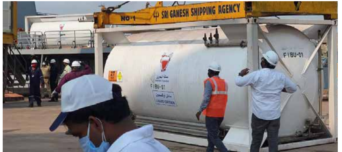
Two liquid oxygen cryogenic containers of 20 MT each from Bahrain getting offloaded in India

The central bank will also give some general business borrowers more time to repay loans to help underpin the economy, Das added.