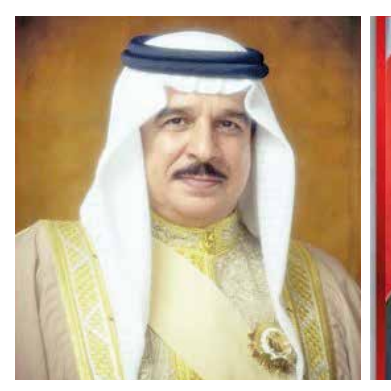
HM the King

HH Shaikh Nasser praised HM ensure decent and stable life for