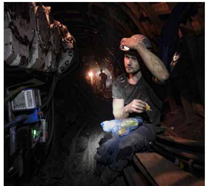
A Bosnian coal miner breaks fast in the underground at a mine in Zenica