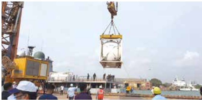
The oxygen-filled cryogenic containers TDT | Manama

Indian Navy warship INS Talwar yesterday reached New Mangalore Port with the first consignment of 50 tonnes of oxygen from Bahrain. The Kingdom sent a shipment of two cryogenic con-