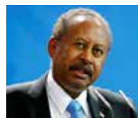
Prime Minister Abdalla Hamdok

Sudan expects to begin the Highly Indebted Poor Coun-