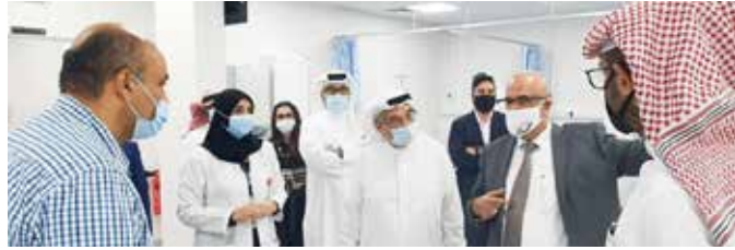
Shaikh Mohammed with hospital staff