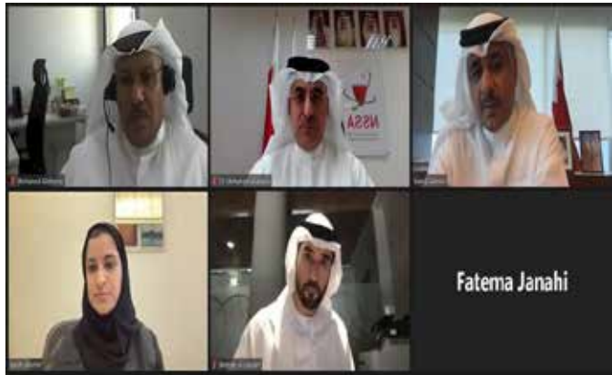
The online discussion in progress