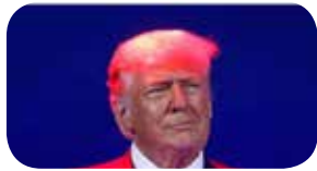
former U.S. President Donald Trump

Trump still banned from Facebook but board demands company review