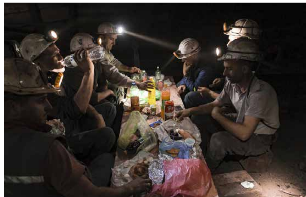
Bosnian coal miners break fast in the underground at a mine in Zenica, Bosnia

YOU KNOW WHAT For the entire duration of the Muslim holy month, the miners go about their normal work routine, insisting they feel no exceptional hunger, thirst or exhaustion