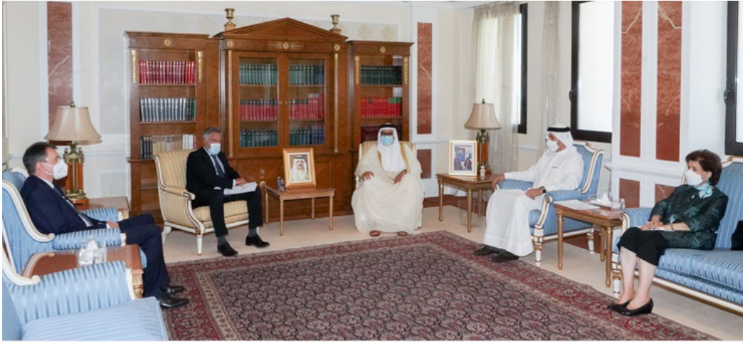
Minister Al Zayani with the European Union delegation