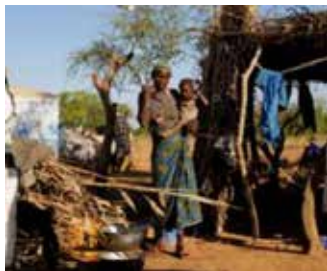
A woman who fled from attacks of armed militants in the Sahel region holds her child as she stands besides her tent at a camp for internally displaced people (IDPs) in Kaya, Burkina Faso

that threatens lives, livelihoods or both, acute food insecurity at crisis levels or worse impacted at least 155 million people last year, the highest number in the report's five-year existence.