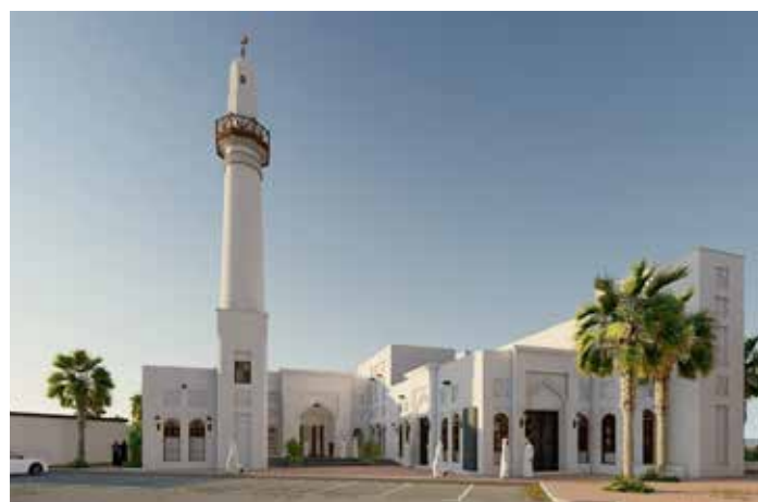
An artist's impression of the Mal Allah Mosque

The construction of the mosque has been prepared as part of the master plan for Diyar Al Muharraq, as the project supports the aspirations and endeavours of Diyar Al Muharraq Company to provide all facilities that improve the residents' lifestyle, including the construction of spacious and integrated mosques to serve residents and visitors alike.