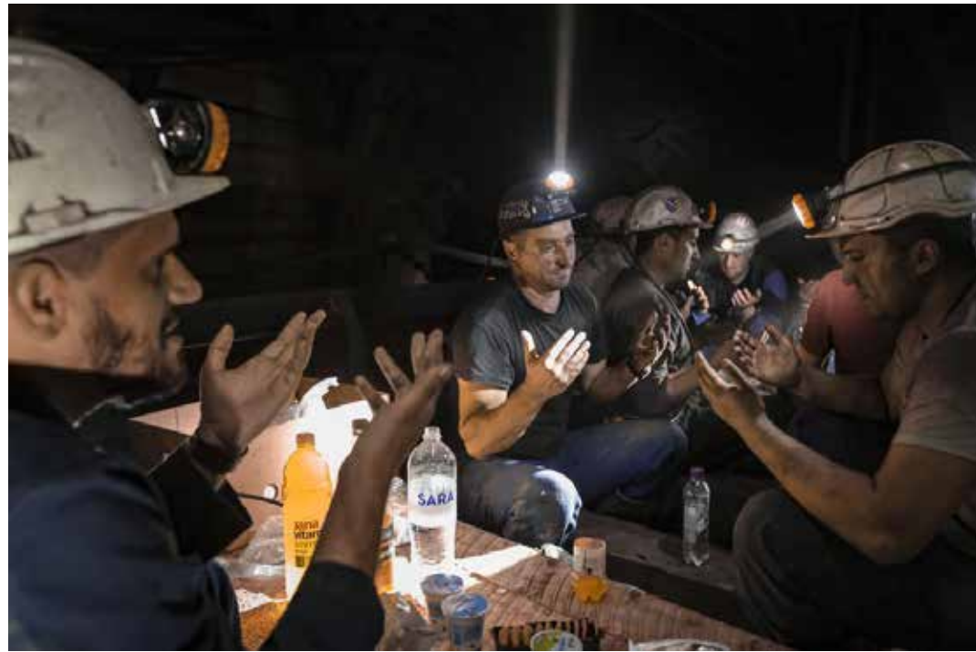
Bosnian coal miners pray after breaking fast in the underground at a mine in Zenica

After a quick meal, one of the miners issues a call to prayer and