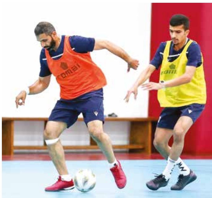
Bahrain futsal team players during training

then scheduled for May 24. The Bahrainis play their Egyptian counterparts that evening, while Mauritania take on Kuwait.