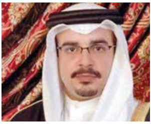
HRH Prince Salman