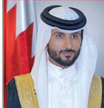
HH Shaikh Nasser

Nasser extended deepest congratulations to HM King Hamad on Eid Al Fitr, praying to Allah the almighty to bless HM the King with abundant health and happiness, and to protect Bahrain and its people from all evil.