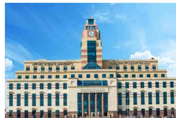
Applied Science University