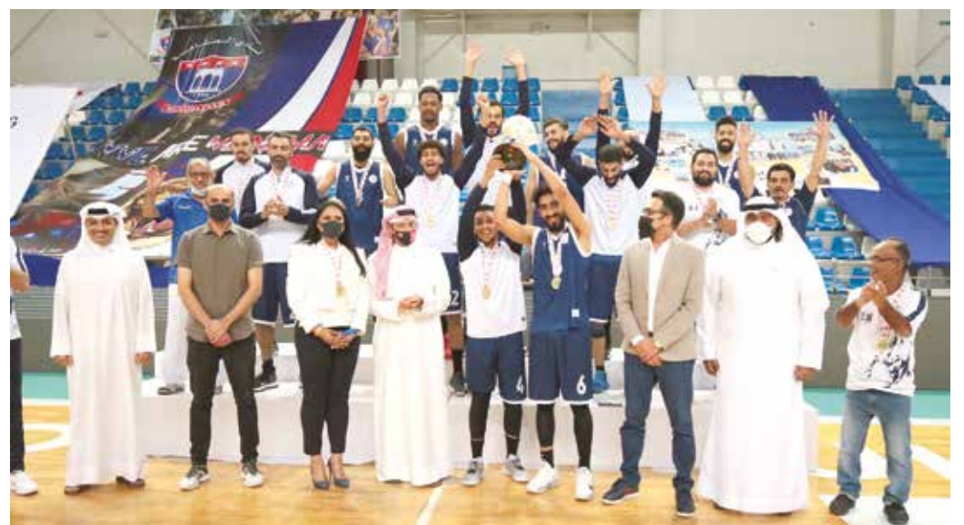
Manama players and officials during the awarding ceremony

● Najma claim tournament trophy with 66-48 win over Manama in final