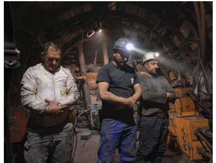
Bosnian coal miners pray after breaking fast

"I am working in this same mine for 30 years and with God's help I always fast during Ramadan. I do not find it difficult at all," he said.