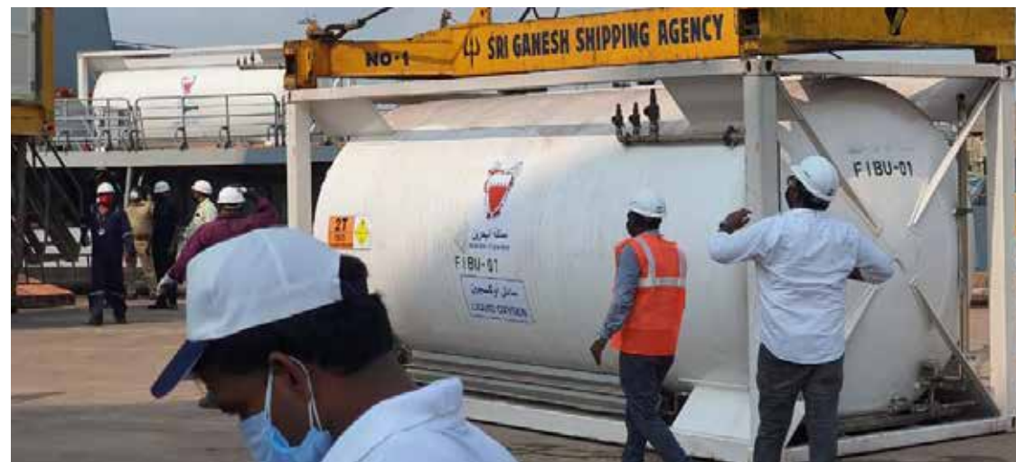
Two liquid oxygen cryogenic containers of 20 MT each from Bahrain getting offloaded in India

The central bank will also give some general business borrowers more time to repay loans to help underpin the economy, Das added.