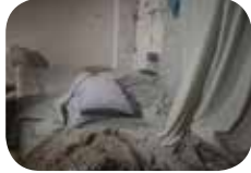
Wednesday, a rare attack on the ancestral home region of the Syrian leader and close to a Russian air base. A Syrian army statement said

Syria says Israeli raids target Mediterranean port region of Latakia