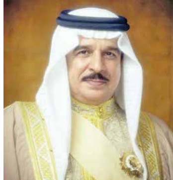
HM the King