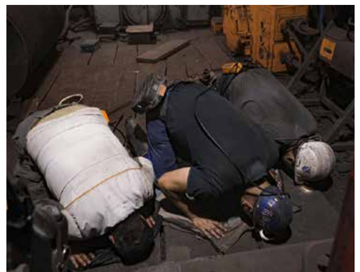
Bosnian coal miners pray after breaking fast at a mine in Zenica

YOU KNOW WHAT For the entire duration of the Muslim holy month, the miners go about their normal work routine, insisting they feel no exceptional hunger, thirst or exhaustion