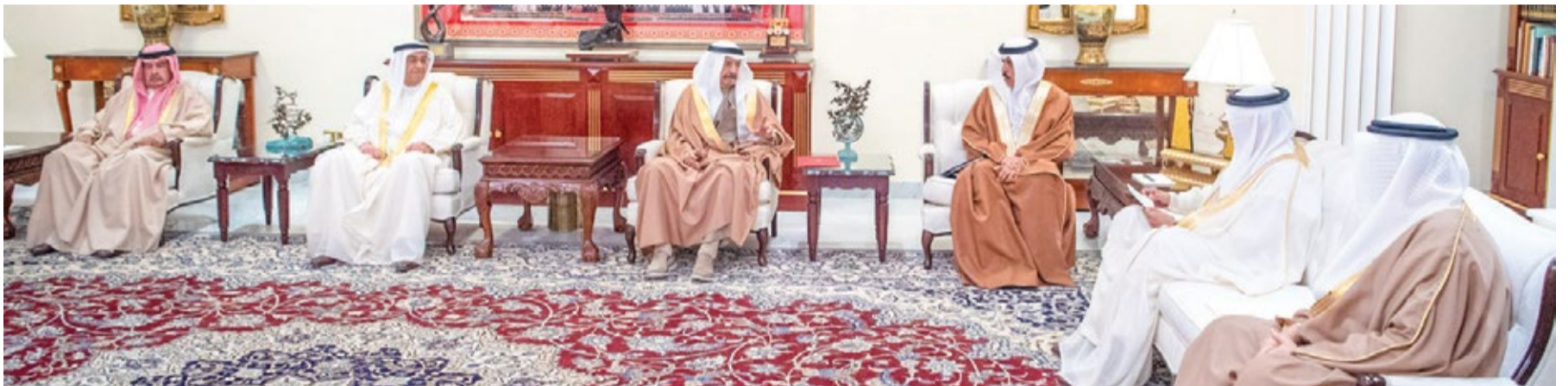
HRH the Prime Minister and other officials during their meeting yesterday

He thanked medical and nursing professionals for their distinguished national role on the