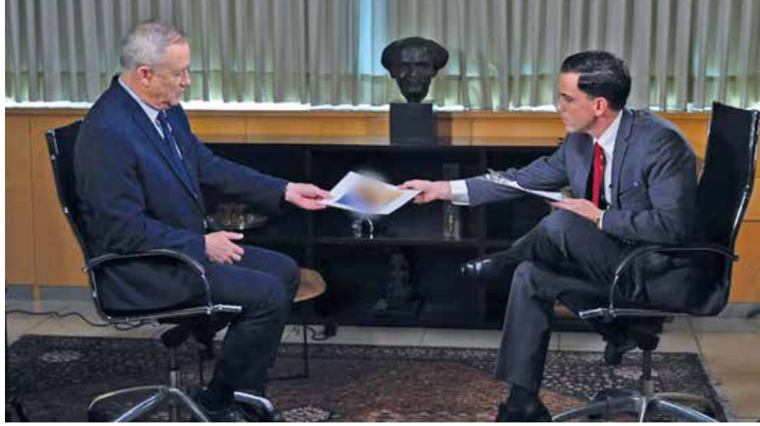
Israeli Defense Minister Benny Gantz shares a classified map of locations of missiles controlled by he Iranian-backed Lebanese militant group Hezbollah.

The latest development came amid increasing regional tension over Iranian proxy actions and violations of the 2015 nuclear deal.