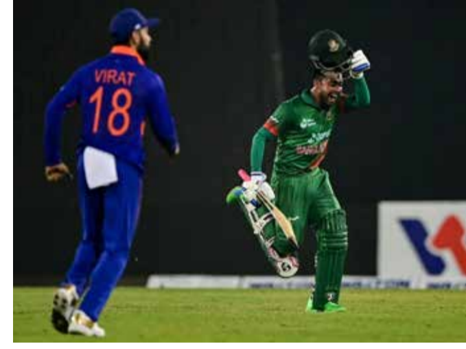
Bangladesh's Mehidy Hasan Miraz celebrates as he takes the winning runs

Mehidy Hasan Miraz hit an unbeaten 38 and put on a record tenth-wicket stand as Bangladesh edged out India by one wicket in a thrilling opening one-day international yesterday.