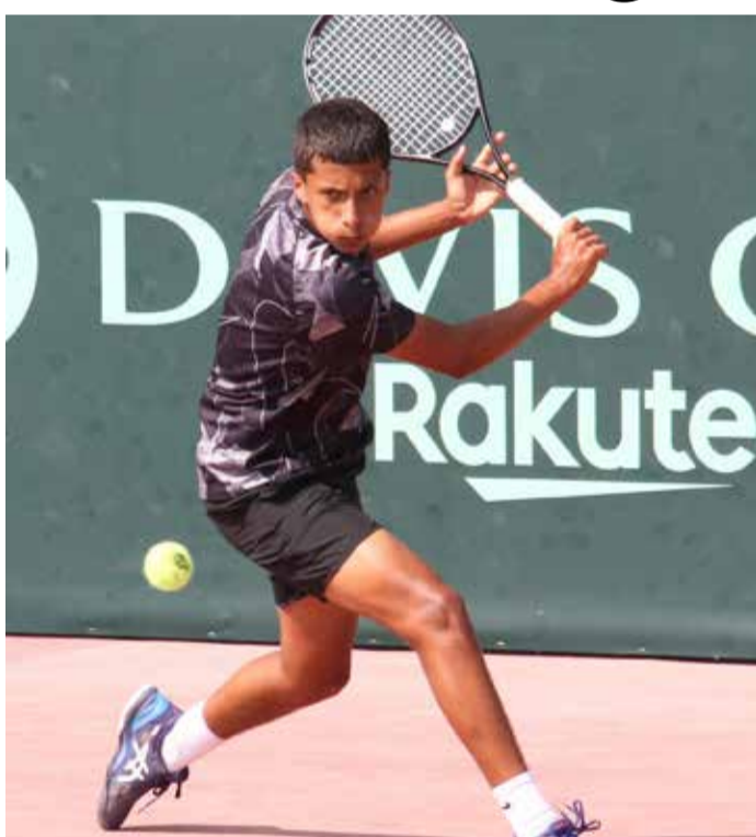
Play from a previous international tournament at the BTF (File photo)