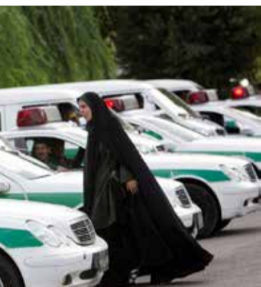
Made up of men in green uniforms and

cy said 470 protesters had been killed as of Saturday, including 64 minors. It said 18,210 demonstrators were arrested and 61 members of the security forces were killed.