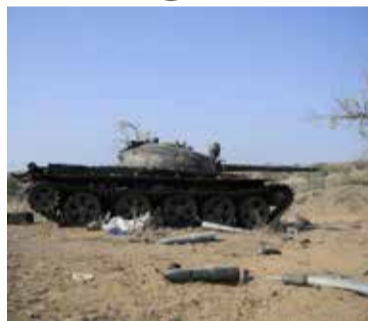
Ammunition is seen next to a tank destroyed in a fight

War erupted in Ethiopia's northern Tigray region in November 2020, pitting the Tigrayan forces against federal troops and their