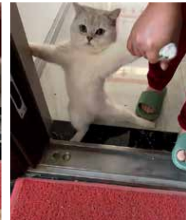
to their owner, who is trying in vain to lead

ne to avoid being sent out into the cold