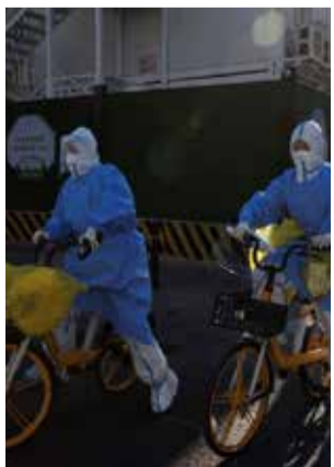
Health workers in protective suits ride bicycles

A deadly fire last month in Urumqi sparked dozens of protests against COVID curbs in over 20 cities after some social media users said victims had been unable to escape the blaze because their apartment building was locked down. Authorities denied that.