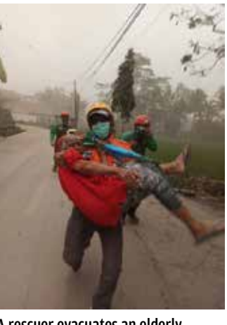
A rescuer evacuates an elderly

by piles of lava at the top ment. flooded down the 3,676-metre for Indonesia's National Disas- cording to a journalist.