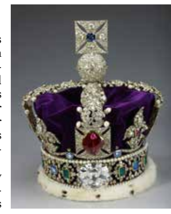
An undated handout photo, issued by Buckingham Palace on December 3, 2022, shows the Imperial State Crown which will be worn by Britain's King Charles on his coronation day on May 6, 2023

The St Edward's Crown, made up of a solid gold frame Charles III will be crowned set with rubies, amethysts, with St Edward's Crown dur- sapphires, garnet, topazes ing the solemn ceremony to be and tourmalines, follows its held at London's Westminster original medieval forebear in Abbey on May 6, just as his having four crosses-pattée and late mother Queen Elizabeth II four fleurs-de-lis. It also has was in 1953. He will also wear a velvet cap with an ermine