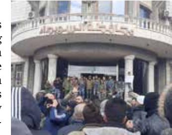
People gather as they take part in a protest in Sweida, Syria

ed before protesters stormed policed area.