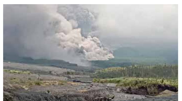
Mount Semeru spews smoke and ash in Lumaiang