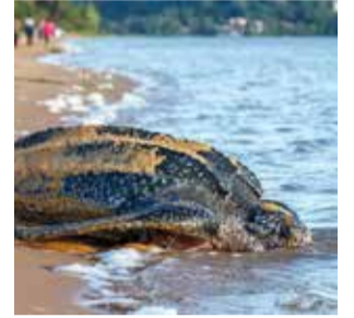
A leatherback sea turtle