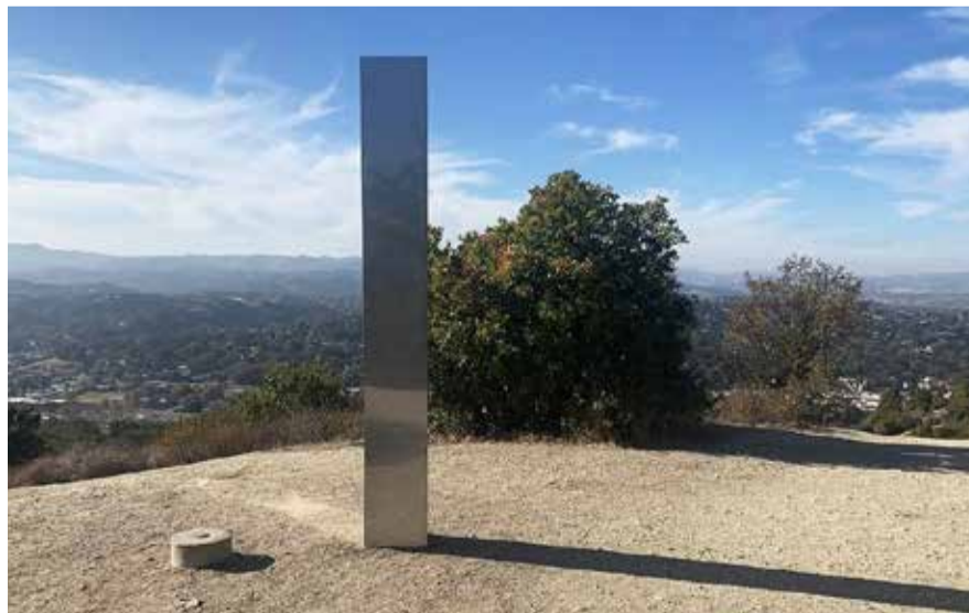
A monolith stands on a Stadium Park hillside in Atascadero, California

The 10-foot tall monolith in Utah, found by officials counting bighorn sheep in a remote desert last month, sparked worldwide awe and drew throngs of hikers making pilgrimages to see.