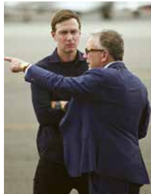
US special envoy to the Middle East Steve Witkoff (R) and Jared Kushner

After Hamas said it was ready to release all hostages and discuss details on the peace plan, Trump urged an immediate halt to the fighting in Gaza