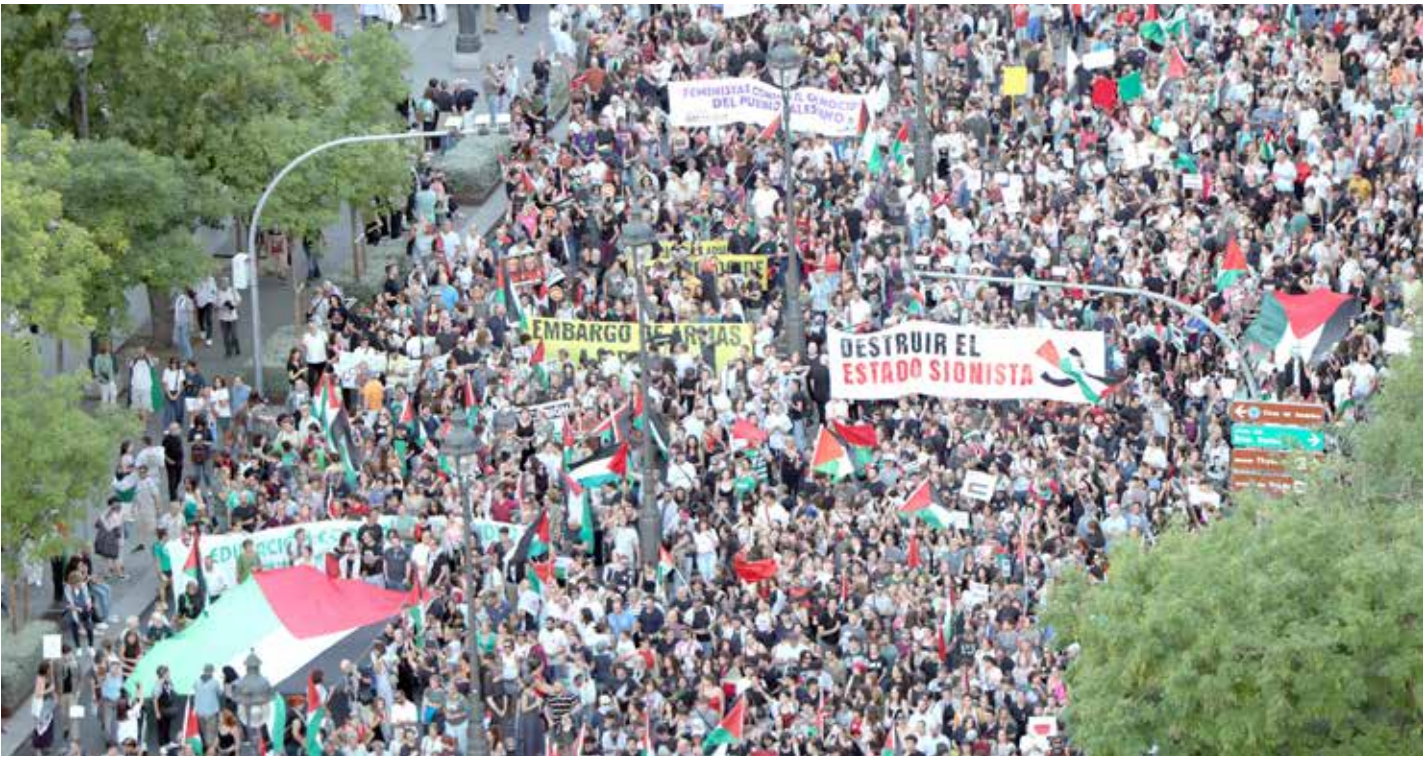
Protesters display banners in Madrid during a demonstration expressing solidarity with Palestinians in the Gaza Strip.

But in Italy, Prime Minister Giorgia Meloni's hard-right government has been criticised for its inaction on the siege of the