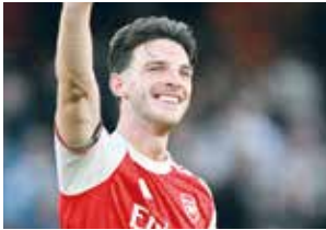
Arsenal's English midfielder #41 Declan Rice London, United Kingdom

Declan Rice struck against his former club as Arsenal moved top of the Premier League with a 2-0 win over West Ham yesterday. In Mikel Arteta's 300th match in charge, the Gunners proved too strong, though captain Martin Odegaard was forced off injured before half-time.