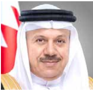
H.E. Dr. Abdullatif bin Rashid Al Zayani

His Excellency Dr. Abdullatif bin Rashid Al Zayani, Minister of Foreign Affairs, held a telephone call with Yermek Kosherbayev, Minister of Foreign Affairs of the Republic of Kazakhstan.