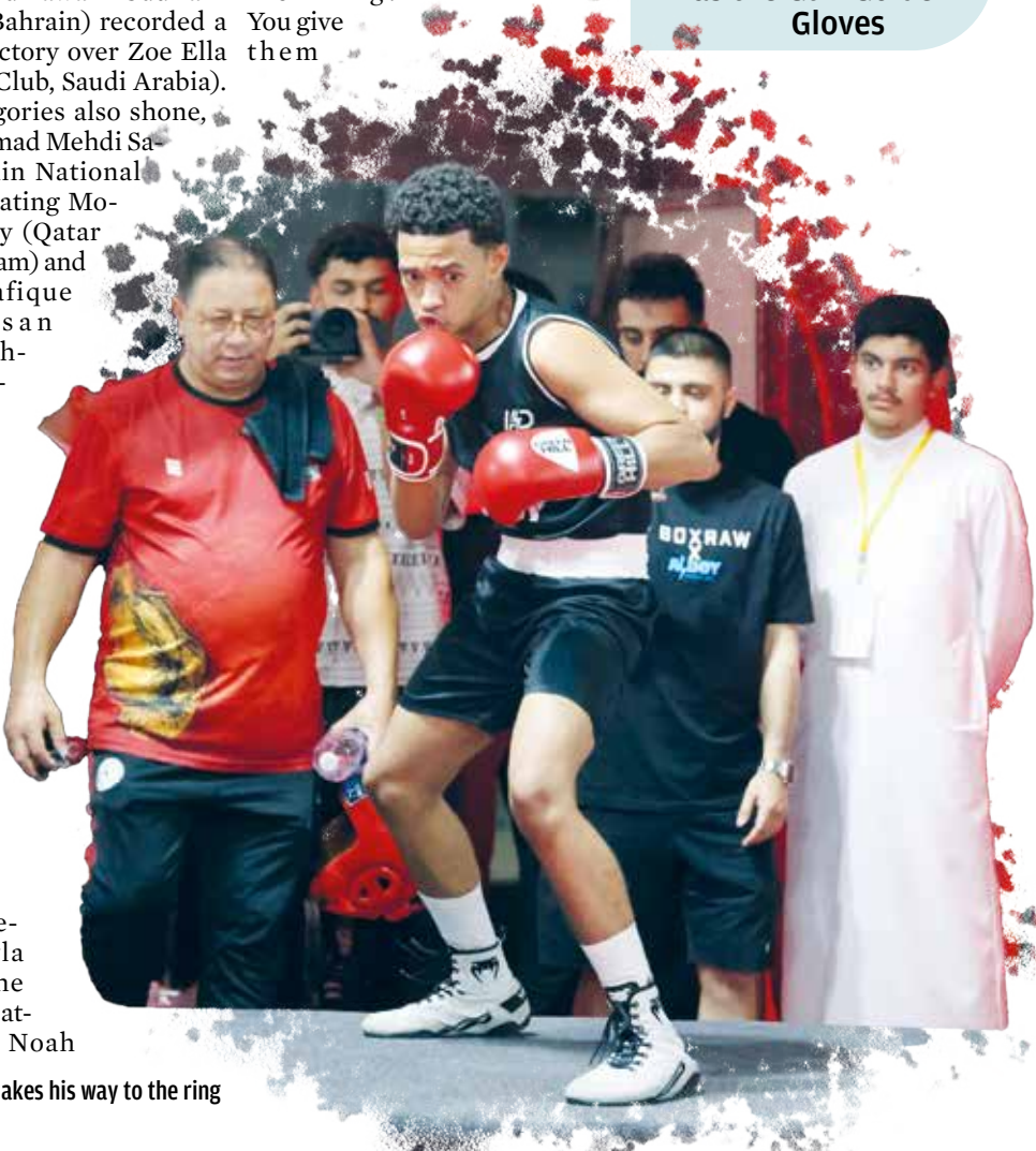
Local fighter makes his way to the ring