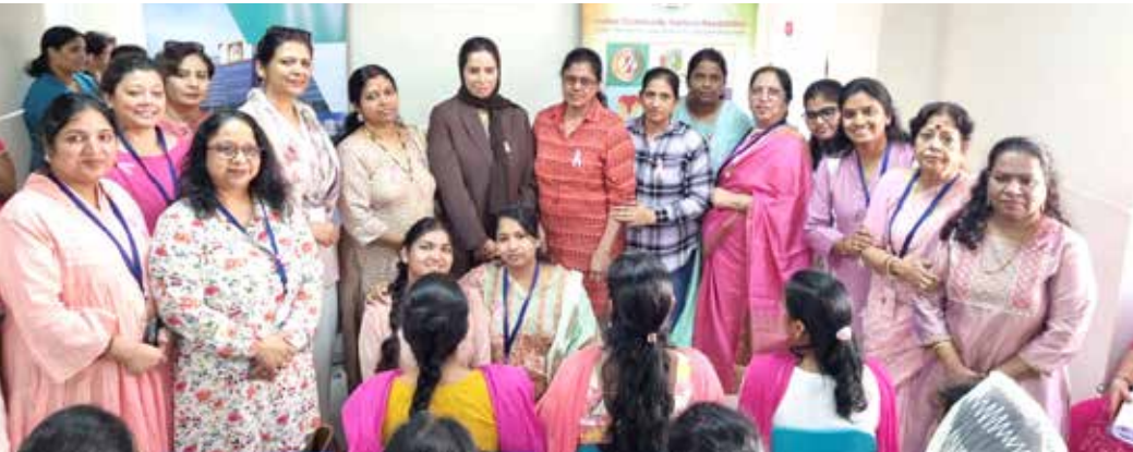
Indian Community Welfare Association and American Mission Hospital representatives with guests and participants

The Indian Community Welfare Association (ICRF Bahrain) in association with the American Mission Hospital (AMH) conducted a Breast Cancer Awareness campaign on Friday, 3 October 2025 for female house-helpers. Around 70 house-helpers attended the program held at the American Mission Hospital in Manama. Chief Guest for the event was