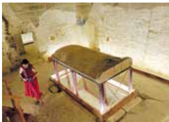
A tourist visits the tomb of King Amenhotep III in the Valley of the Kings