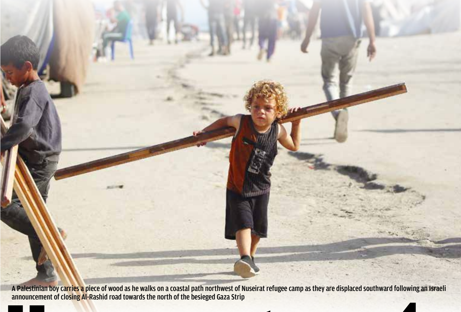
A Palestinian boy carries a piece of wood as he walks on a coastal path northwest of Nuseirat refugee camp as they are displaced southward following an Israeli announcement of closing Al-Rashid road towards the north of the besieged Gaza Strip