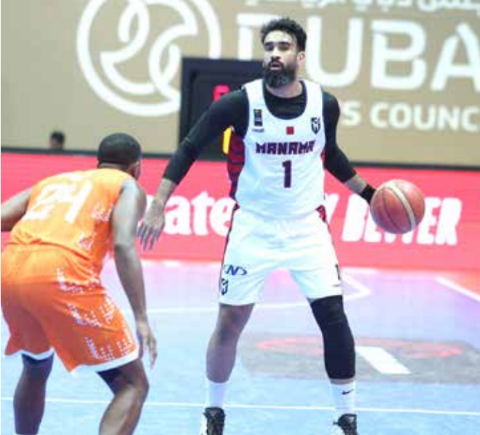
Action from the quarters

The Bahraini side controlled much of the game, but Kazma