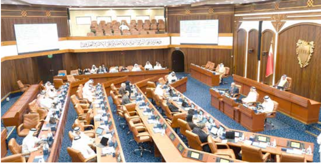
Council of Representatives in session

"There was an initial wish, and colleagues showed support for it, but personally I do not see myself ready in the coming period to chair the committee, not for technical reasons. I prefer to support another colleague in the final session," he said.