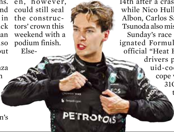
Mercedes' British driver George Russell

dominance. McLaren, however, could still seal the constructors' crown this weekend with a podium finish. Else-