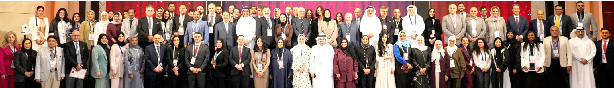
The 8th edition of the Dermatology, Laser and Aesthetics Conference and Exhibition (DLA8 2025) has officially commenced in Bahrain, bringing together a wide range of doctors and specialists in dermatology and cosmetology from both within the Kingdom and abroad. This year’s conference features the participation of more than 85 distinguished international and regional speakers delivering over 70 lectures that highlight the latest innovations and technologies in therapeutic dermatology, non-surgical aesthetics, skin surgery, and laser treatments.