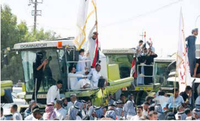
Iraqi farmers gather on a street in the central city of Diwaniyah to protest against the government’s policy of curbing land cultivation to preserve dwindling water supplies

H undreds of Iraqi farmers protested yesterday against the government’s policy of curbing land cultivation to preserve dwindling water supplies, an AFP correspondent said. Year-on-year droughts and declining rainfall have brought agriculture to its knees in a country still recovering from decades of war and chaos, and where rice and bread are diet staples. Water scarcity has forced many farmers to abandon their plots, and authorities have drastically reduced farm activity to ensure sufficient drinking water for Iraq’s 46 million people. In the Ghammas area in the southern province of Diwaniyah, hundreds of farmers, including from neighbouring provinces, gathered to urge the government to allow them to farm their lands. They called on the authorities to compensate them for their losses and distribute water for agriculture. “We have come from four provinces to demand the rights and compensation owed to