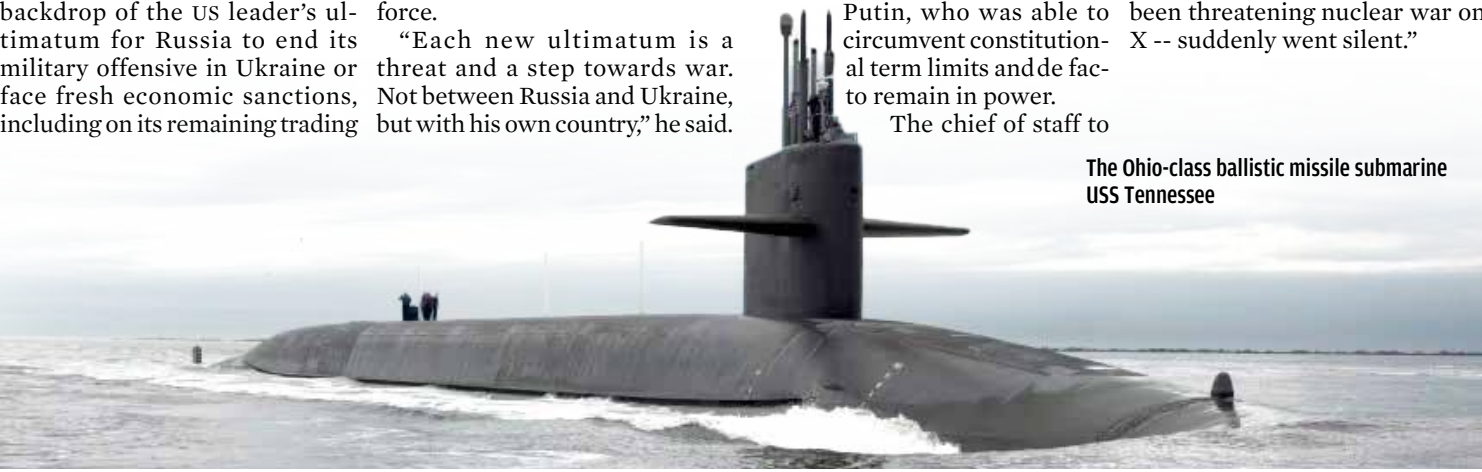
The Ohio-class ballistic missile submarine USS Tennessee

Medvedev, who has not posted on social media since the spat, is currently the deputy chairman of Russia's Security Council. He served one term as president from 2008 to 2012, effectively acting as a placeholder for Putin, who was able to circumvent constitutional term limits and de facto remain in power. The chief of staff to