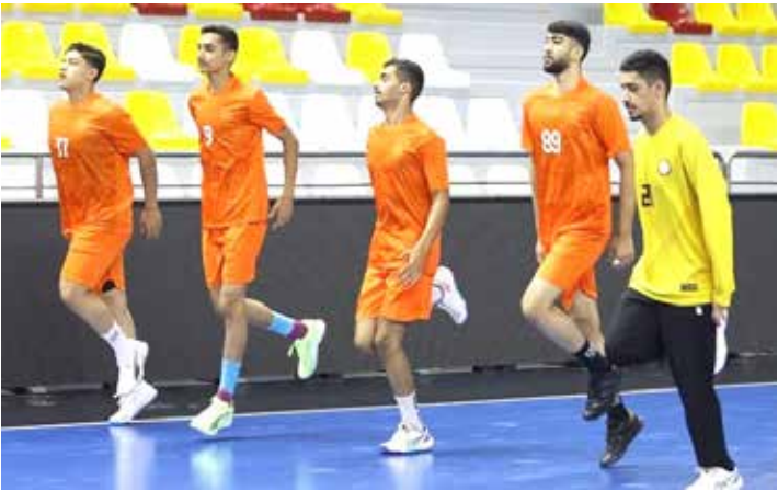
Bahrain's squad during a pre-tournament training drill

Bahrain’s next generation of handball talent will open their U-19 World Championship campaign in Cairo tomorrow, August 6, against Japan at 5:15 PM Bahrain time. It’s a tough welcome to Group G, often dubbed the “Group of Death,” with hosts Egypt on Thursday at 7:30 PM and South