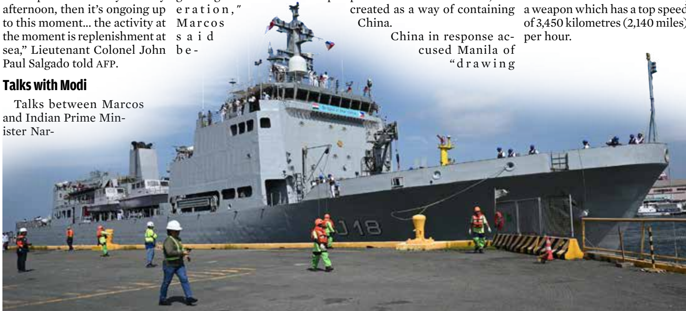
The Indian Navy survey vessel INS Sandhayak docks at the international port of Manila

Police said they started investigating in September after Canada's border agency alerted Spanish authorities to multiple cases of Yemeni nationals trying to enter from Spanish airports using forged travel documents. Officers arrested 11 suspected gang members, including its alleged leader, in raids in northern Spain and Madrid. Police said they traced flight bookings, money transfers, credit card payments, airport surveillance footage, and electronic travel authorisations as part of their probe.