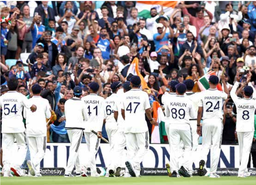
India players celebrate with fans

man Chris Woakes came in to bat with his left-arm strapped up owing to an injured shoulder, England still needed 17 more runs for victory.