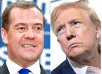
Dmitry Medvedev, US President Donald Trump

Ukrainian President Volodymyr Zelensky on Monday backed Trump's actions. "The concept of peace through strength works," Andriy Yermak wrote on social media. "The moment American nuclear submarines appeared, one Russian drunk -- who had just been threatening nuclear war on X -- suddenly went silent."