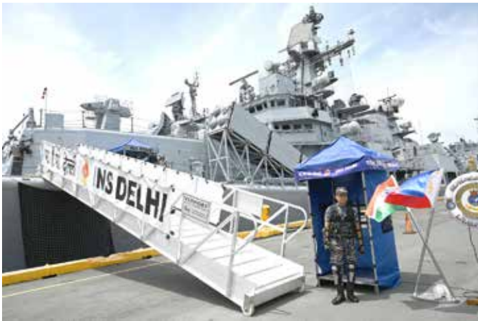
A crew member stands in front of the Indian Navy guided-missile destroyer INS Delhi armed with Brahmos anti-ship missiles (front R) after it docked at the international port of Manila

Talks between Marcos and Indian Prime Minister Narendra