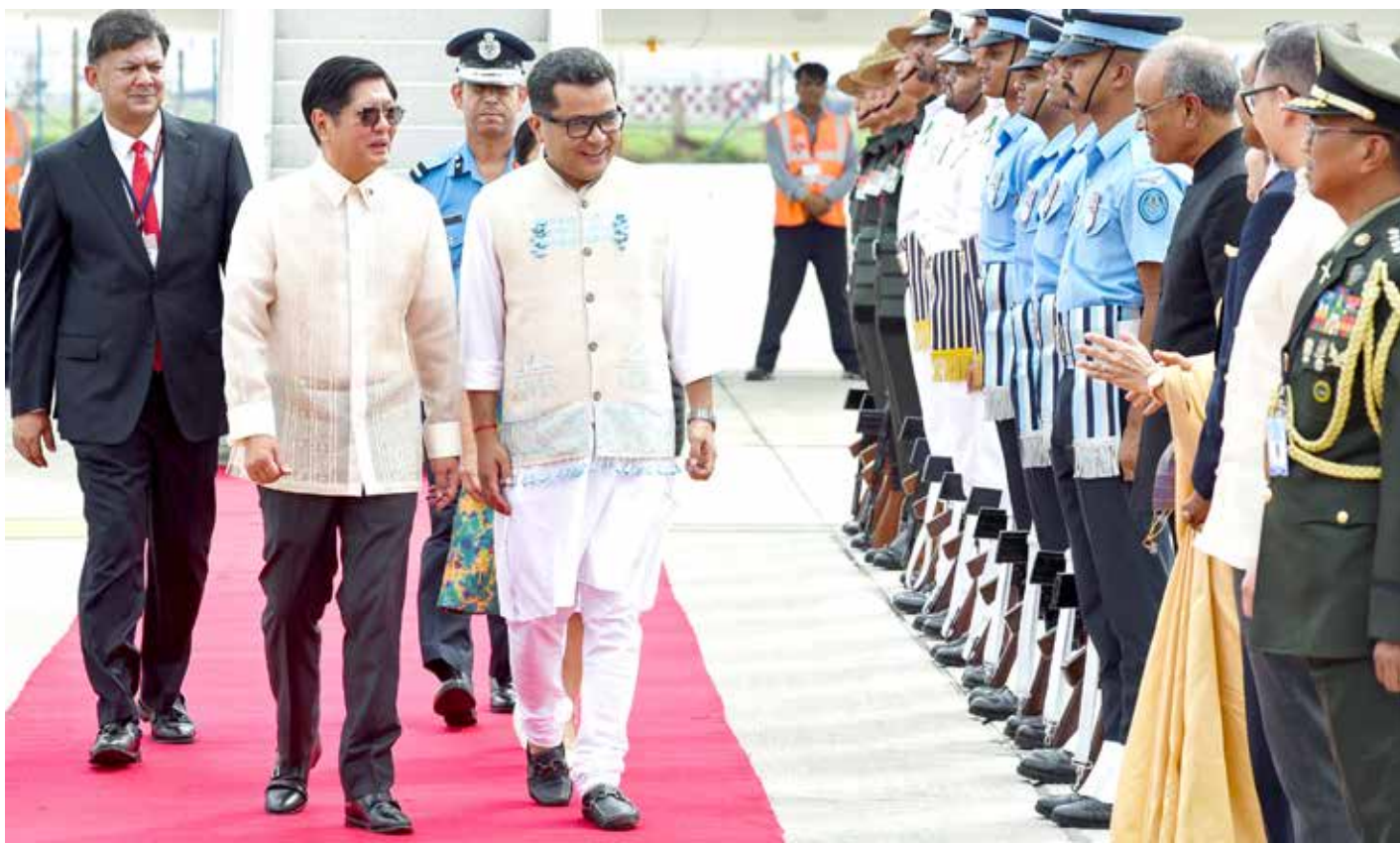
Philippines' President Ferdinand Marcos (2L) walks alongside India's Minister of State for External Affairs Pabitra Margherita (C) as he inspects the honour guards upon his arrival at the airport in New Delhi.