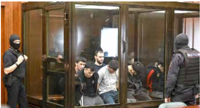
A group of defendants accused of involvement in the 2024 Crocus City Hall music venue gun attack that killed 149 people, goes on trial in Moscow