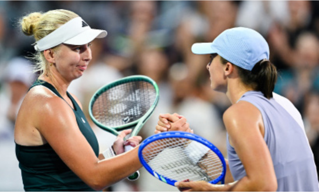
Iga Swiatek of Poland congratulates Clara Tauson of Denmark for her victory

Wimbledon champion Iga Swiatek became the latest seed to fall at the WTA Canadian Open on Sunday, stunned 7-6 (7/1), 6-3 by 19th-ranked Dane Clara Tauson in the fourth round. Swiatek, ranked third in the world and seeded second in Montreal, followed top-seeded Coco Gauff, third-seeded two-time defending champion Jessica Pegula and fourth-seeded Mirra Andreeva out the door. Fifth-seeded American Amanada Anisimova followed later with a straight-sets loss to Elina Svitolina. Tauson avenged a fourth-round loss to Swiatek at Wimbledon and called her second career victory over a top-five player “unreal”. “Obviously it’s really great and it shows all the hard work I’ve been doing has been the right thing,” Tauson said. “I’m getting more confidence in this kind of level and feeling like I belong here a bit more. I think that really helped me today in the important points.” Tauson booked a quarter-final berth against Australian Open champion Madison Keys, who