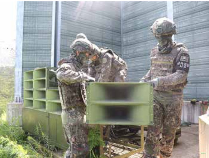
South Korean soldiers removing loudspeakers that were set up for propaganda broadcasts