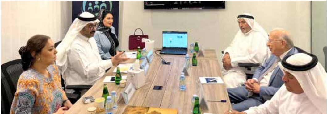
Better Life Association's ordinary general assembly meeting

The update came during the association's ordinary general assembly meeting, where