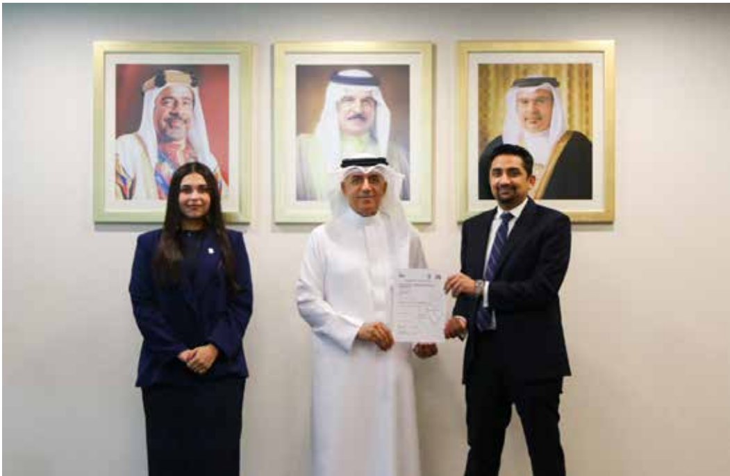
The award ceremony

These international certifications represent globally recognised benchmarks for excellence in records management practices. BENEFIT's receipt of ISO 15489-1:2016 underscores the company's robust capabilities in managing records throughout their lifecycle—spanning classification, storage, access, and secure disposal. The certification follows a comprehensive and meticulous audit conducted by the British