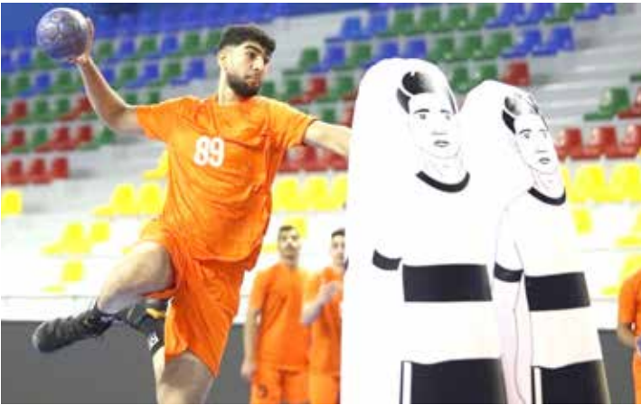
Action from training

Bahrain’s route to Cairo was paved by a fifth-place finish at last year’s Asian Youth Championship in Amman, where they faced familiar foes like Japan and Korea. Their 2007 debut remains their best U 19 World result, reaching the eight-team