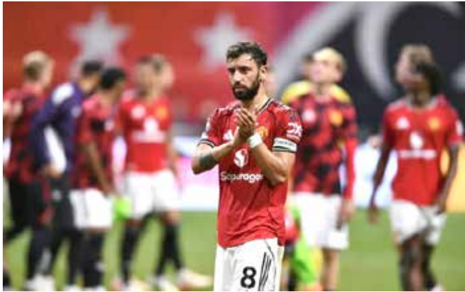
Bruno Fernandes of Manchester United greets teammates after the match

Bruno Fernandes scored one goal and set up another as Manchester United drew Everton 2-2 on Sunday to capture the Premier League Summer Series title.