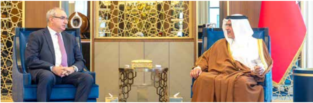
HRH Prince Salman with H.E. Israel Ambassador Eitan Na'eh

role towards achieving peace, stability, and development in the region and across the world. His Royal Highness outlined the Kingdom's steadfast position in supporting the Palestinian cause, aimed at achieving a just and lasting solution that guarantees the legitimate rights of the Palestinian people. HRH the Crown Prince and Prime Minister, also emphasised the importance of de-escalation, the protection of civilians, and