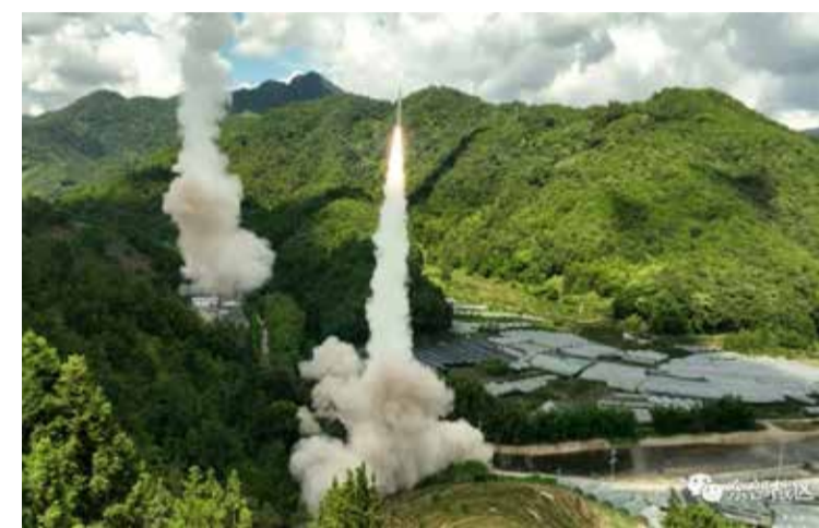
A projectile being launched from an unspecified location in China

ballistic missiles into Taiwan strait as exercises begin