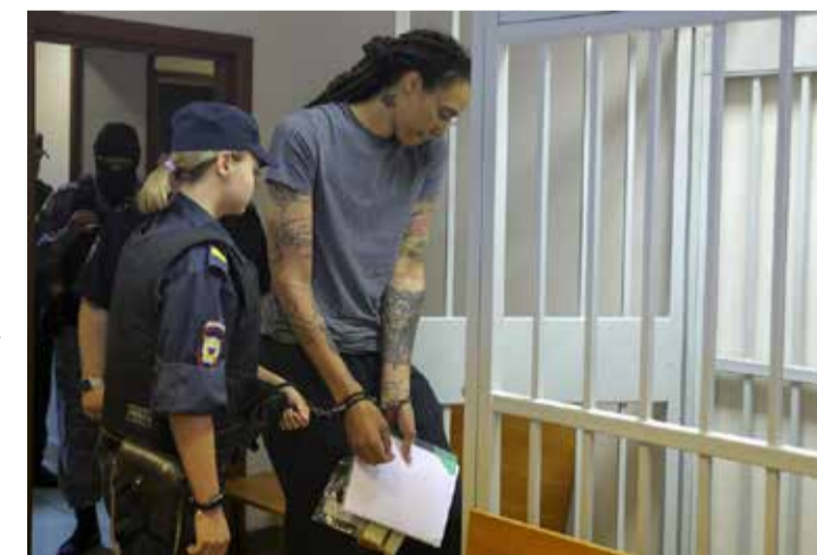
Brittney Griner, right, enters a cage in a courtroom prior to a hearing

down in tears in court. The court also fined her 1 million roubles ($16,990).