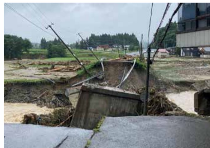
A broken bridge and power lines are seen after heavy rains in Japan