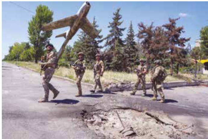
Soldiers of the Alcatraz Battalion patrol along the frontline town of Druzhkivka, in the Donetsk region, amid the Russian invasion of Ukraine

The Peterhof palace is a giant estate of gardens and a palace built in the 18th century under