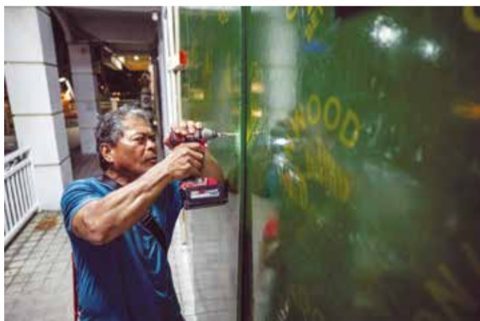
A restaurant worker boards up a restaurant ahead of the arrival of the forecasted Super Typhoon Bavi in Guam, Northern Mariana Islands

Just months after a major storm hit, cars in Saipan, in the Northern Marianas, queued at petrol stations on Saturday,