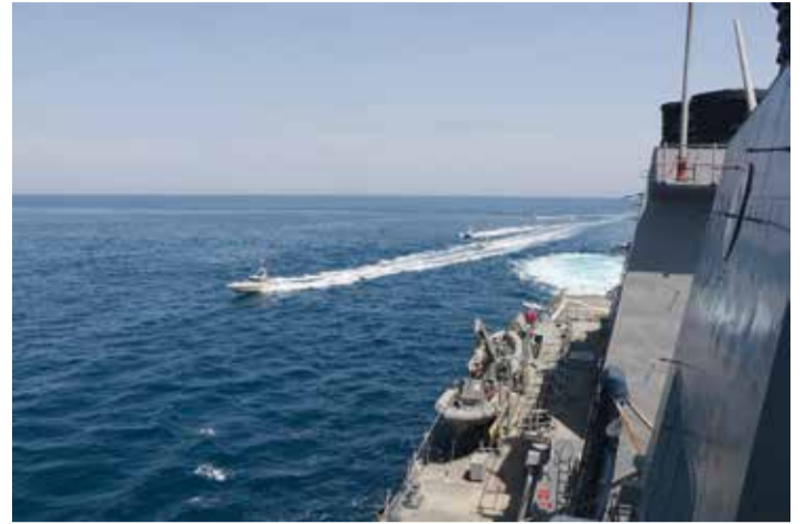
Iranian Attack Boats Harass U.S. Navy, Coast Guard Vessels (US Naval Institute)