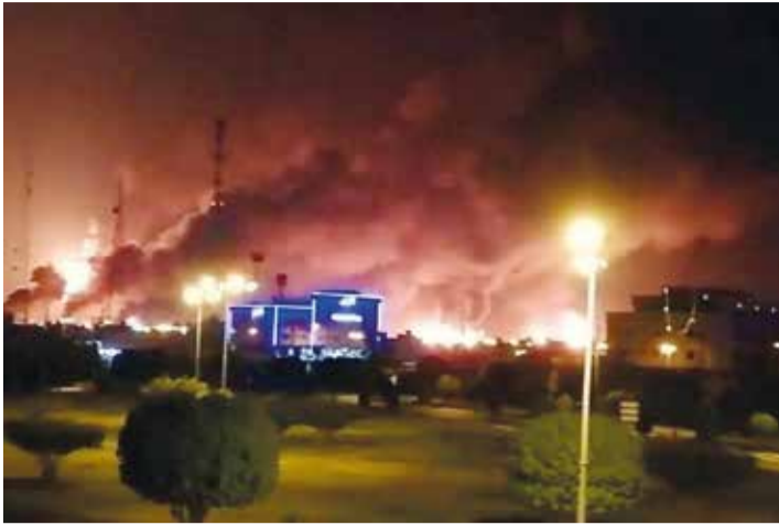
The US has reportedly identified locations in Iran from which drones and cruise missiles were launched against major Saudi oil facilities (BBC)