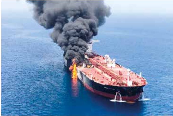
Several oil tankers and US drone have been attacked since May either in, or near, the Strait of Hormuz