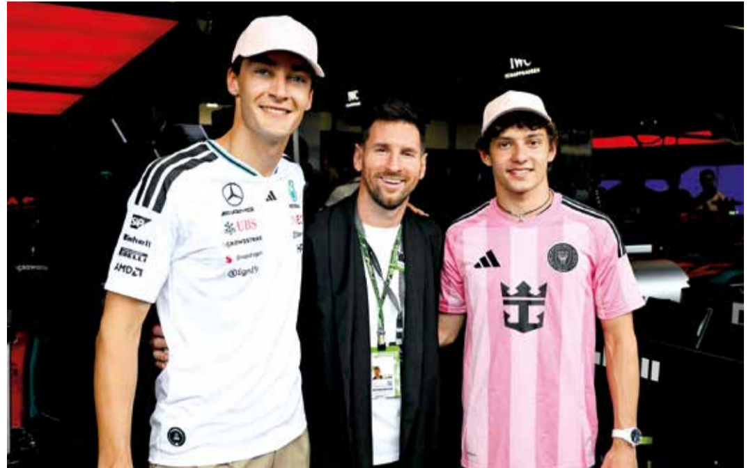
Lionel Messi with Mercedes drivers George Russell (L) and Andrea Antonelli (R)

Antonelli's win was another milestone in his remarkable rise. The 19-year-old secured his third consecutive victory from pole and became the youngest driver to lead the championship, continuing a record-breaking start to his career.