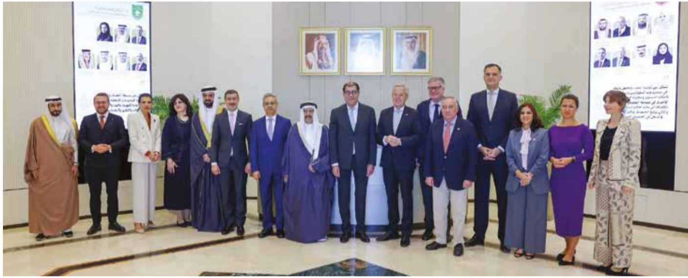
First Deputy Chairman Jamal Mohammed Fakhro and members of the Shura Council and the Council of Representatives with the European Parliament delegation

Parliamentary diplomacy stressed as key pillar of foreign policy