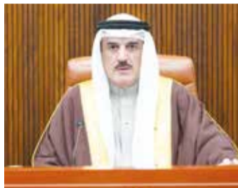
Ahmed Al Musallam, Speaker of Parliament