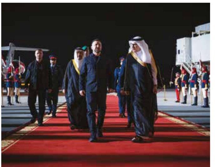
Ukrainian President Volodymyr Zelensky arrived in Bahrain on Sunday for an official visit. Foreign Minister Dr. Abdullatif bin Rashid Al Zayani and other senior officials received him at Bahrain International Airport.