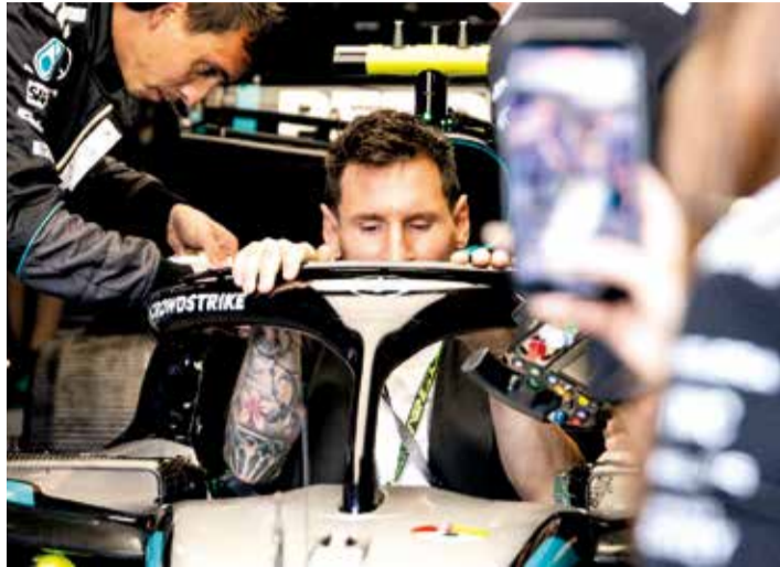
Messi in the cockpit of Andrea Antonelli's Mercedes-AMG F1 W17 E Performance car

Antonelli extends winning run in Miami as football royalty looks on