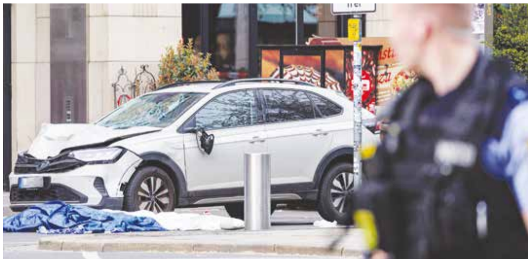
Members of the emergency services work at the scene where a car ploughed into people on a street leaving at least two dead and several injured, in the city centre in Leipzig, eastern Germany