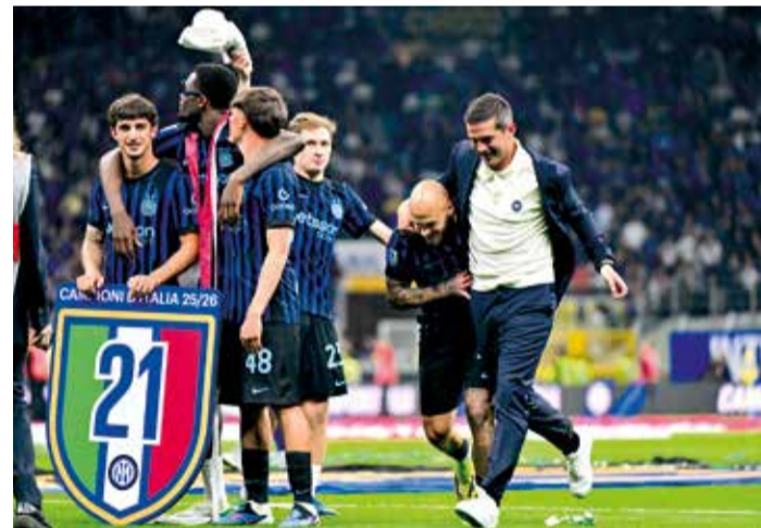
Inter Milan's Romanian head coach Cristian Chivu celebrates with Inter Milan's Italian defender #32 Federico Dimarco

Como's refusal to release Fabregas led to Chivu's arrival