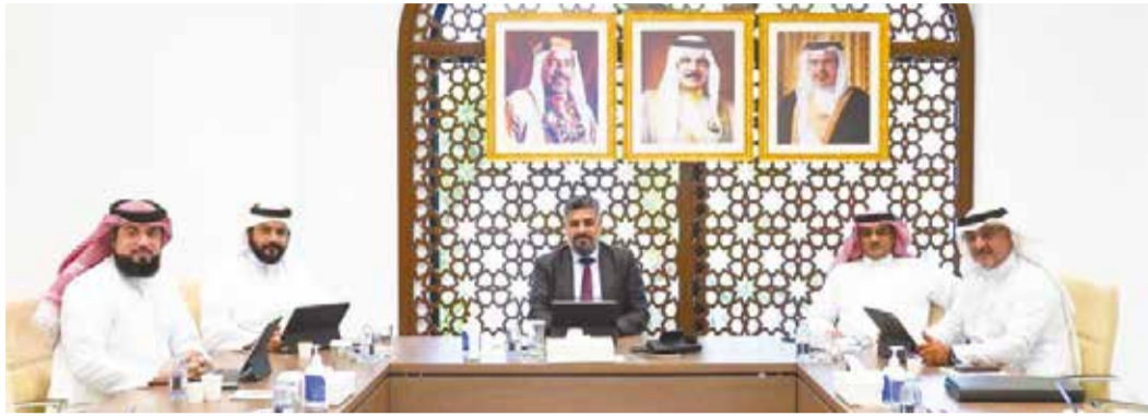
Parliament's Legislative and Legal Affairs Committee

The note said that action included stripping citizenship from those involved, as well as