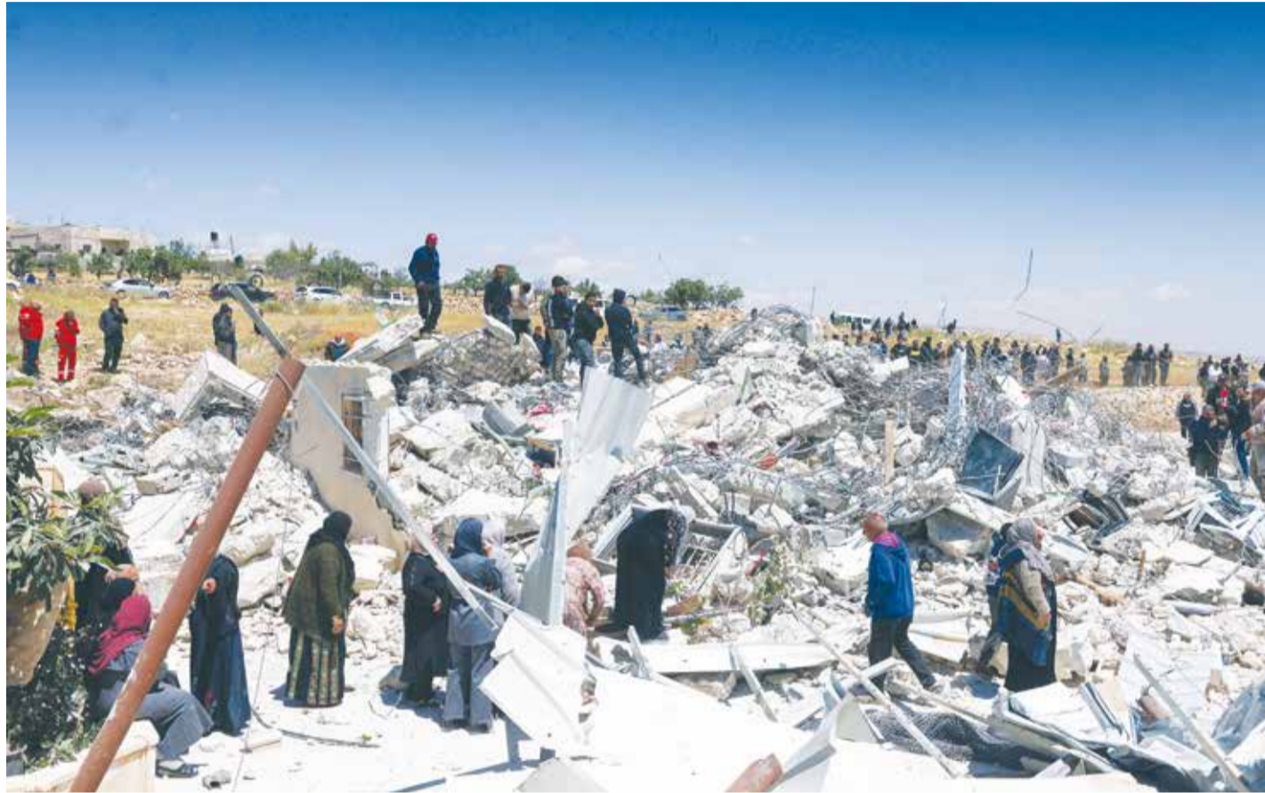
Palestinians inspect the debris of a demolished house that was built without a permit, in the village of al-Dirat near Yatta town in the occupied West Bank city of Hebron

"It's a project that the EU is developing with local and international NGOs with the aim of documenting attacks on Palestinians by violent Israeli settlers and to support the communities that are victims of such attacks," the office of the EU representative in the Palestinian Territories told AFP.