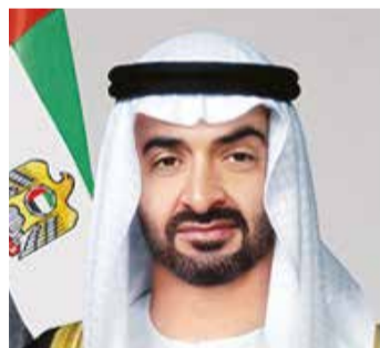
UAE President Shaikh Mohamed bin Zayed Al Nahyan

The king expressed "strong condemnation and denunciation" of the attacks, calling them a dangerous escalation that threatens regional security and stability, and a "blatant violation" of principles of good neighbourliness and international laws and conventions.