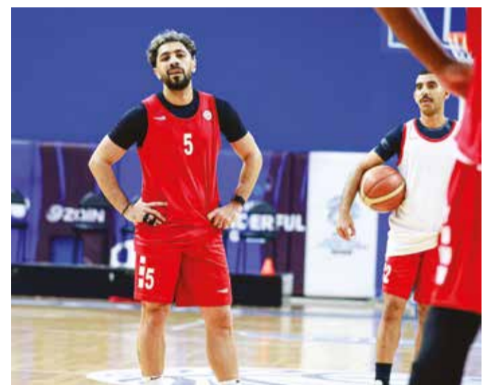
Bahrain's national basketball team in training prior to the announcement