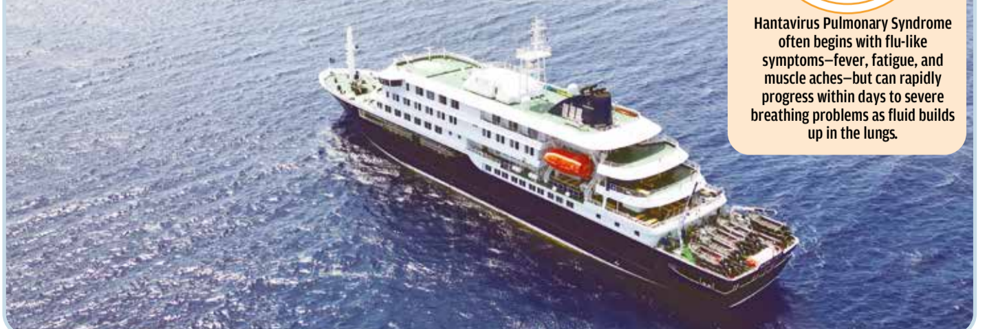
A general view of the cruise ship MV Hondius stationary off the port of Praia, the capital of Cape Verde

Hantavirus Pulmonary Syndrome often begins with flu-like symptoms—fever, fatigue, and muscle aches—but can rapidly progress within days to severe breathing problems as fluid builds up in the lungs.