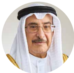
HE Shaikh Khalid bin Abdullah Al Khalifa

The Cabinet reaffirmed the importance of His Majesty King Hamad bin Isa Al Khalifa's recent address to the media, describing it as a guiding framework for protecting Bahrain's interests, strengthening security and stability, and sustaining national development.