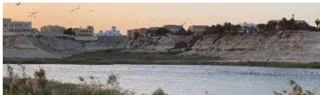
Wadi Al Buhair

Two more phases are in progress: the second is set to go to tender after design and funding approvals, and the third is nearing final design. Works will include roads, sewage networks,