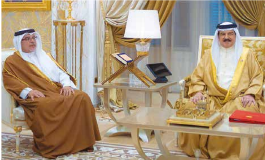
HM the King, in the presence of HRH Prince Salman, receives a formal declaration of loyalty from Shaikh Salman bin Khalid Al Khalifa

Royal Family Council renews pledge of loyalty to the King