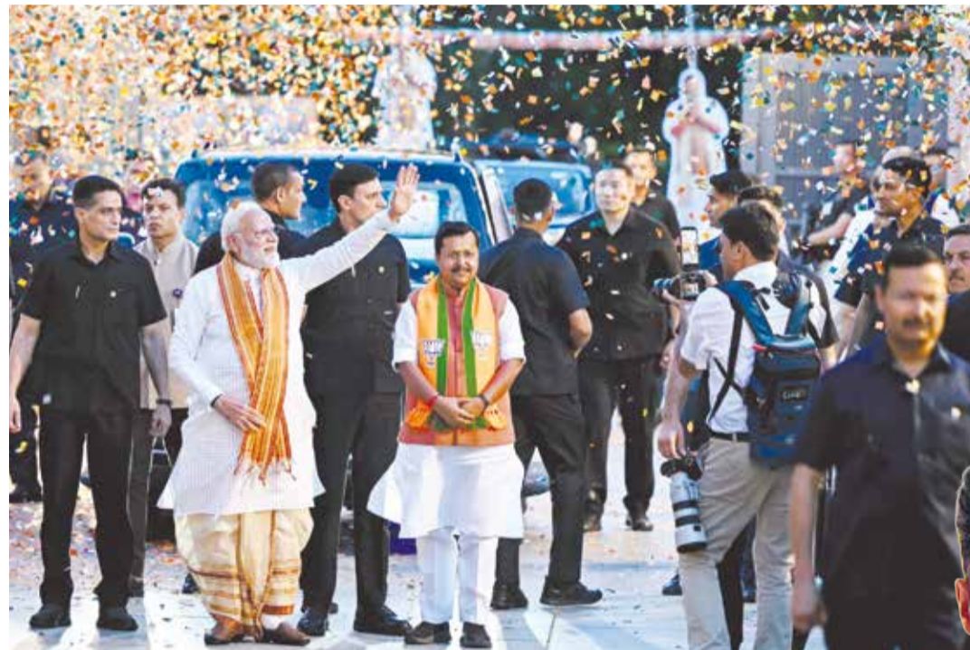
India's Prime Minister and Bharatiya Janata Party (BJP) leader Narendra Modi (2L) waves to supporters as he arrives at party headquarters in New Delhi

sembly Elections will be remembered forever," Modi said on social media. "People's power has prevailed and BJP's politics of good governance has triumphed."