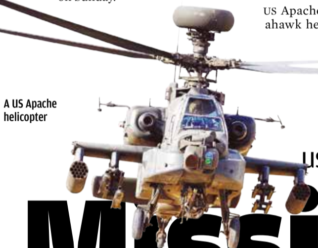
A US Apache helicopter

and, consistent with our commitment, we defended all the commercial ships," Cooper said. US and Israeli forces launched a massive military campaign against Iran on February 28, prompting Iran to close the Strait of Hormuz -- a vital route for oil and gas exports -- while American forces later launched a blockade of Iranian ports. Iranian state television said earlier Monday that the country's navy had fired cruise missiles, rockets and combat drones near US destroyers crossing the strait in what it described as a "warning shot." CENTCOM said that two US guided-missile destroyers had passed through the strait into the Gulf as part of "Project Freedom," while two US-flagged merchant vessels transited the opposite way and "are safely headed on their journey."