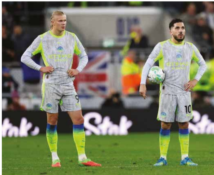
Erling Haaland and Rayan Cherki look dejected at Everton's Hill Dickinson Stadium

Everton's favour five minutes later when Jake O'Brien rose highest to head in from a corner, putting the home side 2-1 up. The pressure continued to build on City, and in the 81st minute Everton extended their