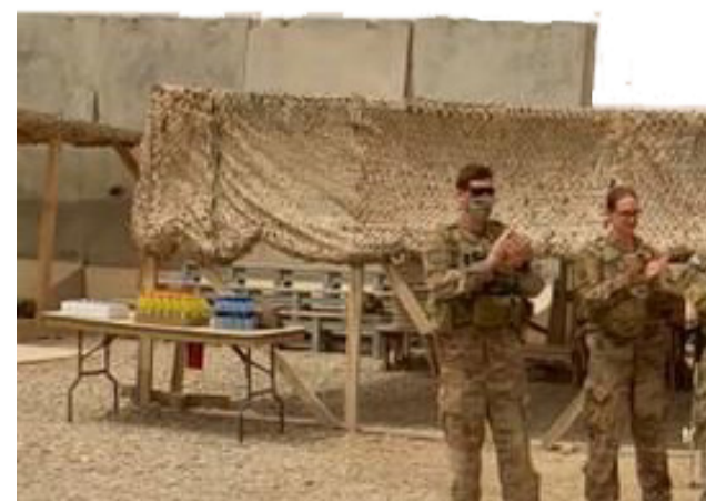
Handover ceremony at Camp Anthonic, from U.S. Army to Afghan Defen...

Afghan security forces fought back a huge Taliban offensive in southern Helmand province in the last 24 hours, officials and residents said on Tuesday, as militants launched assaults around the country following a