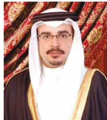
HRH Prince Salman

His Royal Highness noted that achievements are a meas-