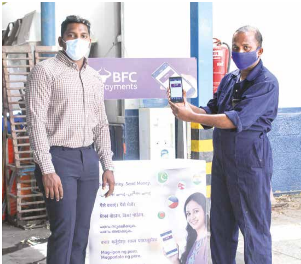
A timely digital transfer of wages for workers