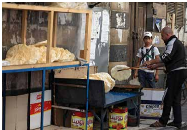
A Syrian vendor prepares on a traditional sweet known as "naaem"