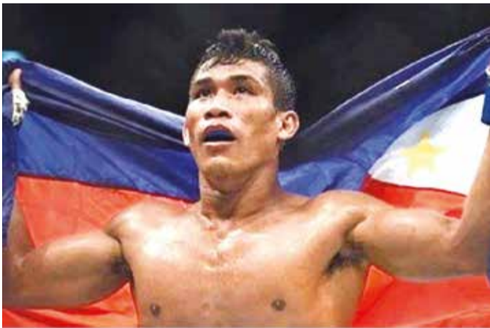
Lausa is motivated to come back stronger

With a new home at Brave, the 32-year-old Concepcion, Il-