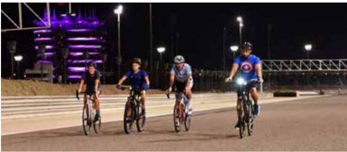
Cyclists and runners get an opportunity to train or simply casually exercise

This week's event takes place between 5.30pm and 8.30pm at "The Home of Motorsport in the