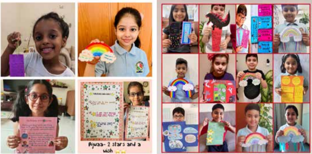
Students take part in fun-filled and exciting guided activities of the students.

Premised on the theme "Explore and Excel", the event aimed at promoting linguistic competence, effective communication skills and the creativity