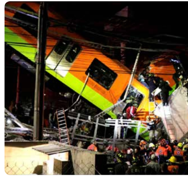
In pictures, rescuers work at a site where an overpass for a metro partia...