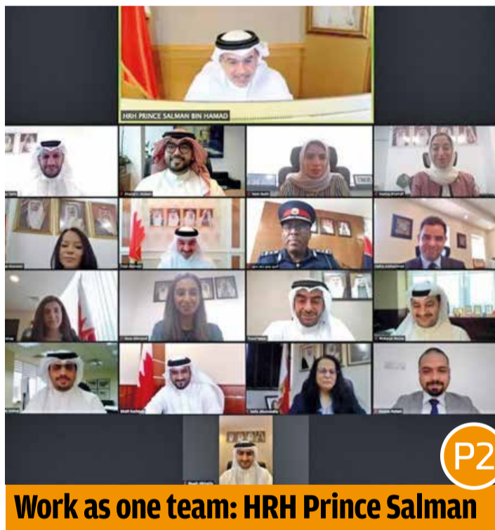
Work as one team: HRH Prince Salman

The latest rocket attack follows one against an air base at Baghdad airport housing US-led coalition troops on Sunday night, and another against Balad air base, which hosts US contractors, north of the capital on Monday night.