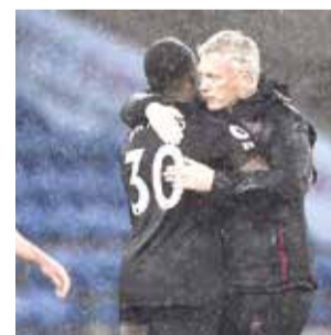
David Moyes celebrates a victory with Michail Antonio