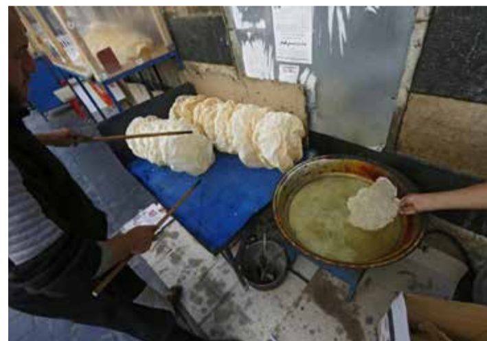
A Syrian vendor prepares on a traditional sweet known as "naaem"