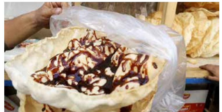
A Syrian vendor shows a traditional sweet known as "naaem"

Just a stone's throw away from Abu Tareq's shop, the scent of more freshly baked pastries wafts out of some of the sweets