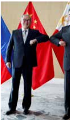
China's Foreign Minister Wang Yi and Philippine's Foreign Affairs Secretary Teodoro Locsin Jr., bump th...

"It is hoped that relevant people in the Philippines will comply with basic etiquette and their position when making remarks."