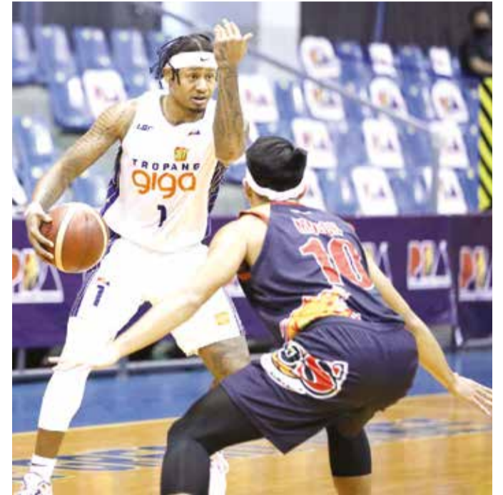
Parks' absence is a big blow for Tropang Giga