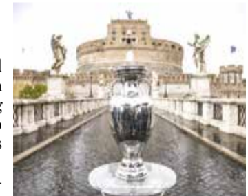
The trophy of the UEFA Euro 2020 is pictured on Sant'Angelo bridge in Rome

UEFA clarified that the current regulations that allow coaches to change their squads after the cut-off point of June