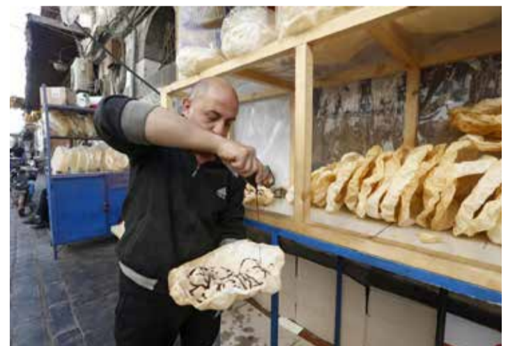
A Syrian vendor spreads grape molasses on naaem