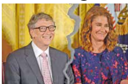
Gates couple ... marriage is irretrievably broken

The billionaire benefactors who are co-founders of one of the world's largest private charitable foundations, the Bill and Melinda Gates Foundation, said they have come to an agreement on how to