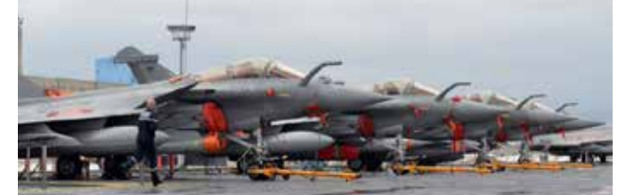
French Navy Rafale fighter jets are seen onboard the Charles de Gaulle aircraft carrier, currently moored at the port of Limassol, Cyprus

A French official said financing for the deal would be finalised on Tuesday with up to 85% guaranteed by the French state.