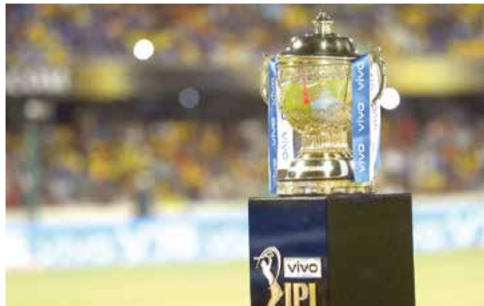
The Indian Premier League trophy is seen at a stadium

"The Indian Premier League Governing Council and Board of Control for Cricket in India in an emergency meeting has unanimously decided to post-