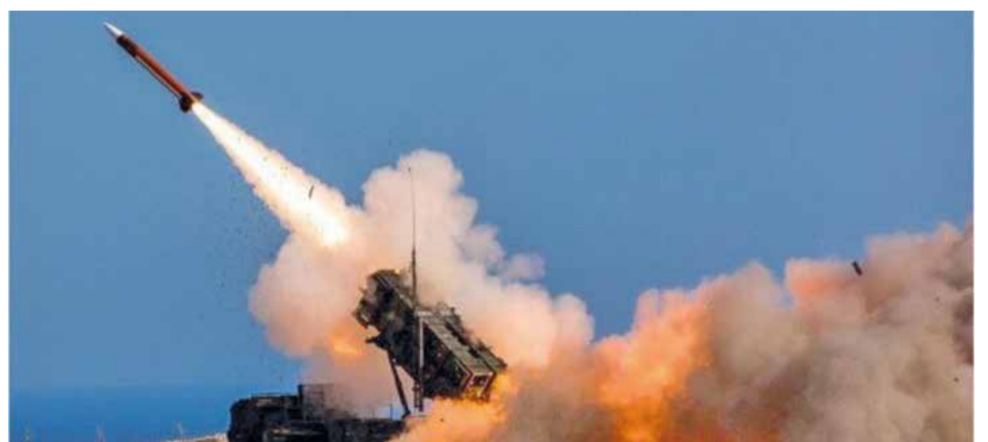
Coalition forces foil missile and drone attack by Houthi militants

The Council of the Arab Ministers of Interior called for holding the Iranian-backed militia accountable, as it exceeded all religious, humanitarian and ethical limits and values, during the Holy Month of Ramadan.