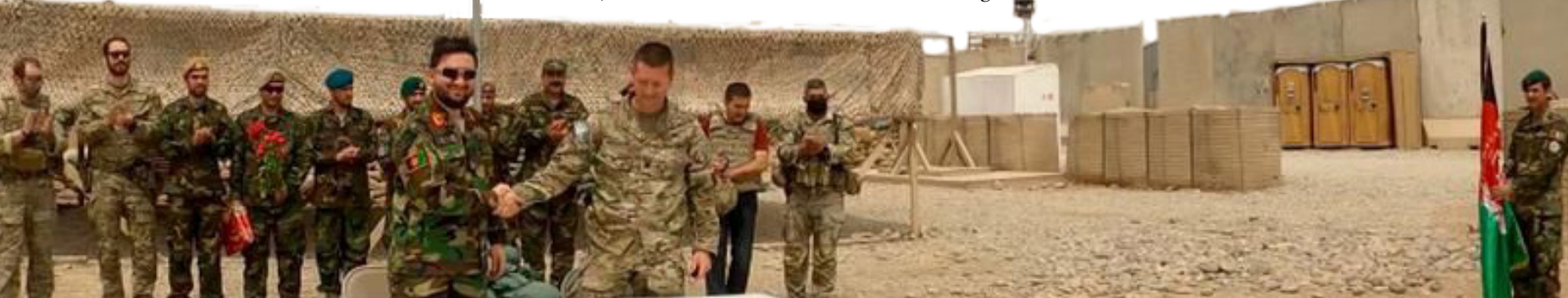
US Forces in Helmand province, Afghanistan

Afghan security forces had launched air strikes and deployed elite commando forces to the area. The insurgents had been pushed back but fighting was continuing on Tuesday and hundreds of families had been displaced, he added.