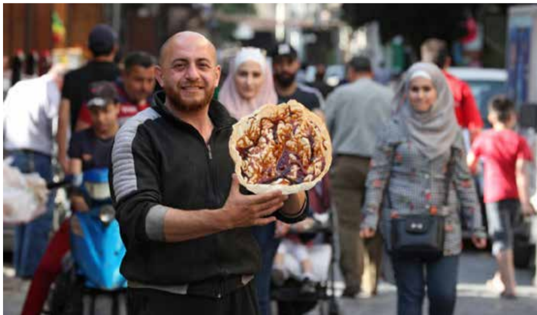
A Syrian vendor holds on a traditional sweet known as "naaem"

At around 2,500 Syrian pounds (less than a dollar), the crunchy dessert is still one of the few affordable ones, he said.