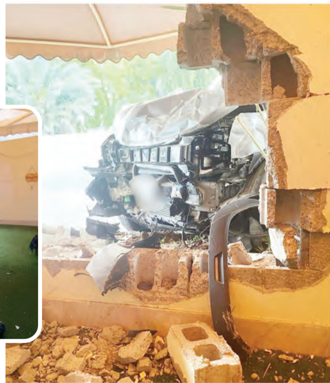
The aftermath of the crash

no injuries were reported inside the household. The family and rushed outside to find significant damage to their property.