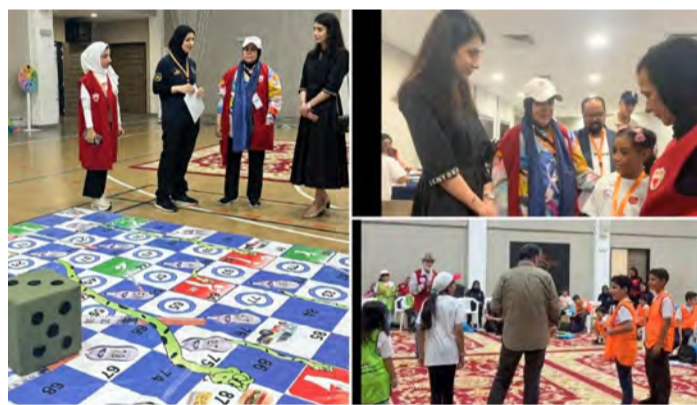
Flashback to the Shurooq camps organised by the Bahrain Diabetes Society supporting children with diabetes.

Specialists note that children exposed to such conditions