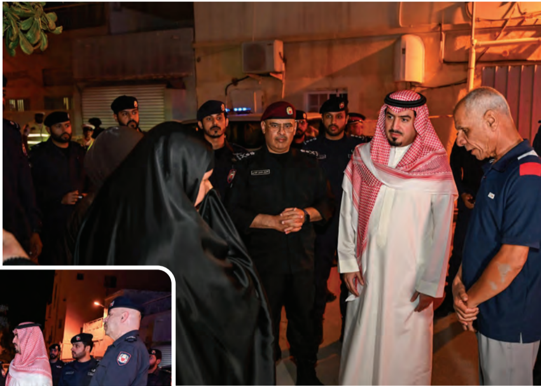
Chief of Public Security Lt. Gen. Tariq bin Hassan Al Hassan and Capital Governor Shaikh Khalid bin Hamood Al Khalifa visited affected homes in Sitra after falling shrapnel caused minor damage.

The incident occurred in the early hours of April 4, when Bahrain's air defense systems successfully intercepted and destroyed hostile drones. Debris from the interception fell over residential areas in Sitra, causing limited property damage.