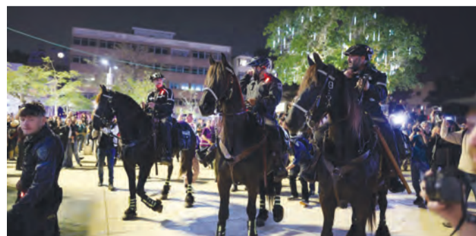
Israeli mounted police intervene during a protest by left-wing activists against the ongoing war with Iran at HaBima Square in Tel Aviv

"Effective retroactively from March 9, 2026, Planet is moving to a managed access model, extending the publication delay