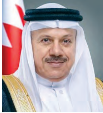
His Excellency Dr. Abdullatif bin Rashid Al Zayani, Minister of Foreign Affairs

preciation for the coordinated diplomatic efforts and high-