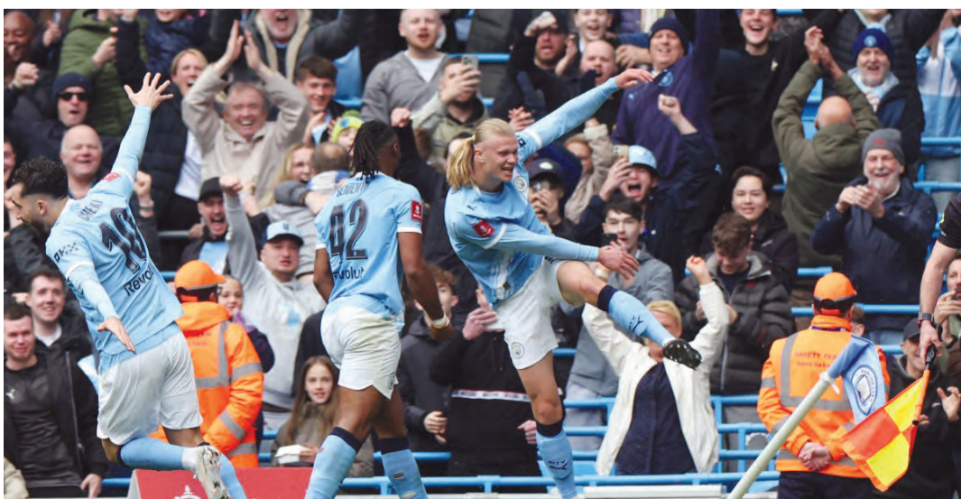
Manchester City's Norwegian striker #09 Erling Haaland (C) celebrates with teammates after scoring their second goal during the English FA Cup quarter final football match between Manchester City and Liverpool at the Etihad Stadium in Manchester, north west England

Liverpool's wretched performance, which also including a missed Mohamed Salah penalty when the score was 4-0,