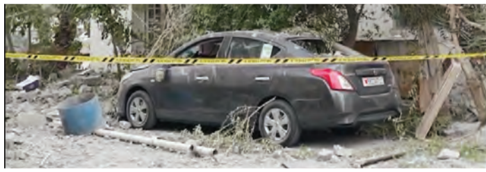
A heartwarming moment as His Majesty King Hamad connects with beneficiary children from the programme.

Another resident reported serious structural damage to a house, stating that parts of the building were destroyed. "The wall was broken and the roof