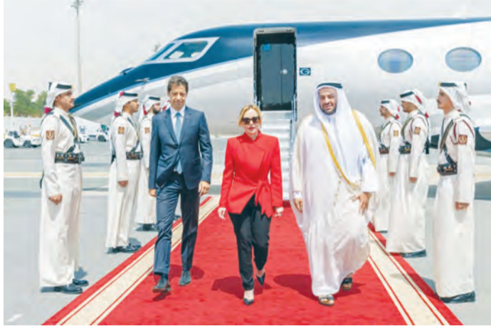
Italy's Prime Minister Giorgia Meloni (C) walking upon arrival at the Doha International Airport in Doha

Italian Prime Minister Giorgia Meloni arrived in the United Arab Emirates yesterday on the third and final leg of a trip that also took her to Qatar and Saudi Arabia.