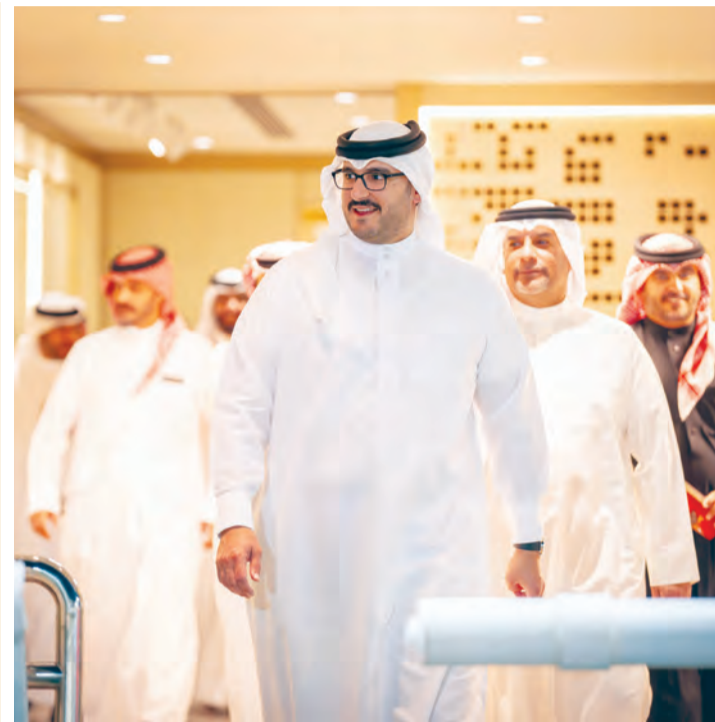
His Highness Shaikh Isa bin Salman bin Hamad Al Khalifa's arrival