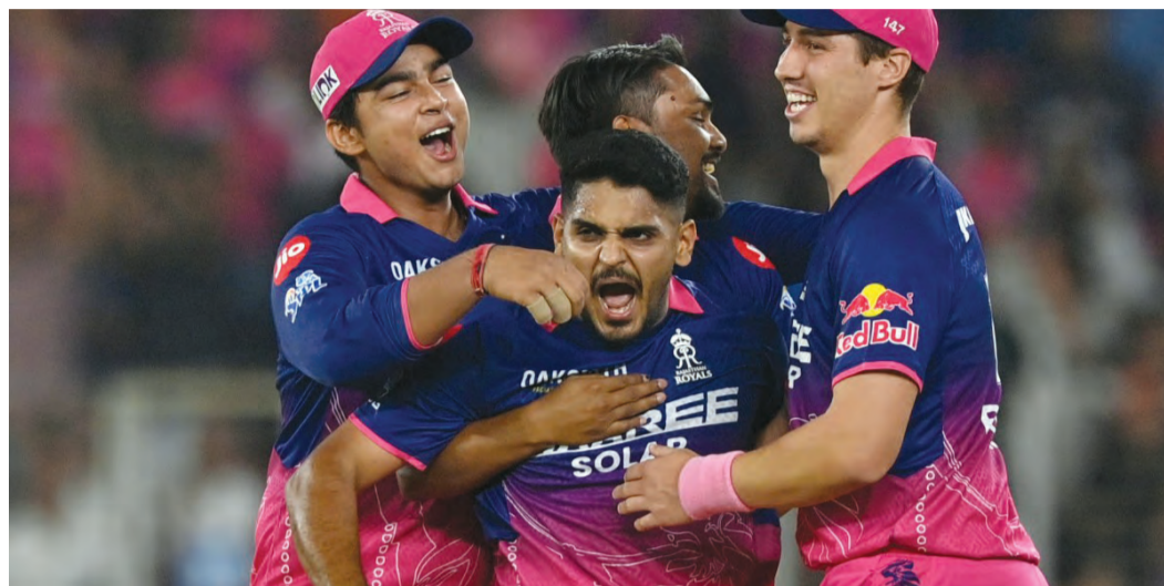
Rajasthan Royals' players celebrate after winning the 2026 Indian Premier League (IPL) T20 match between Gujarat Titans and Rajasthan Royals at the Narendra Modi Stadium in Ahmedabad

Deshpande started with a wide to Kagiso Rabada, who hit an unbeaten 23, but soon nailed