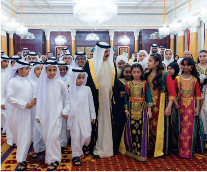
A heartwarming moment as His Majesty King Hamad connects with beneficiary children from the programme.