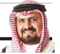
CAPTAIN MAHMOOD AL MAHMOOD

In defining moments of a nation's history, it is not words that are tested, but actions. Patriotism is not measured by what is said, but by what is done.