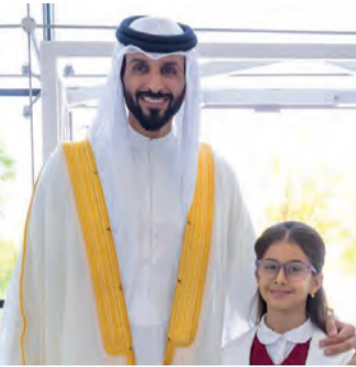
His Highness Shaikh Nasser bin Hamad Al Khalifa shares a smile with children

The report shows that 10,857 orphans and widows were under sponsorship during 2025, while the total number of beneficiaries since the Foundation's establishment reached 31,794. It also recorded the distribution of 2,458 school bags, the implementation of 180 programs and events benefiting 6,878 participants, and