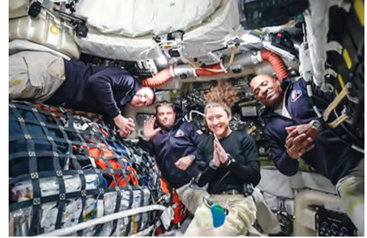
the four Artemis II crew members (L-R) Canadian Space Agency (CSA) astronaut Jeremy Hansen, Artemis II mission specialist, NASA astronaut Reid Wiseman, Artemis II commander, Christina Koch, Artemis II mission specialist and Victor Glover, Artemis II pilot as they head to orbit the Moon for the first time in more than half a century.

The space agency earlier released images from Orion that included a full portrait of Earth, featuring its deep blue oceans and billowing clouds.