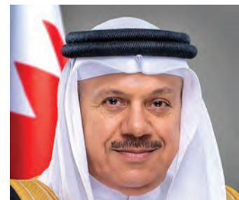
H.E. Dr. Abdullatif bin Rashid Al Zayani

Foreign Minister, His Excellency Dr. Abdullatif bin Rashid Al Zayani, said Bahrain's diplomatic approach continues to be guided by the leadership of HM King Hamad bin Isa Al Khalifa and the directives of HRH the Crown Prince and Prime Minister, Prince Salman bin Hamad Al Khalifa. He noted that the United Nations' recognition of the International Day of Conscience, observed annually to-