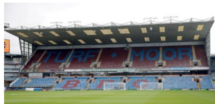
General view inside Burnley's Turf Moor stadium

Burnley expect to lose five million pounds in match-day revenue as their remaining