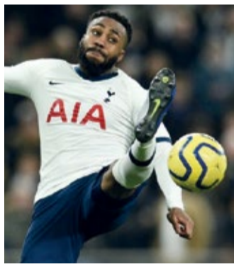
Danny Rose kicks the ball during a match (file photo)

on loan, and his parent club, Tottenham, are among clubs to have furloughed some non-playing staff during the crisis, prompting criticism as players continue to receive their full salary.