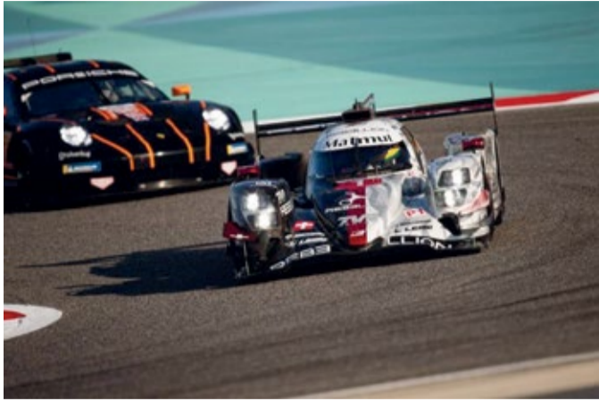
Cars in action during Bapco 8 Hours of Bahrain at BIC (file photo)