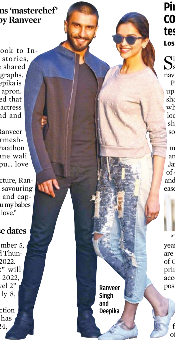
Ranveer Singh and Deepika

In the last picture, Ranveer was seen savouring some dessert and captioned it: "Deepu my babes ur my one true love."