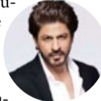
Shah Rukh Khan

The superstar's decision to donate his office comes just a couple of days after he made huge contributions to the government to aid the battle against the COVID-19 pandemic.