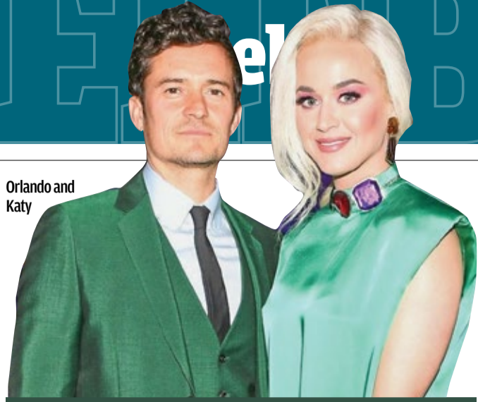
Orlando and Katy