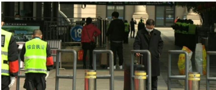
Coronavirus: Three-minutes of mourning at Wuhan railway station

In France, 160,000 police officers and gendarmes fanned out nationwide to ensure people were heeding the confinement rules despite the start of the Easter holidays, when French families traditionally head to the beach, countryside or mountains.