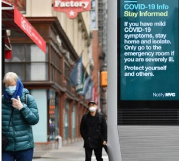
Officials in New York, the worst affected part of the US, began advising people to wear masks some days ago, and there were signs on the streets that the advice was being heeded

The US recommendation will likely worsen an already severe shortage of