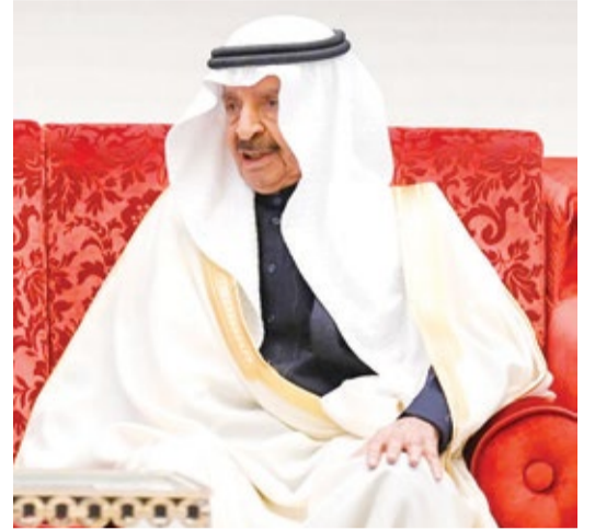
HRH the Prime Minister

HRH the Prime Minister Prince Khalifa bin Salman Al Khalifa marks International Day of Conscience, which promotes peace and harmony