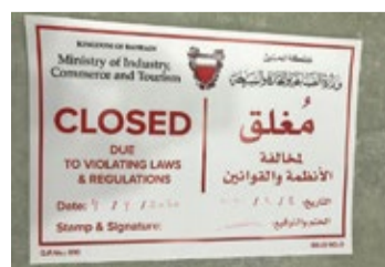
A picture of the Ministry's notice of the closure of the pharmacy

The Ministry slammed the greedy hiking of prices as an irresponsible and unacceptable act. It had stated recently that such actions would be addressed with zero tolerance, especially at a time when such goods are necessary and are