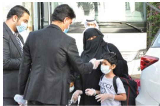
Officials check the temperature of a young boy as he is brought back to Bahrain with his family from Saudi