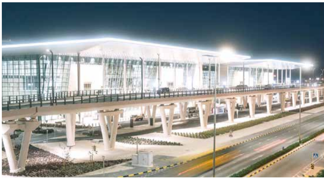
Bahrain International Airport

'The Airport Operator of the Year' award recognises BAC's commitment to excellence in managing and operating BIA, delivering top-notch services,