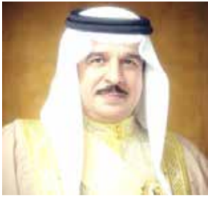
HM the King | Manama

His Majesty King Hamad bin Isa Al Khalifa yesterday received a cable of thanks from King Salman bin Abdulaziz Al Saud, the Custodian of the Two Holy Mosques, in reply to HM's congratulations on Saudi Arabia's Founding Day.