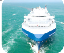
Vessel targeted off Yemen: security firm

A Liberian-flagged vessel was targeted off Yemen, maritime security firm Ambrey said yesterday, adding that the vessel had been listed as "Israeli-affiliated". "The vessel was listed as operated by the Israeli company ZIM Integrated Shipping Services," Ambrey said but added that "this may have been an out-of-date affiliation". It said the "container ship was targeted approximately 88 miles (163 kilometres) southeast of Aden, Yemen", adding that it was en route from Singapore to Djibouti. "The vessel was reportedly struck and issued a distress signal," the firm said.