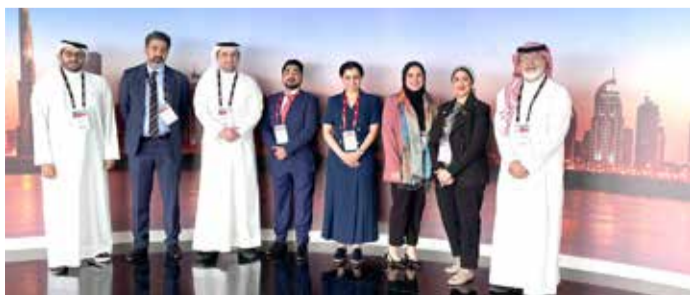
Participants during a photocall