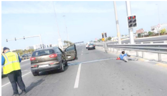
Due to inadequate safety measures, the area has become accident prone

He expressed his concerns, saying, "Efforts have been made to engage with various government entities to open an additional entrance for the district that is not linked to Diyar Al Muharra, but rather an independent access point. However, the Ministry of Works continues to claim that it is under consid-