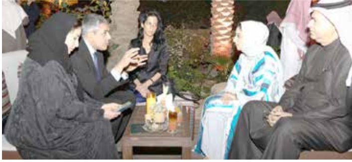
The meeting with UN officials

During a meeting with Zurab Pololikashvili, Secretary-General of the UN Tourism, the minister stressed Kingdom's support for the United Nations Tourism Organization.