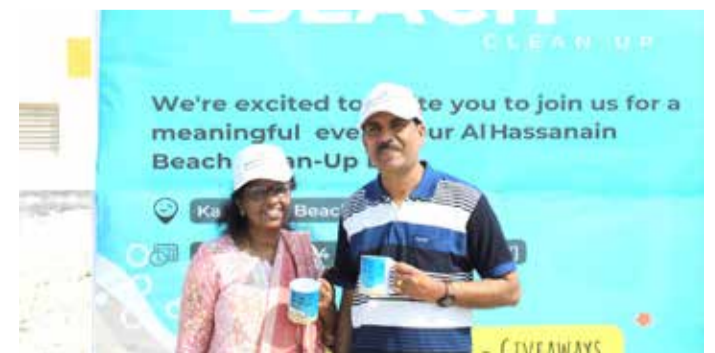
Participants in the noble cause