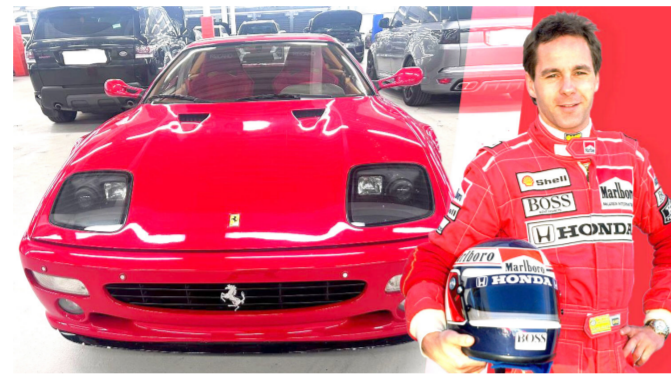
The Austrian explained that his red F512M Testarossa had disappeared from outside his hotel.

AFP | London, United Kingdom Ferrari stolen from Austrian former racing driver Gerhard Berger after the San Marino Grand Prix in 1995 has been recovered, Britain's Metropolitan Police said Monday. Berger and fellow F1 star Jean Alesi lost their private cars on the same day in April 1995 to car thieves working near the circuit at Imola.