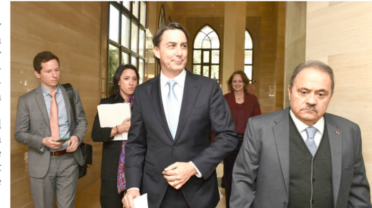
US special envoy Amos Hochstein (C) arrives to meet Lebanon's Parliament Speaker in Beirut

US envoy said yesterday that a diplomatic solution was key to ending nearly five months of intensifying hostilities between Lebanon's Hezbollah and Israel after the eruption of the Israel-Hamas war. Israel and the Iran-backed Hezbollah movement have been exchanging near-daily fire since October, raising fears all-out conflict could spread across the region.