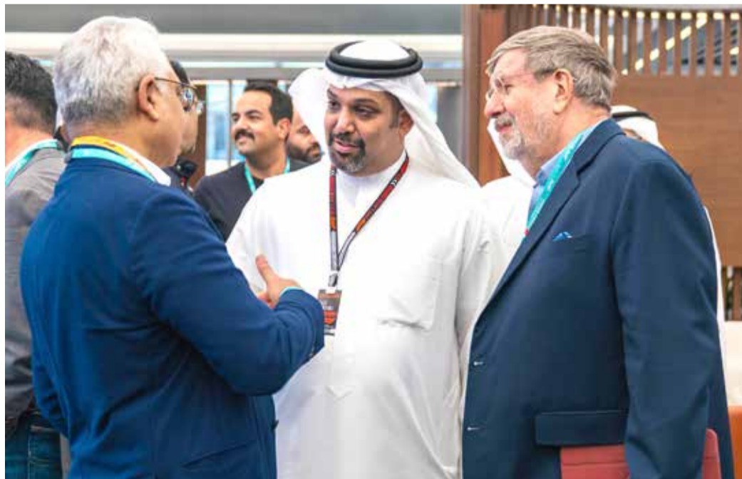
The Minister of Finance and National Economy, His Excellency Shaikh Salman bin Khalifa Al Khalifa, with Mumtalakat officials, investors and guests during a gathering hosted by Bahrain Mumtalakat Holding Company "Mumtalakat", the sovereign wealth fund of Bahrain, at this year's Paddock Club at the 2024 Formula 1 Gulf Air Bahrain Grand Prix. Mumtalakat explored investment opportunities for partnerships across a variety of sectors and industries on the sidelines of the 2024 Formula 1 Gulf Air Bahrain Grand Prix.