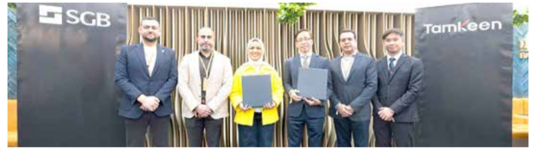
Officials following the deal signing