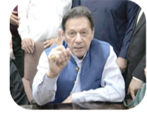
Pakistan ex-PM Khan's lawmakers denied reserved parliament seats

Pakistan's election commission yesterday blocked lawmakers loyal to jailed ex-prime minister Imran Khan from taking a share of parliamentary seats reserved for women and minorities after a poll marred by rigging claims. The decision was published shortly after Prime Minister Shehbaz Sharif -- who helped oust Khan in 2022 -- was officially sworn in as premier at a ceremony in the capital. In Pakistan's National Assembly of 336 lawmakers, there are 70 seats reserved for women and non-Muslims, assigned to parties proportionally according to their success at the polls. Khan's Pakistan Tehreek-e-Insaf (PTI) party was targeted by a military-backed crackdown ahead of the February 8 vote with