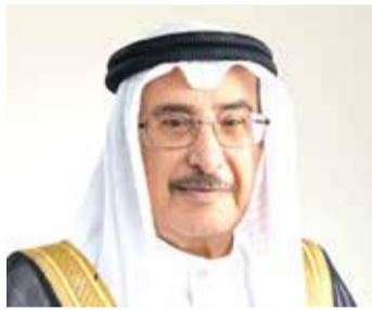
H.E. Deputy Prime Minister

This was among the several memorandums discussed and approved by the Cabinet during