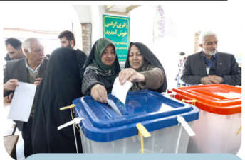
Iran announces 41% turnout in parliamentary elections

Iran yesterday announced a turnout of 41 percent in last week's elections for parliament and a key clerical body -- a record low since the 1979 Islamic Revolution, according to voting records. Conservatives were reported to have secured the bulk of seats in Friday's elections for the national legislature and Assembly of Experts, the body which selects Iran's supreme leader. "Around 25 million people participated, with a turnout of 41 percent," Interior Minister Ahmad Vahidi told a press conference in Tehran. The vote was the first since nationwide protests broke out following the September 2022 death in custody of 22-year-old Mahsa Amini. Amini, an Iranian Kurd, had been arrested for allegedly flouting the Islamic republic's strict dress code for women. The elections, in which a vetting process barred many hopefuls including moderates and reformists from running, took place as Iran suffers a severe economic crisis deepened by international sanctions.