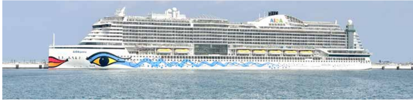
Doha will welcome world-class yachts and boats at the event

Against the backdrop of Doha's stunning skyline, the event promised to be an opulent celebration of marine life, leisure, and luxury unlike ever seen before. Scheduled for November 6th to 9th, 2024, the QBS aimed to be a spectacular showcase, bringing together world-class superyachts and boats, cutting-edge innovation, and captivating entertainment, all redefining the standards of maritime excellence.