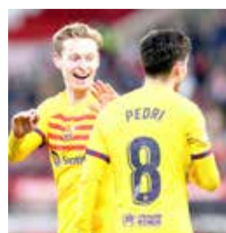
Frenkie de Jong and Pedri

Despite a promise from the club's hierarchy Tuchel would see out the season, German media are claiming the notoriously prickly coach could be out of a job as soon as Tuesday depending on the side's performance.