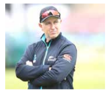
New Zealand head coach Gary Stead looks on during training

"It was a tricky wicket. It spun and bounced a lot more than what we were expecting," he said of New Zealand's deci-