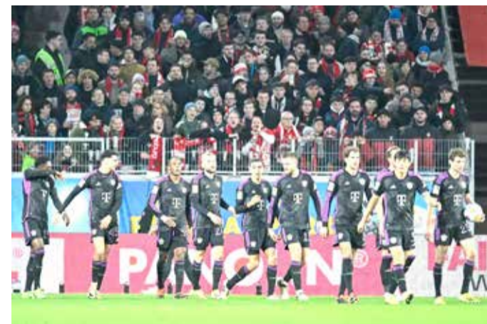
Bayern Munich's players celebrates during a match (file photo)