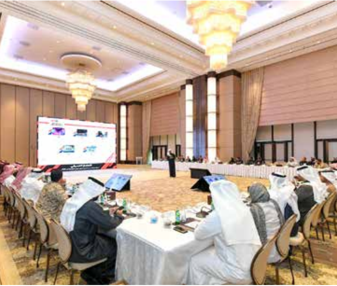
Ageneral view during the meeting