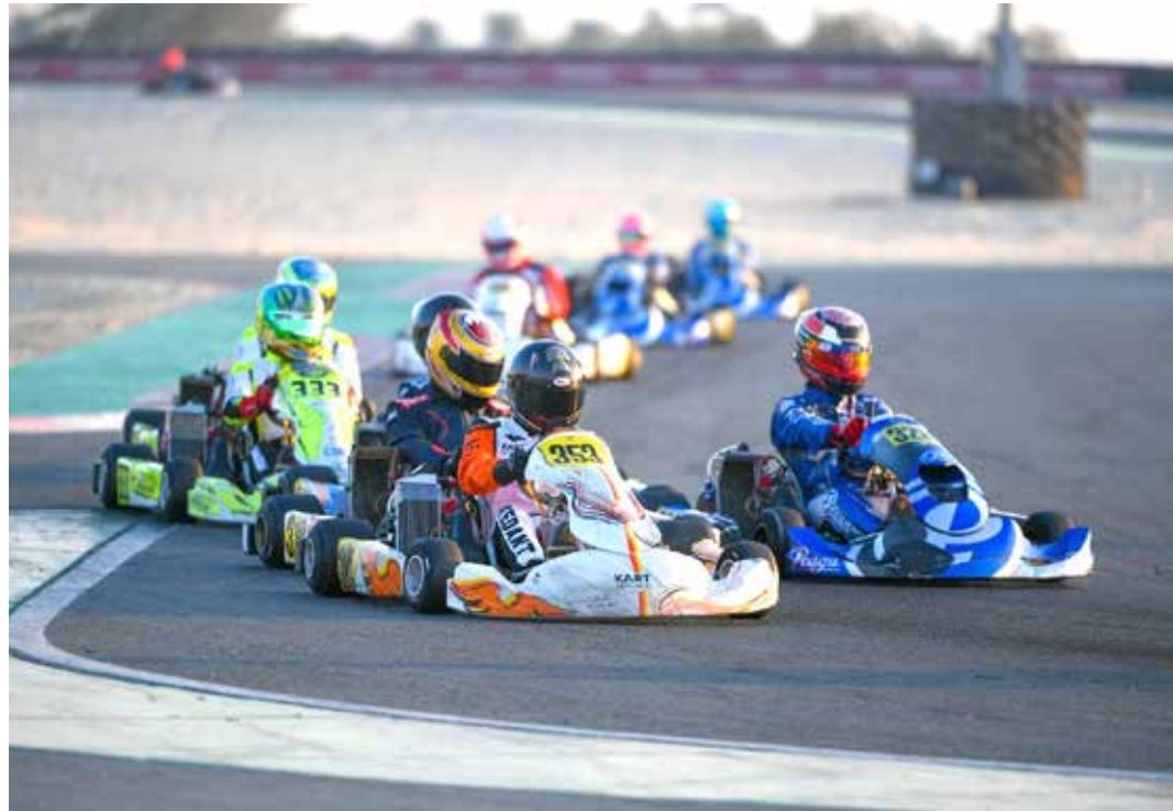
Action from a previous round

The excitement in the series is set to reach fever pitch with only two meetings remaining this campaign. The chequered flag is set to come down on the thrilling title races in the BRMC’s various categories, including the Micro MAX, Mini MAX, Junior MAX, Senior MAX, DD2 MAX, and