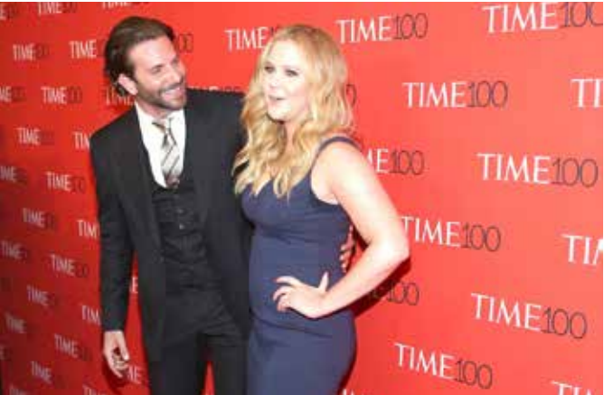
Bradley Cooper and Amy Schumer

Bradley Cooper thought Amy Schumer was 50 years old. The Hollywood star celebrated his 50th birthday on January 5, and he mistakenly asked Amy whether she’d already reached the milestone. During an appearance on ‘The Tonight Show Starring Jimmy Fallon’, Amy shared: “I saw him, and you know, ‘how are you?’, and he said ‘You know, I turned 50 this year’ and he goes, ‘You 50?’” Amy recalled being shocked by Bradley’s question. The comedian continued: “I tried to recover - you know, I’m 43 - so I’m like, ‘I will be 50! But I’m not 50 yet! Yeah no, I’m not, Bradley, but thank you for thinking of me!’” Amy also revealed that she’s often mistaken for fellow comedy stars Melissa McCarthy and Rebel Wilson. She said: “I don’t correct them. I just go, ‘Yeah, ‘Bridesmaids’ changed my life.’” Amy previously confessed to having a big crush on Bradley. The actress said on ‘The Tonight Show’ back in 2015: “I always harass him. I feel